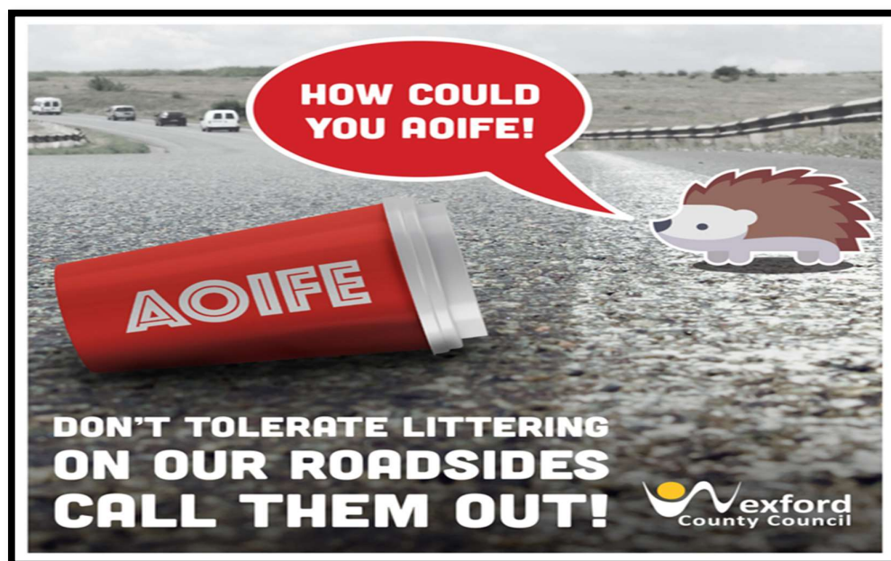
South-East Local Authorities Roadside Litter Campaign.