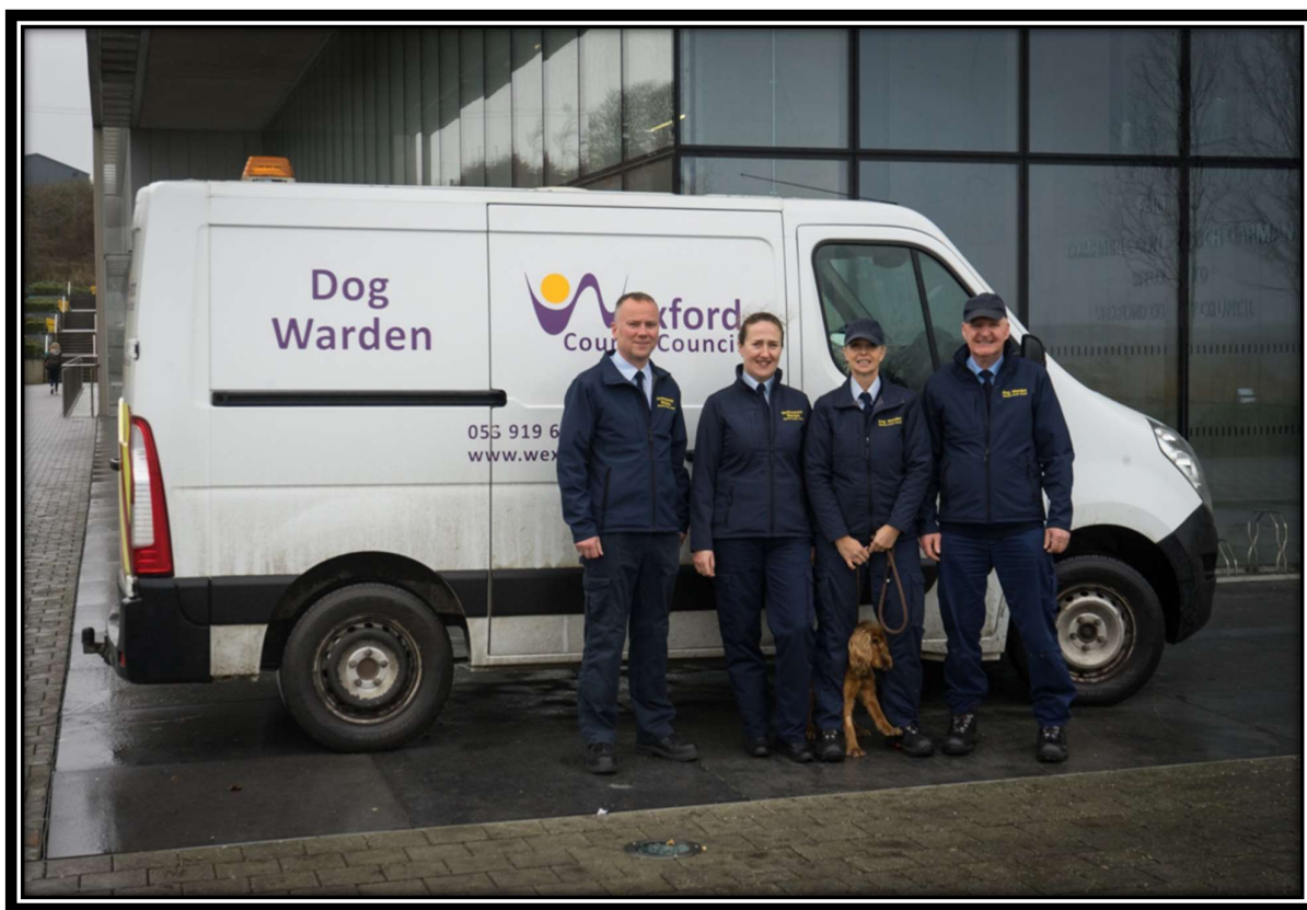
Wexford County Council Environment Section Wardens

Enforcement of all relevant legislation is a key priority for Wexford County Council's strategy to deal with litter. The Council is fully committed to enforcement of the Litter Pollution Acts 1997, as amended and the Waste Management Acts 1996, as amended and all other relevant legislation or bylaws.