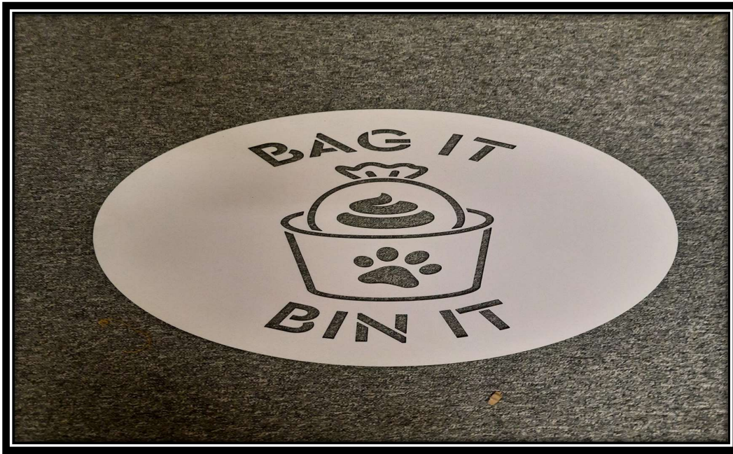
Dog fouling Stencil used by Wexford County Council for its "Bag it Bin it" Campaign.