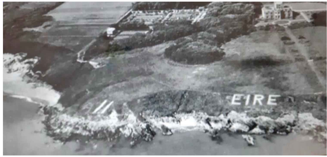
Circa 1945 - Aerial view of Cahore Point during World War II with 'EIRE II' markings on cliff edge: