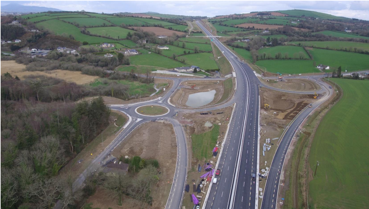
5. Mainline & R733 Junction at Camlin