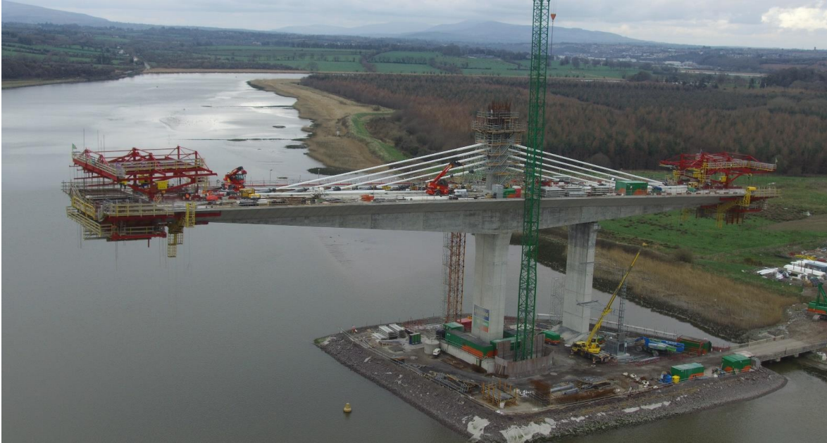
3. Deck and cable installtion at Pier 4.