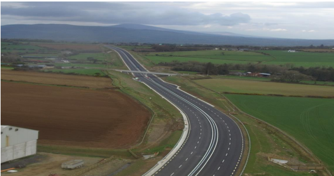
6. Mainline at Lacken