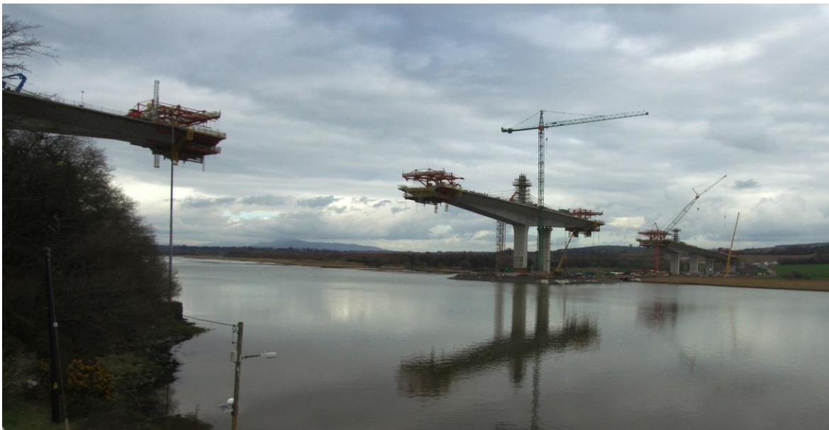
2. Rose Fitzgerald Kennedy Bridge from Pink Rock.