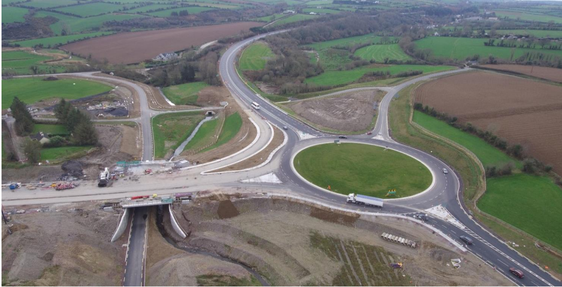
1. Glenmore Roundabout & Ballyverneen Road Underbridge.

Over 300 transition year pupils from four secondary schools in New Ross attended a project event in St. Michael's Theatre during Engineers Week. The event included a film on the design and construction of the Rose Fitzgerald Kennedy Bridge, a 3-D Virtual Reality experience of the bridge for pupils and talks on the engineering profession and the project.