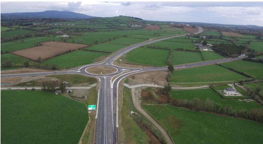
4. Mainline & Ballymacar Junction