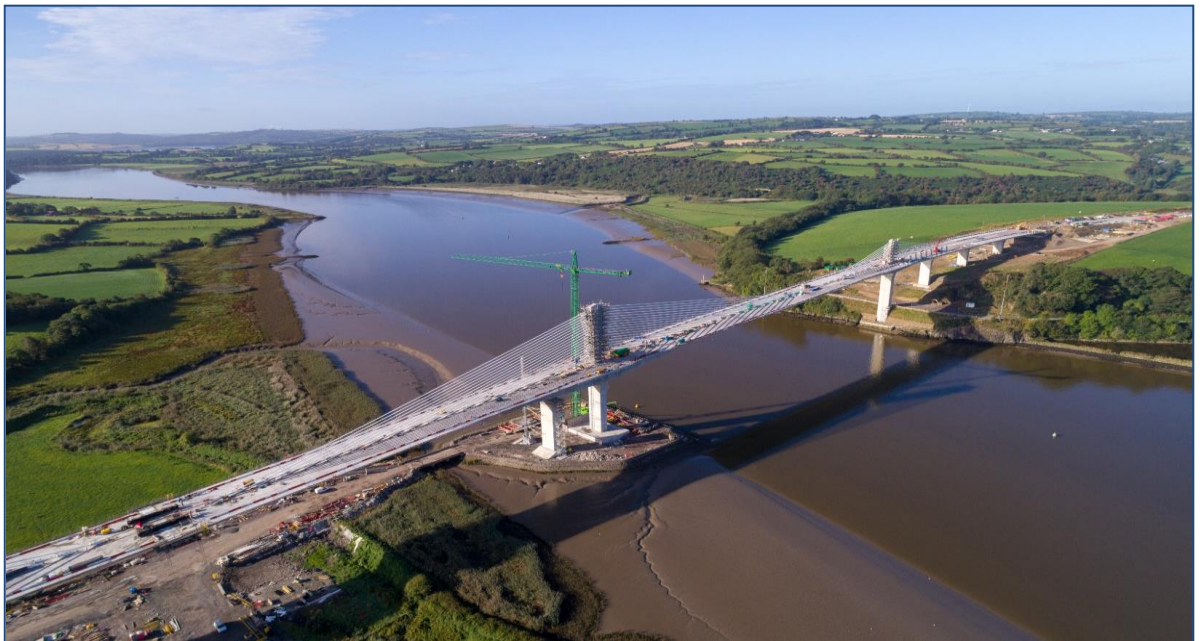
2. Rose Fitzgerald Kennedy Bridge – Aerial View from Stokestown.