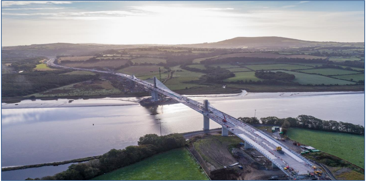
1. Rose Fitzgerald Kennedy Bridge – Aerial View from Pink Rock.