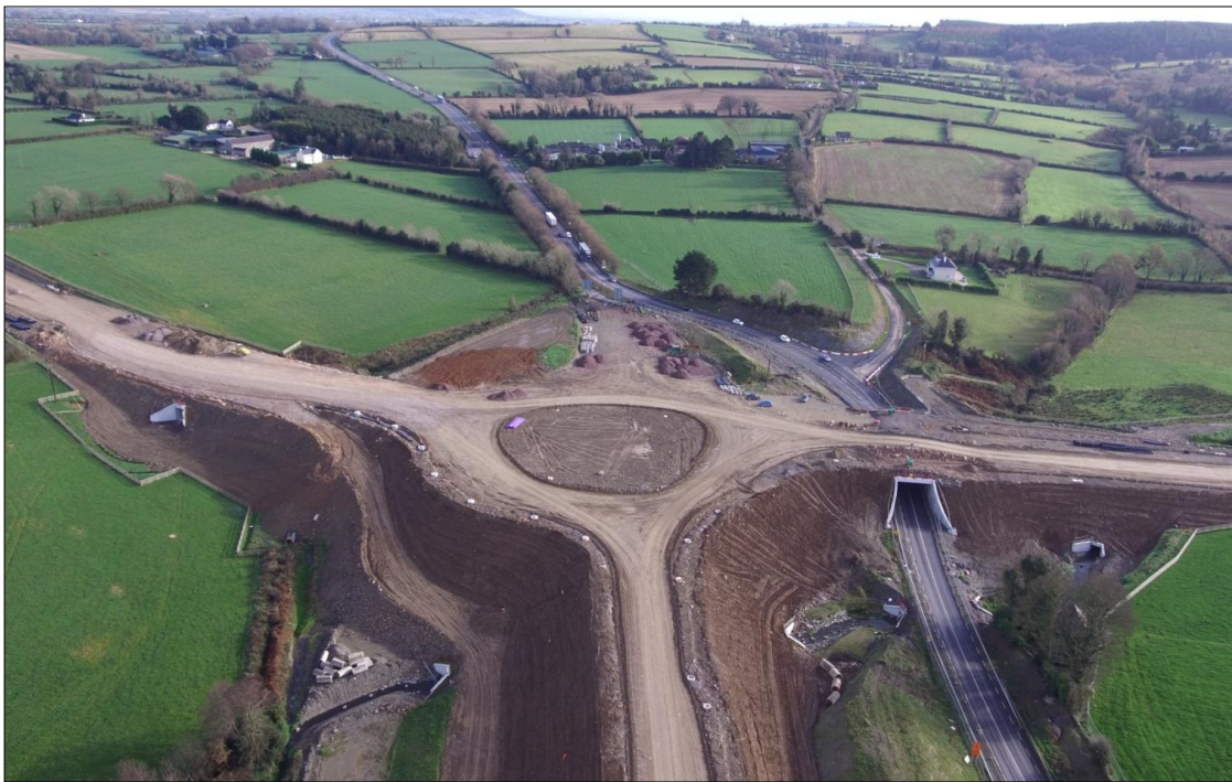
8. N25 Ballymacar Roundabout under Construction with N25 diversion route to the right.