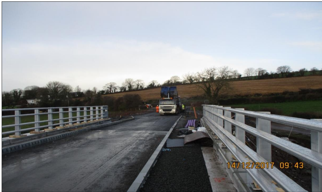
9. Camlin Road (L-8049) Overbridge and new road alignment under construction.