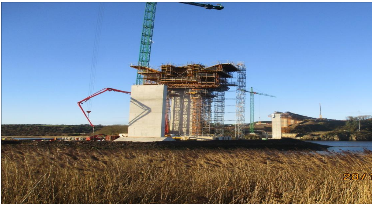
6. Barrow Bridge – Pier 4 falsework in place for pour of pier head. Note temporary support pier under construction in front of pier 4. This will be removed upon completion of bridge deck.