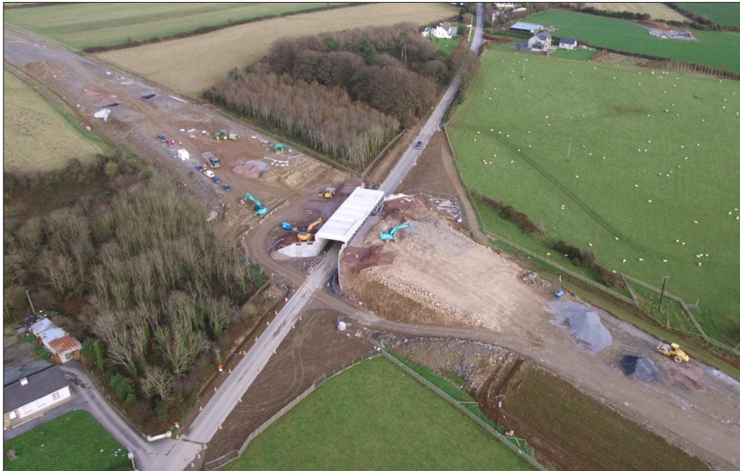
10. Lacken Road North (L-4007) Underbridge and new road alignment open to traffic under traffic management.