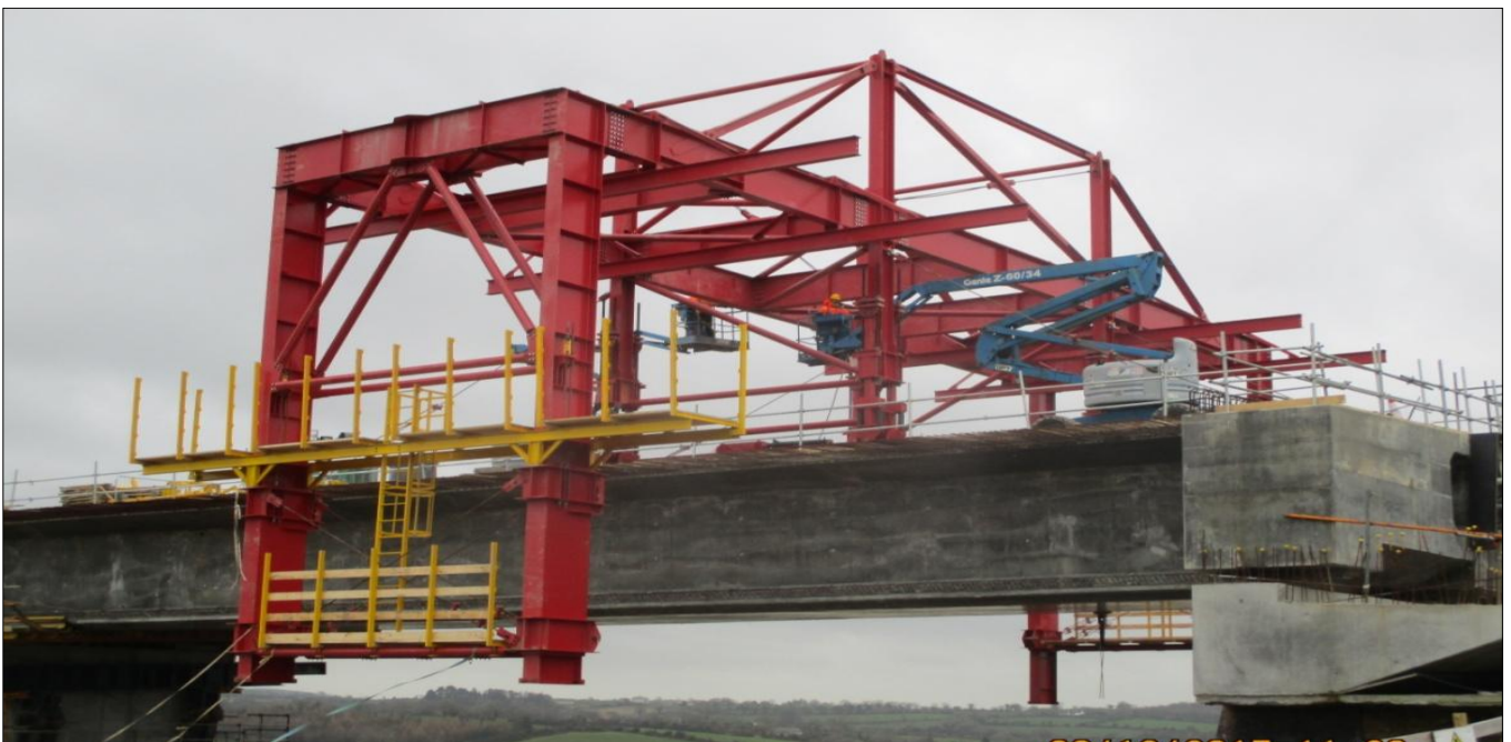
4. Wing traveller under assembly on deck span 1 for construction of deck edge sections either side of central deck.