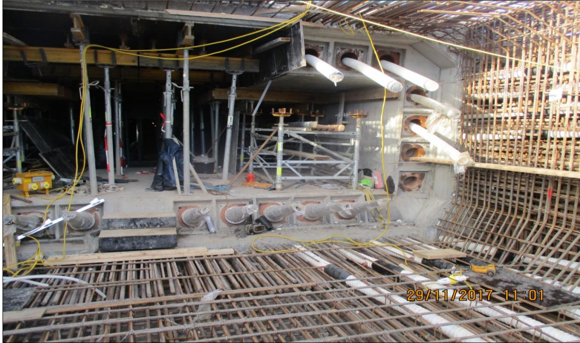
5. Barrow Bridge – view inside central deck section under construction.