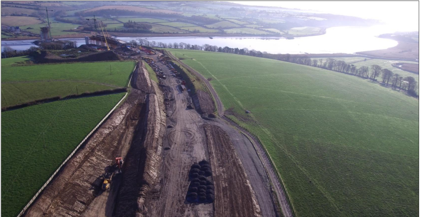
1. Barrow Bridge – Approach view from Kilkenny side of river.