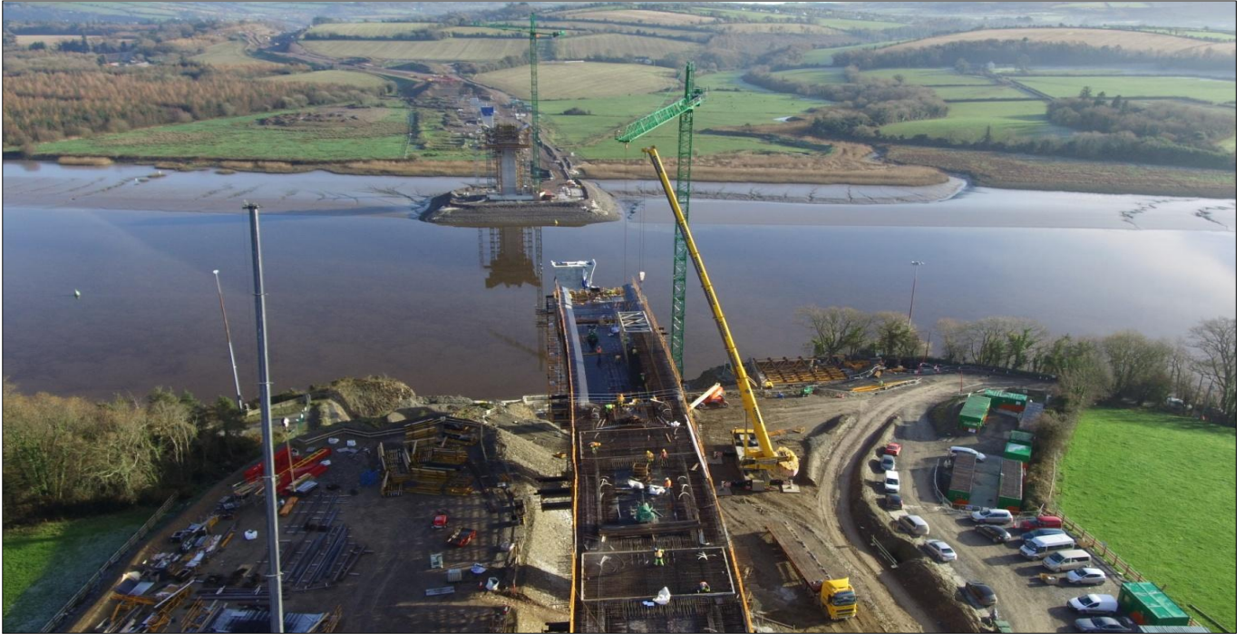
3. Barrow Bridge – Deck span 3 (in foreground) approaching pier 3. Pier 4 in background.