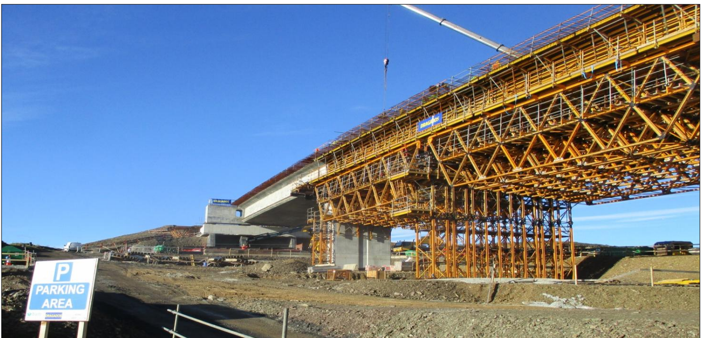
2. Barrow Bridge –deck falsework removed from central deck span 1, still in place for deck span 2.