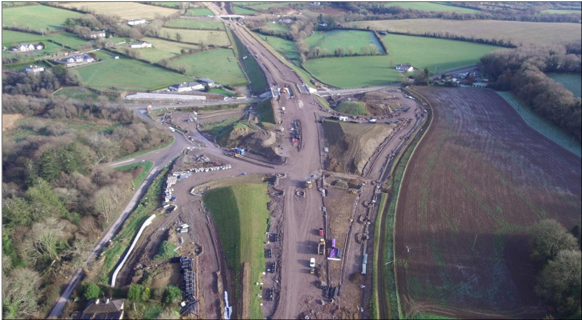
7. R733 grade separated junction taking shape.