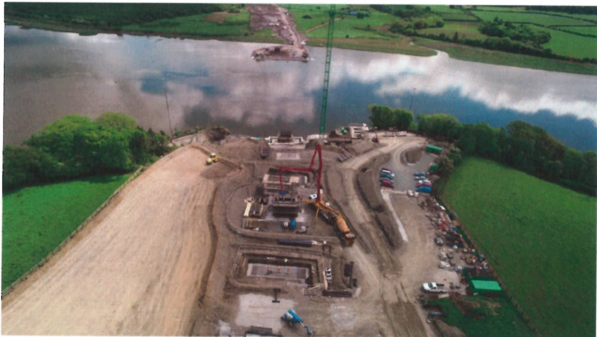
2. Barrow Bridge – Pink Rock pier