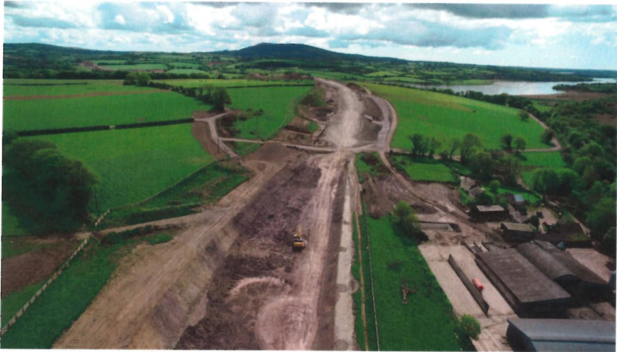
1. Earthworks on Glenmore side with Pink Rock in background.

newsletter and website. The Project Liaison Office will continue to liaise and consult with all landowners and other interested parties for the duration of the project.