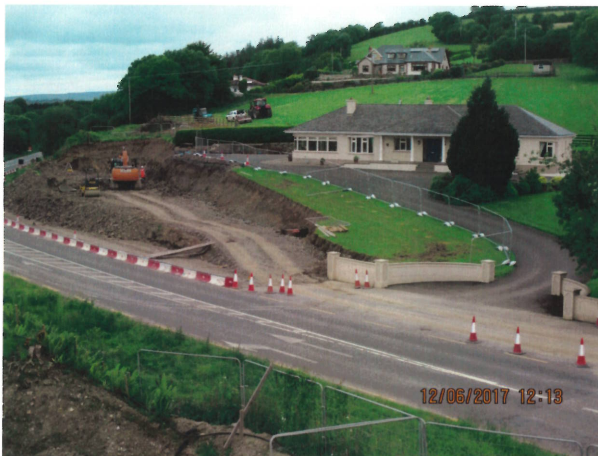
7. Preparation for retaining wall base at R733