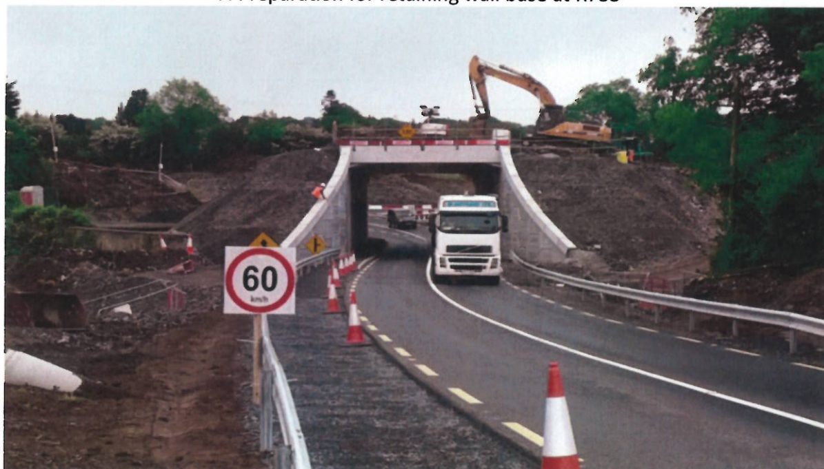
8. N25 temporary diversion route via Ballymacar realignment & Underbridge - view Eastbound