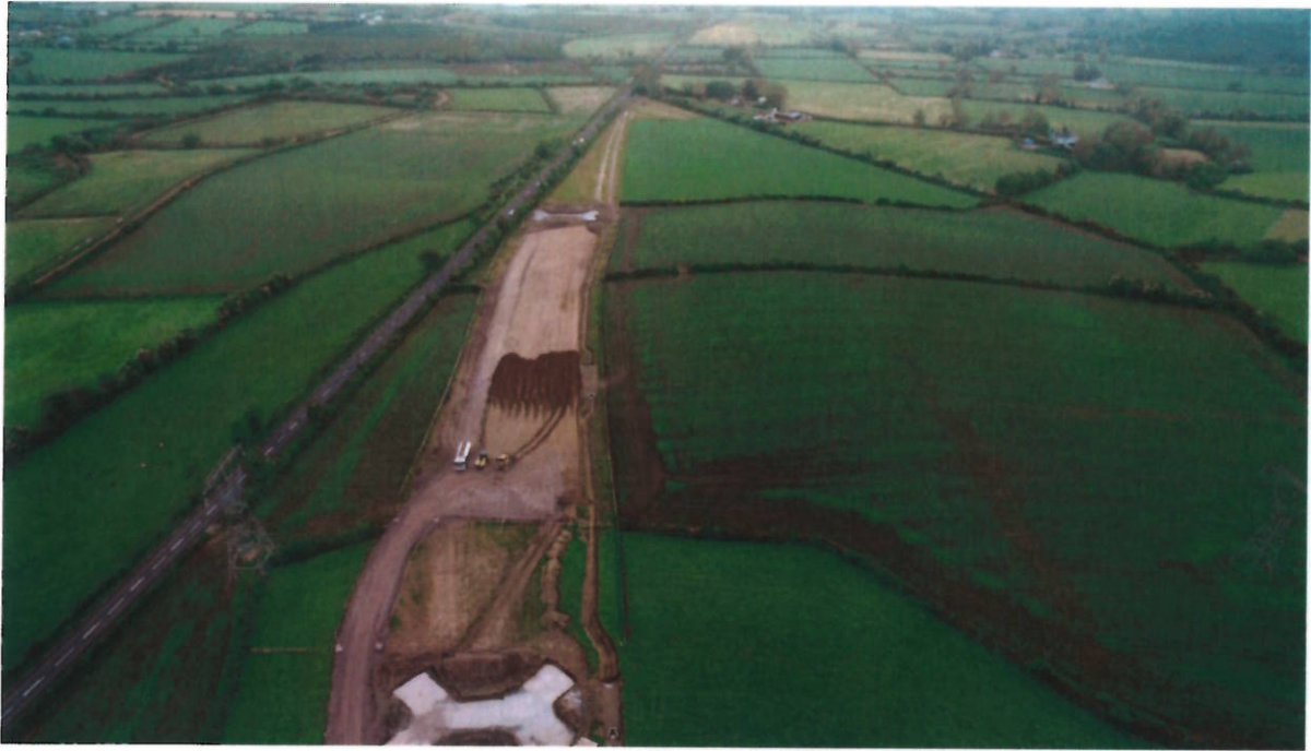
9. N30 Tie-in – towards Clonroche