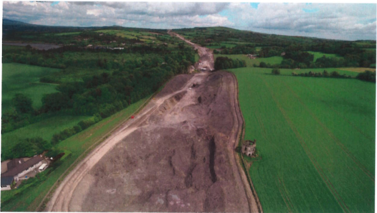
6. Earthworks at Stokestown