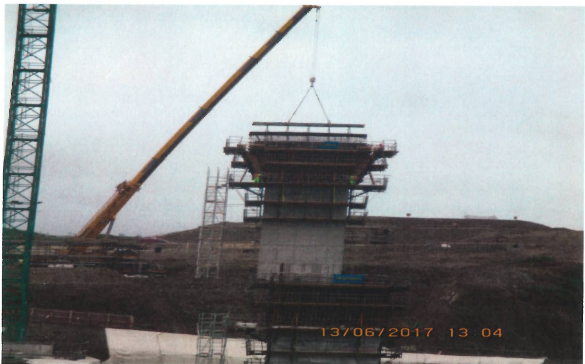
4. Barrow Bridge - Pier 2 & 3 construction at Pink Rock.