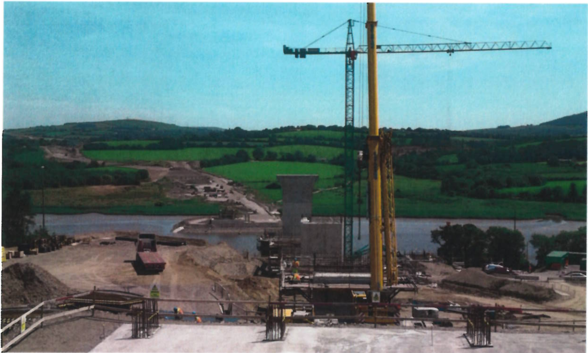
3. Barrow Bridge – Pink Rock piers rising towards deck soffit level.