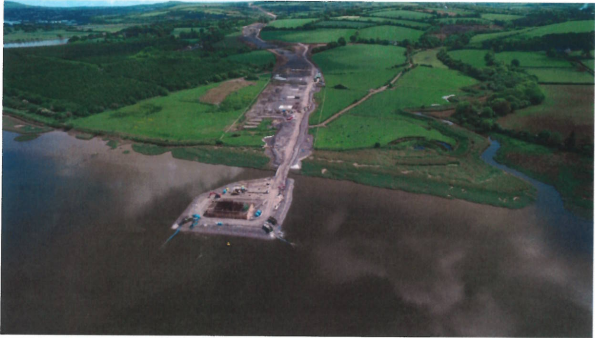
5. Barrow Bridge - Pier 4 (river pier) in Foreground