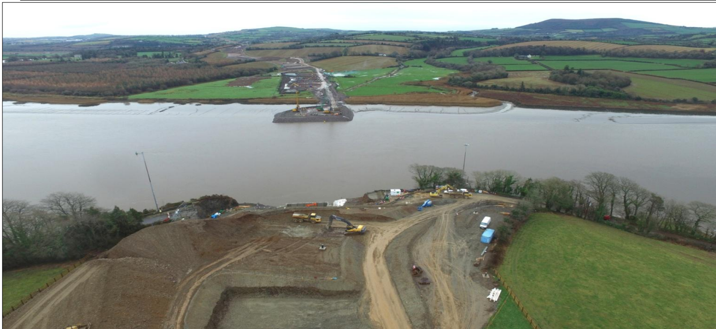
3. Barrow Bridge - Temporary access works and excavation works for Pier 3 foundations at Pink Rock.