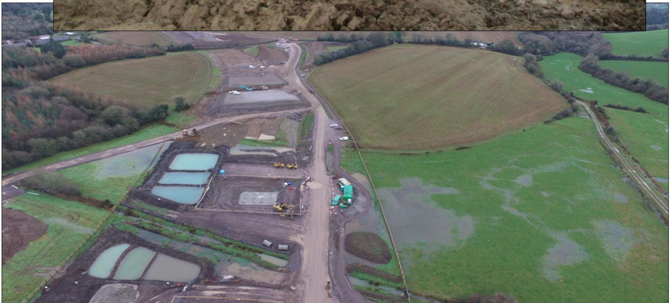
Earthworks operations at Cut 3 in Stokestown