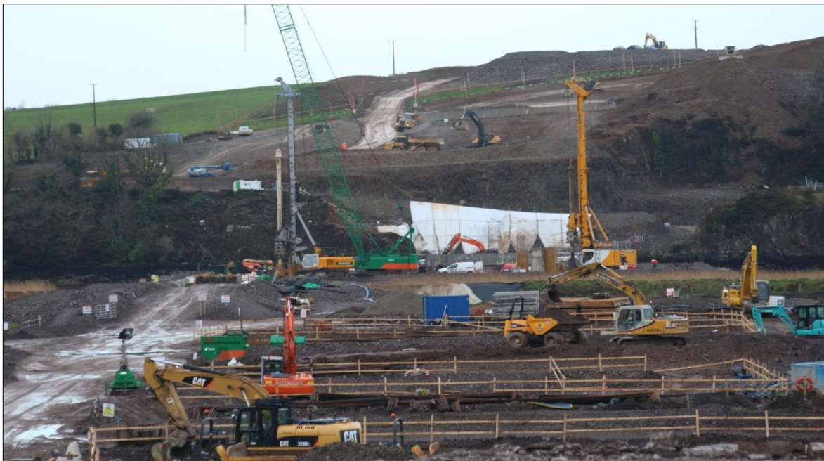
4. Barrow Bridge - Works at Pink Rock in foreground looking over to Pier 4 and works at Stokestown in background.