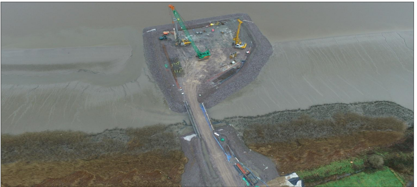
2. Barrow Bridge - Piling operations at temporary impermeable working area for Pier 4 (river pier)