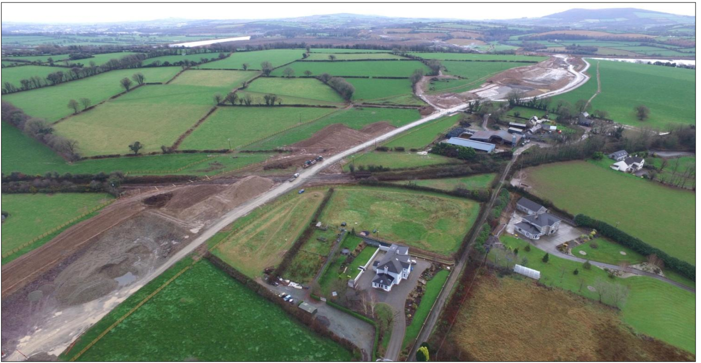
1. Earthworks operation on Co. Kilkenny side with River Barrow in background.