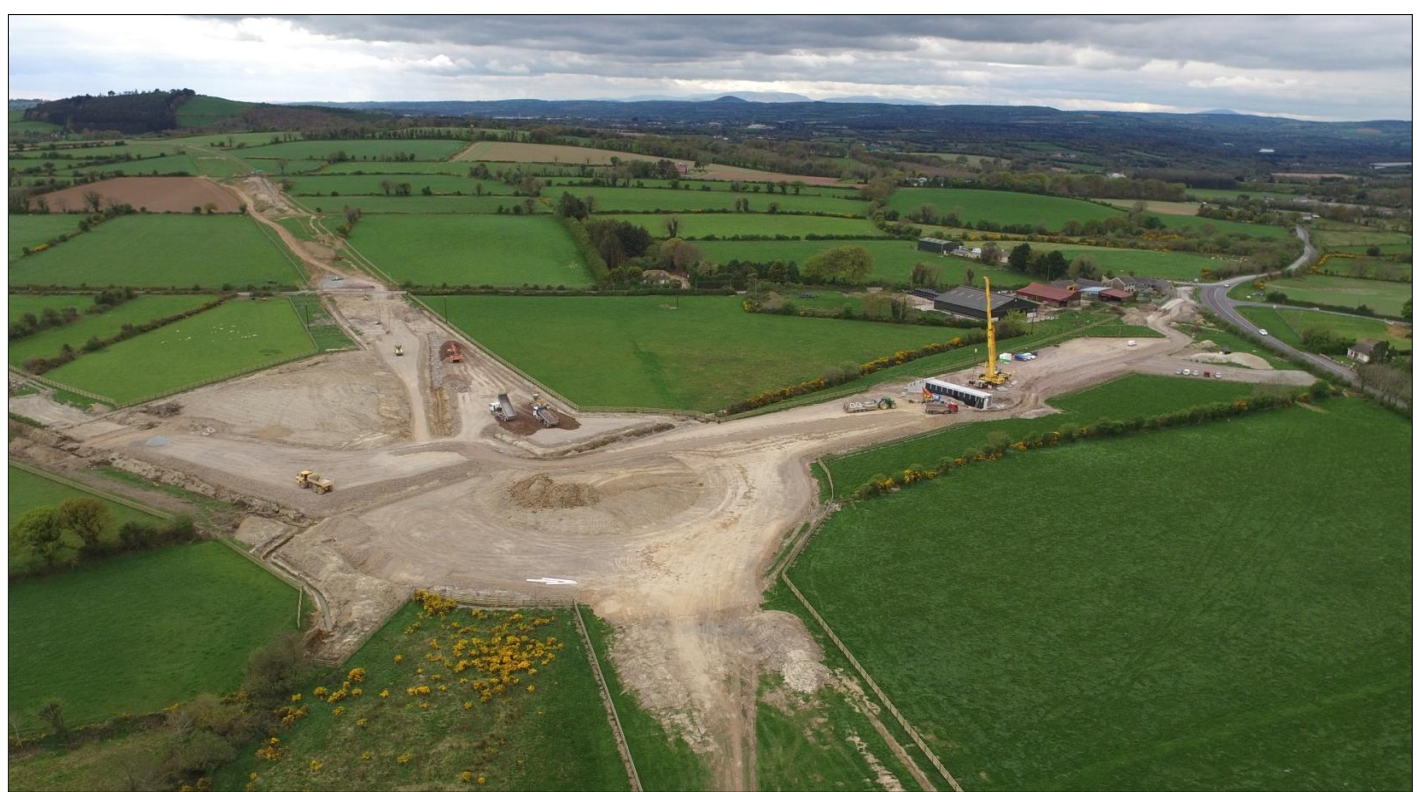
R733 Underbridge 11. N30 Corcoran's Cross Roundabout - exisitng N30 to right of photo