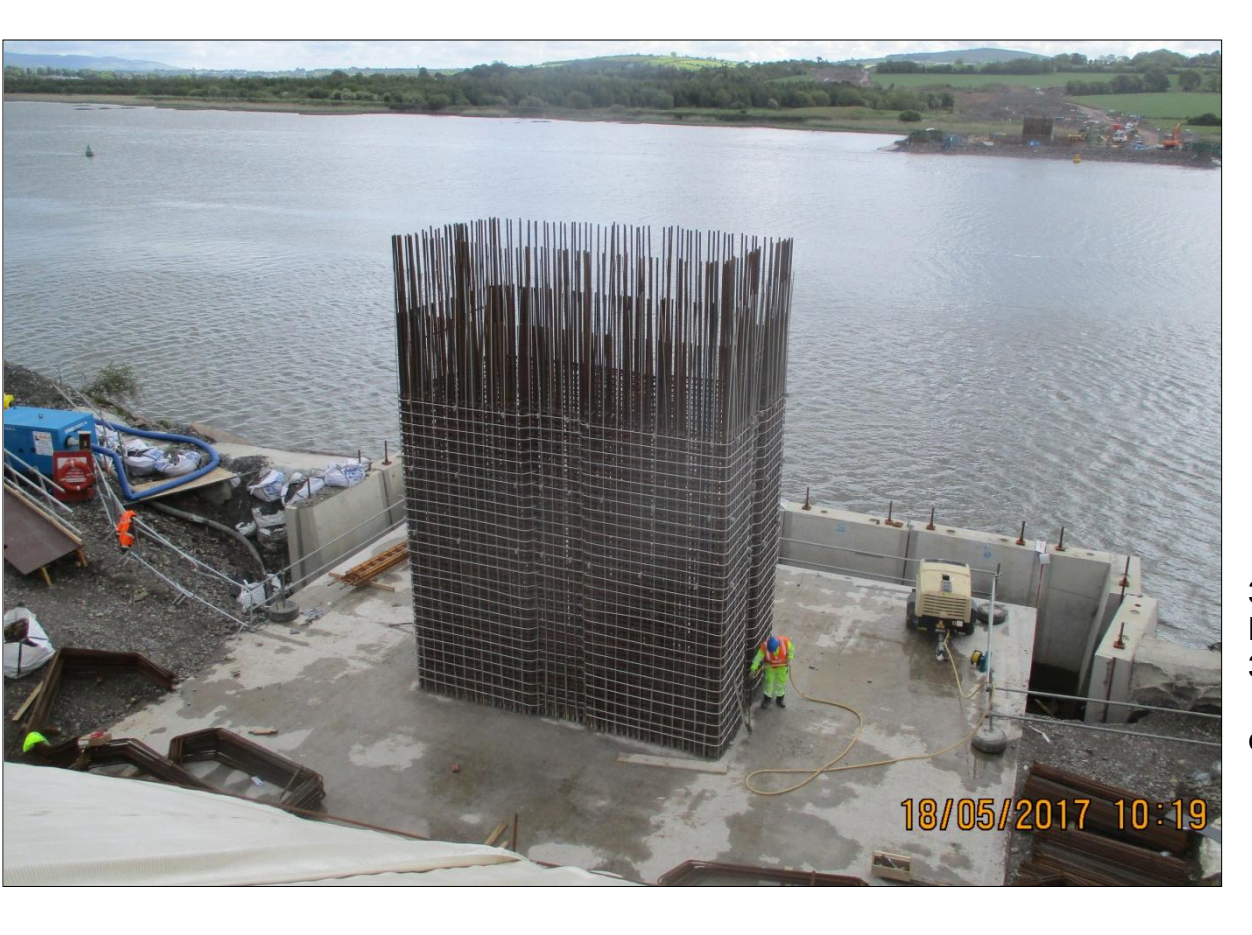
Barrow Bridge – Pier base following concere pour.