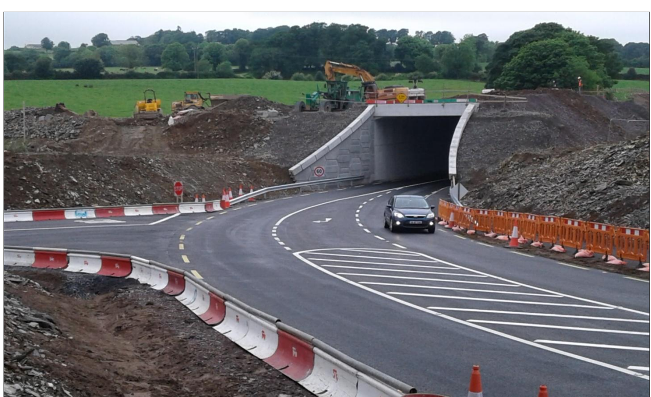
temporary diversion route via Ballymacar realignment & Underbridge - view eastbound 9.N25 temporary diversion route via Ballymacar realignment & Underbridge - view westbound