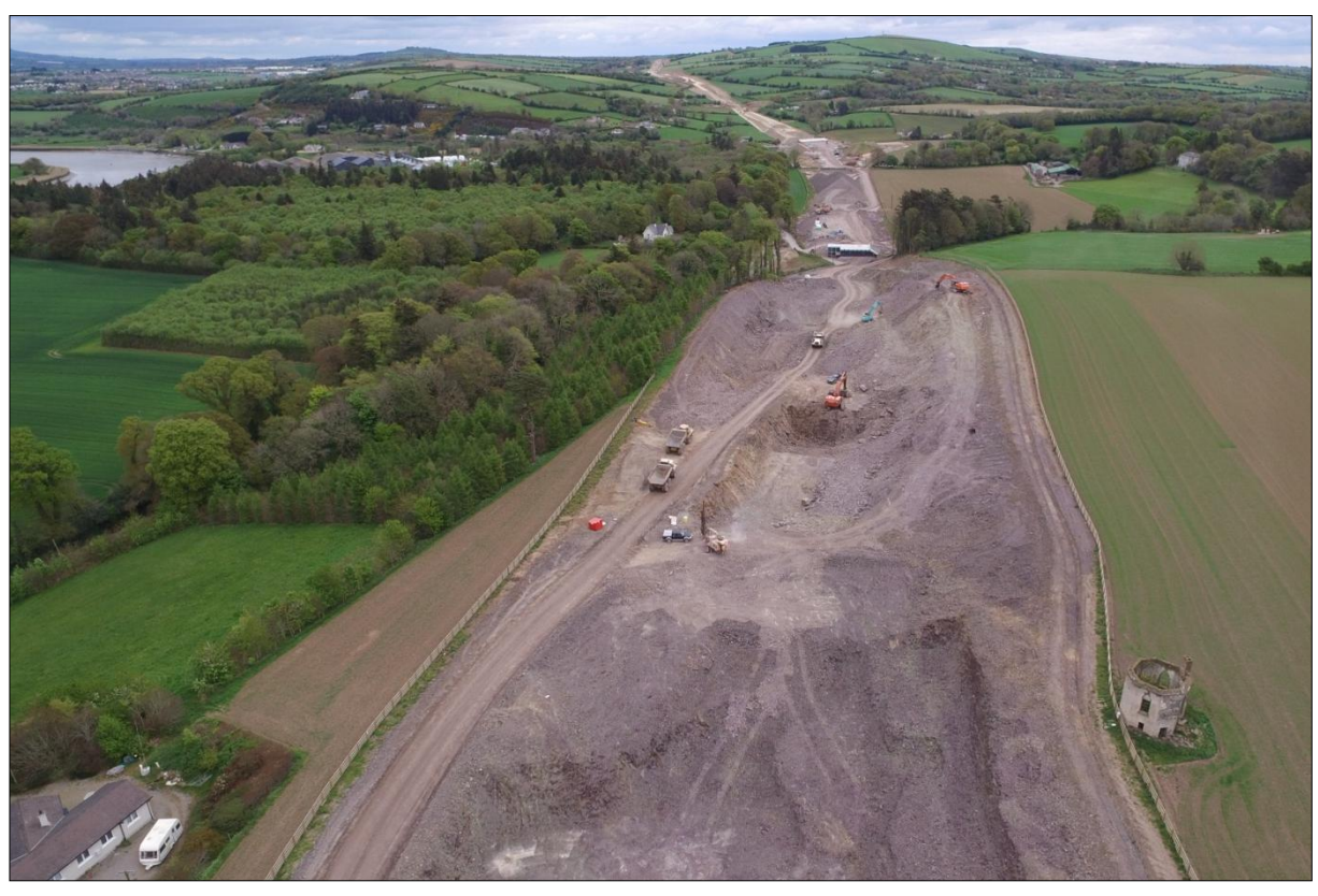
7. Cut 3 Rock blasting and earthworks site.