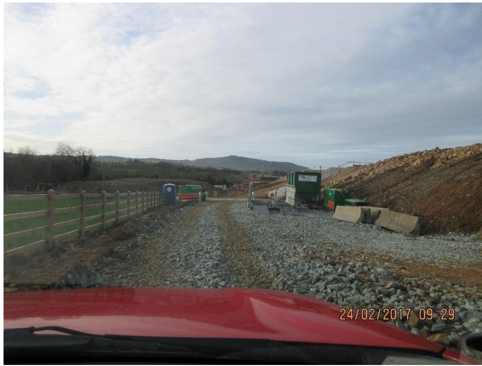
Wheelwash installed and at Ballygullen Site Access