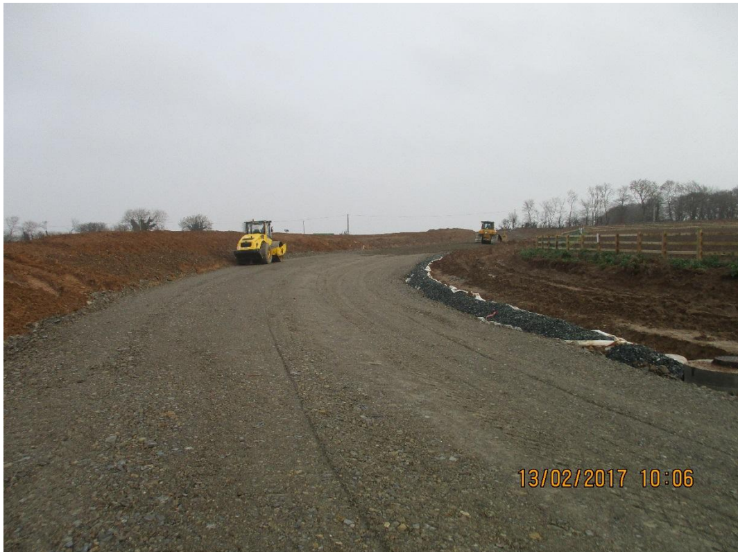
Capping Monroe Link Rd