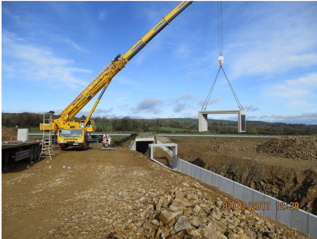
Extension underpass, Frankfort