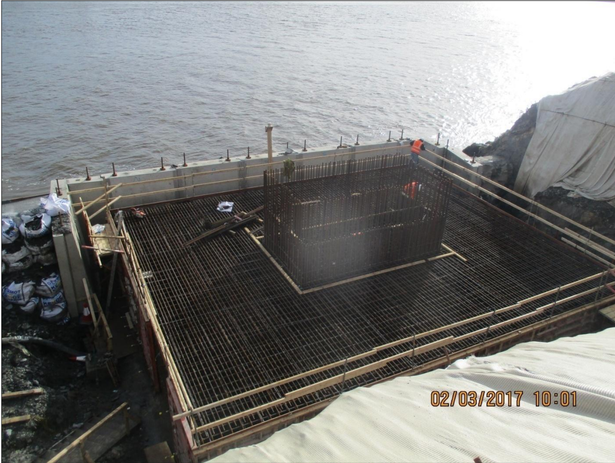
2. Barrow Bridge - Pier 4 (river pier) with piling complete.