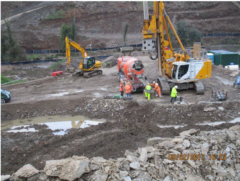
N30 River Urrin Piling Operation