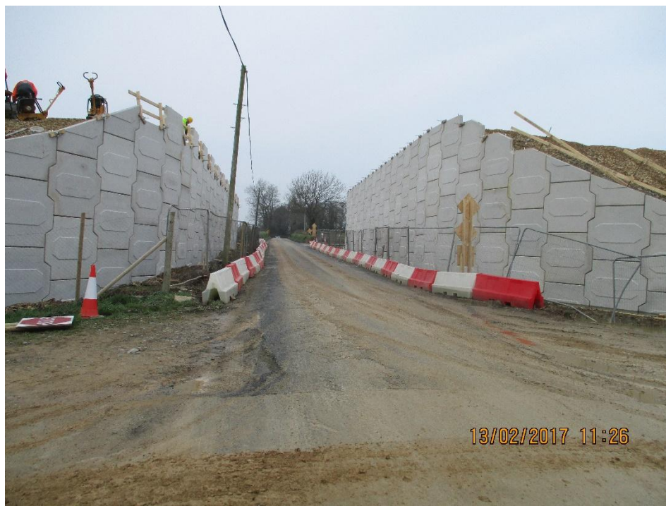
Structure at L1027 Ballygullen road at site access