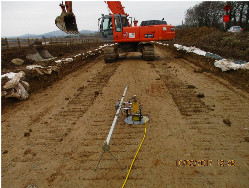
Plate Bearing Testing Monroe Link Rd