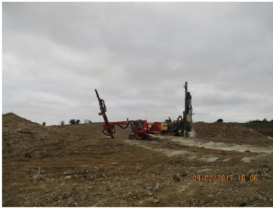
Drilling for rock blasting at Frankfort