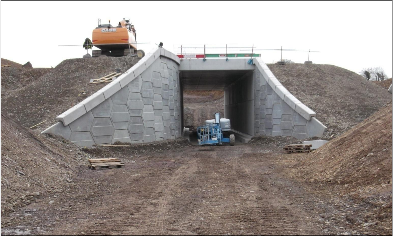
operations at Cut 4 in Camlin in background. 5. R733 Stokestown Road Underbridge