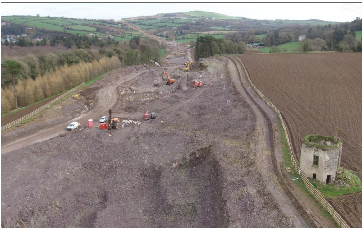
4. Earthworks operations in Cut 3 at Stokestown in foreground, earthworks