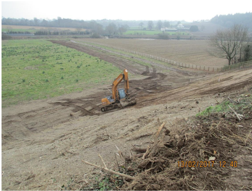
Topsoil Strip at Approaches to Slaney River