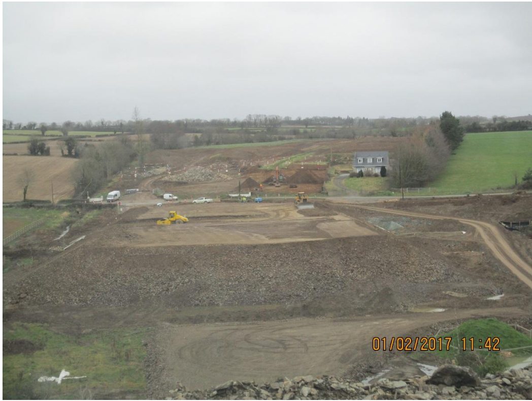
Placing Class 1 N30 Fill4 – Urrin River View North