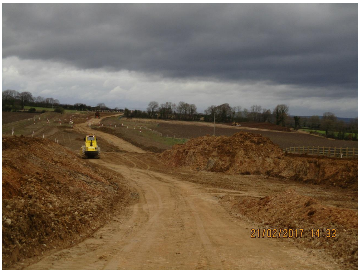
Haul Road Preparation N80 Looking West