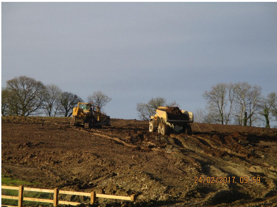
Stockpiling Topsoil Ch 22+000