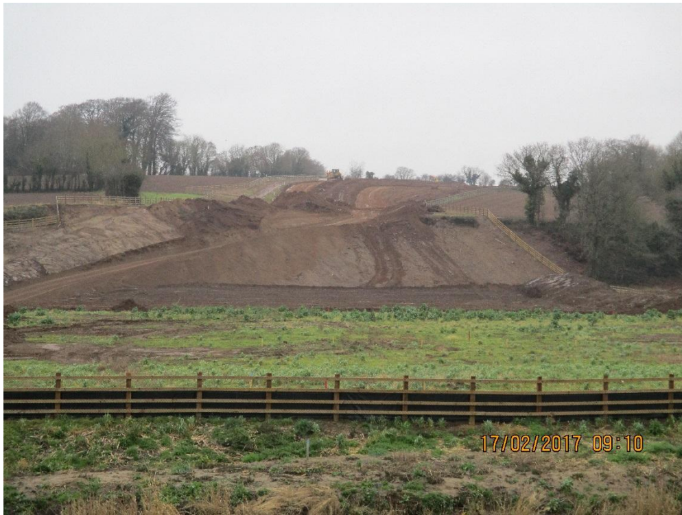
View from Slaney River Looking West