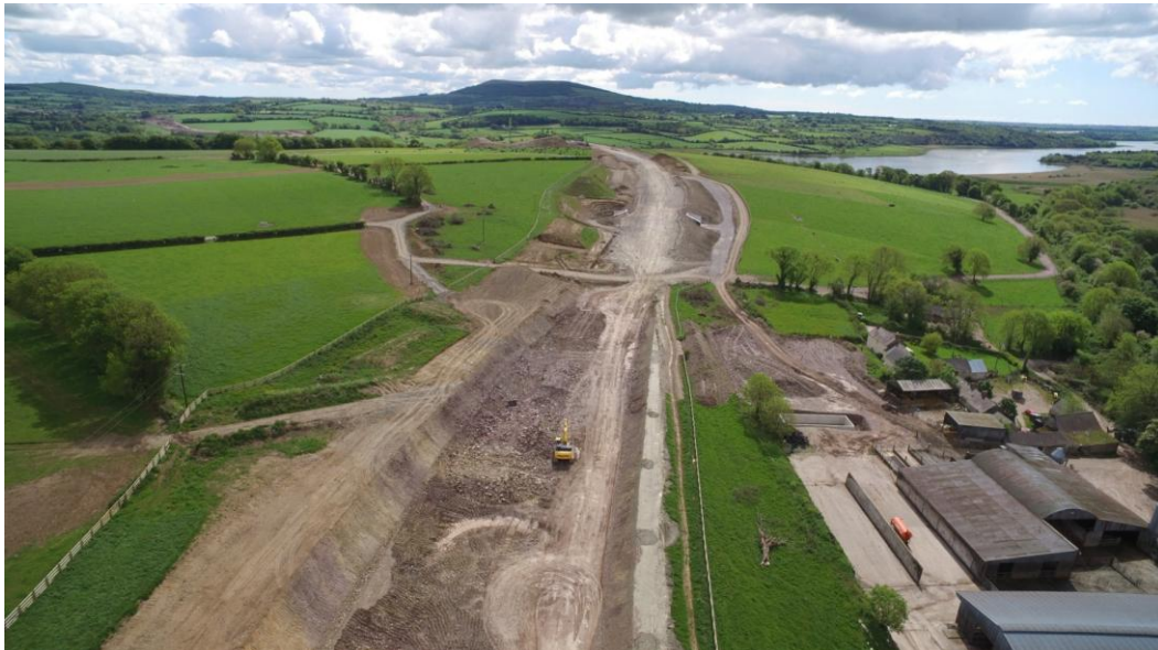
Earthworks on Glenmore side with Pink Rock in background.