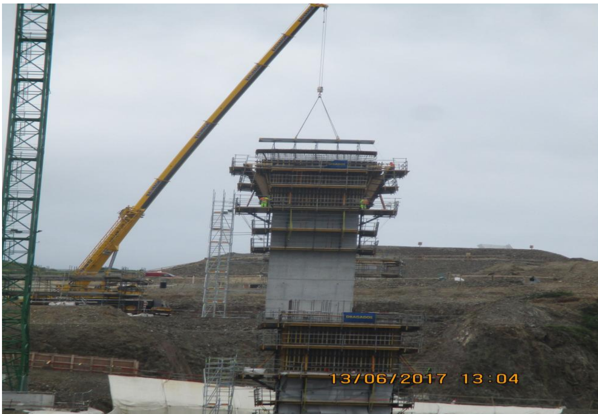
4. Barrow Bridge - Pier 2 & 3 construction at Pink Rock.