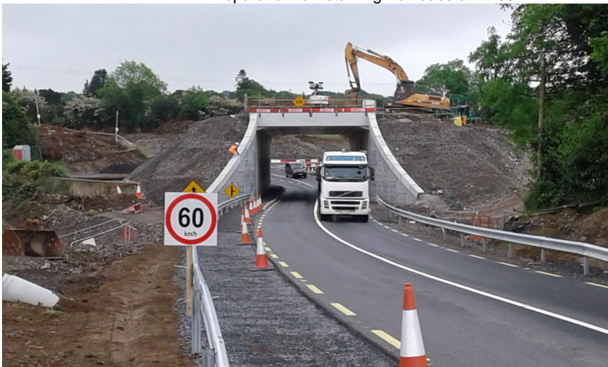
8. N25 temporary diversion route via Ballymacar realignment & Underbridge - view Eastbound