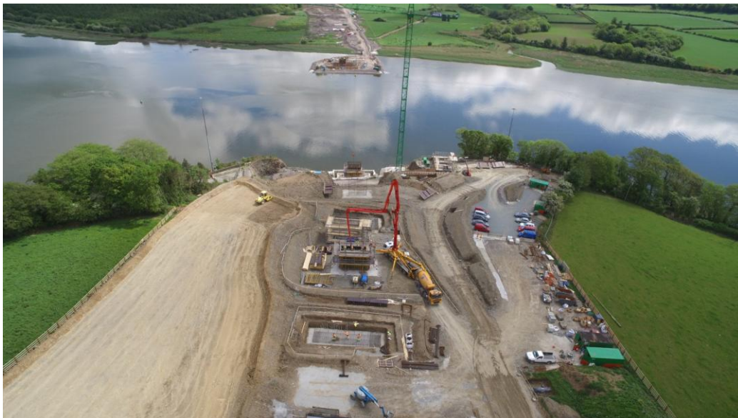
2. Barrow Bridge – Pink Rock pier