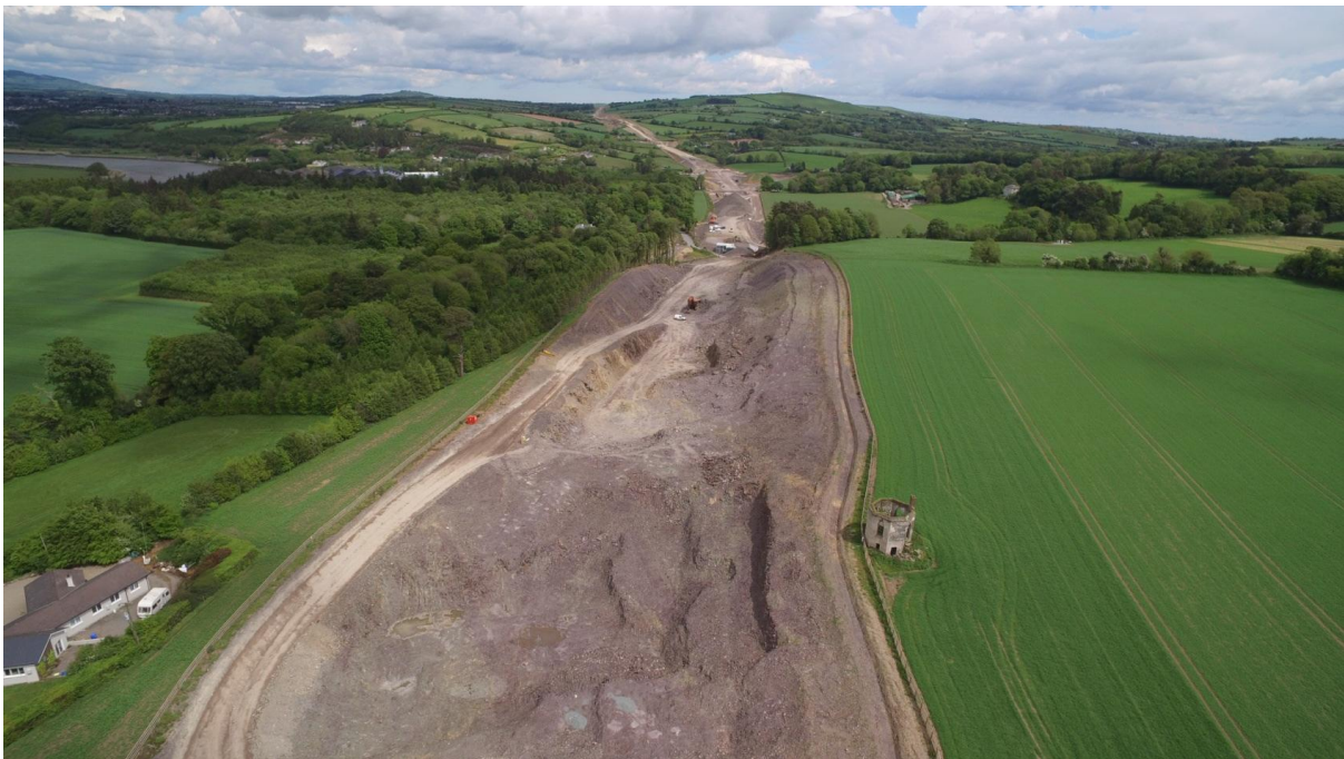
6. Earthworks at Stokestown