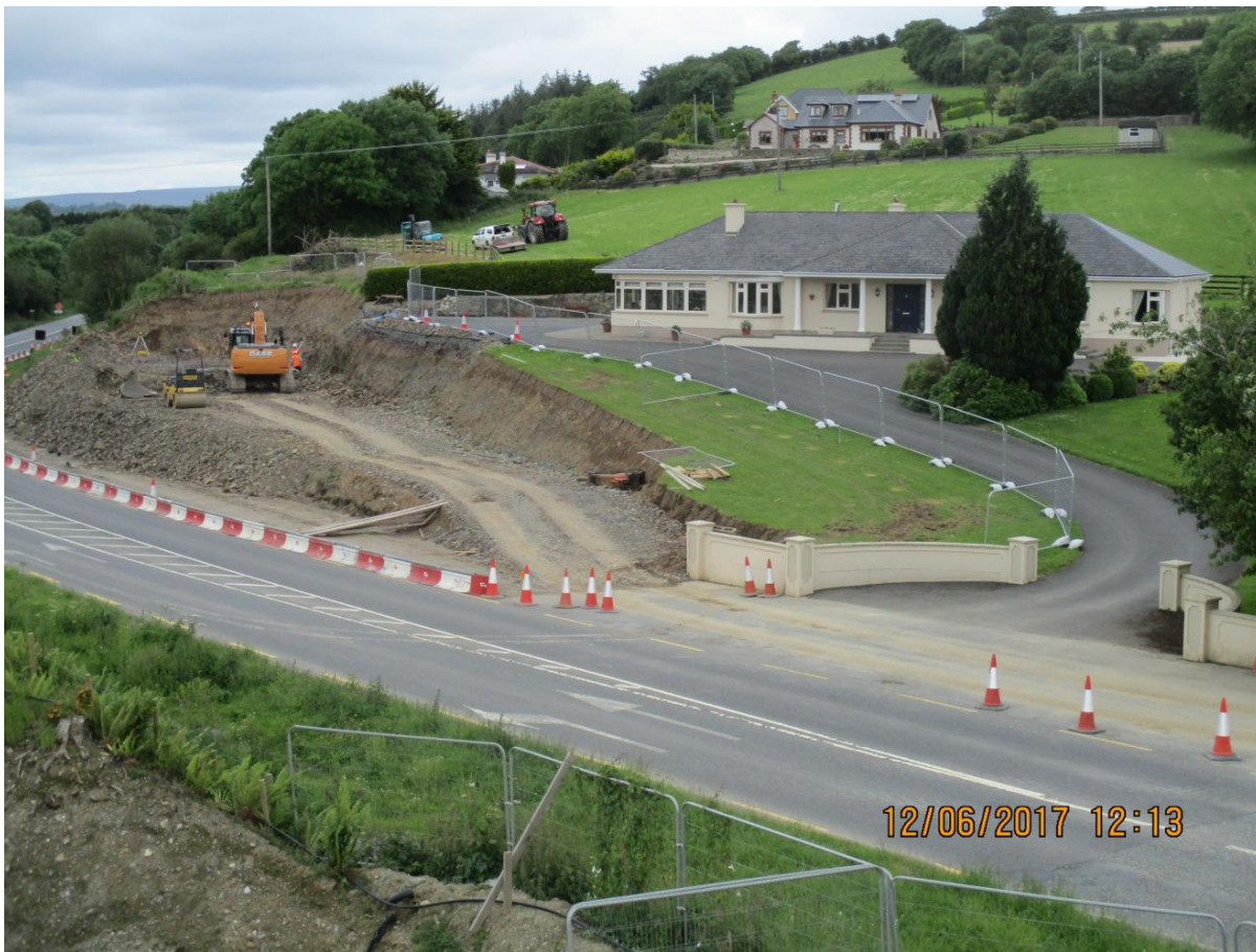
7. Preparation for retaining wall base at R733