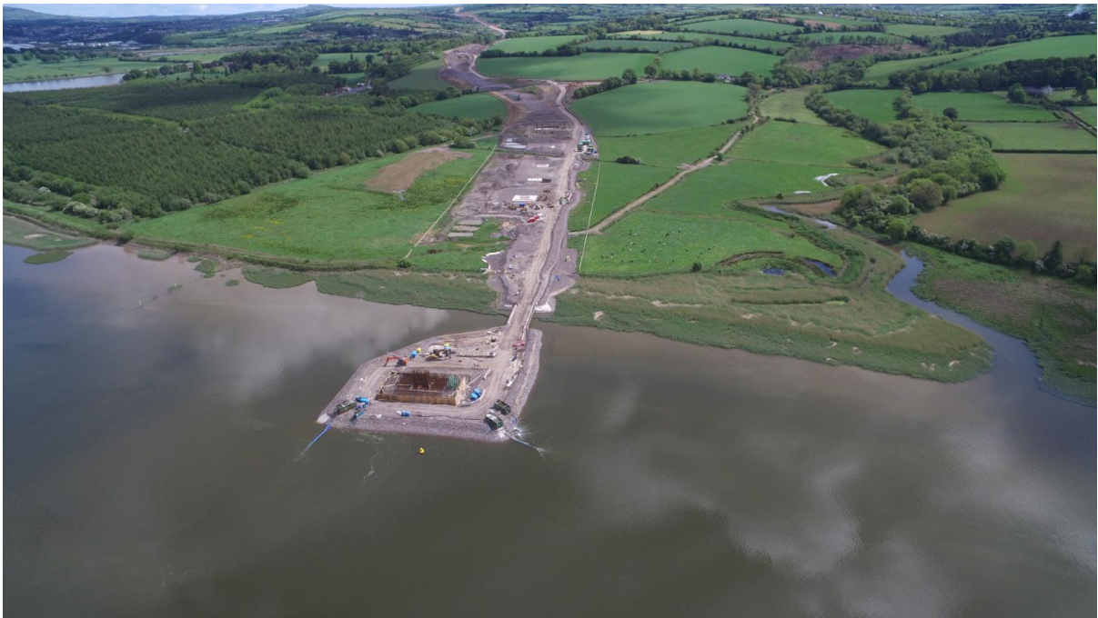
5. Barrow Bridge - Pier 4 (river pier) in Foreground