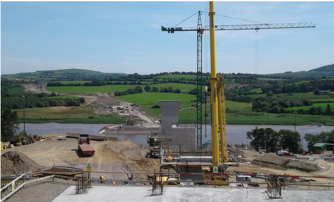
3. Barrow Bridge – Pink Rock piers rising towards deck soffit level.