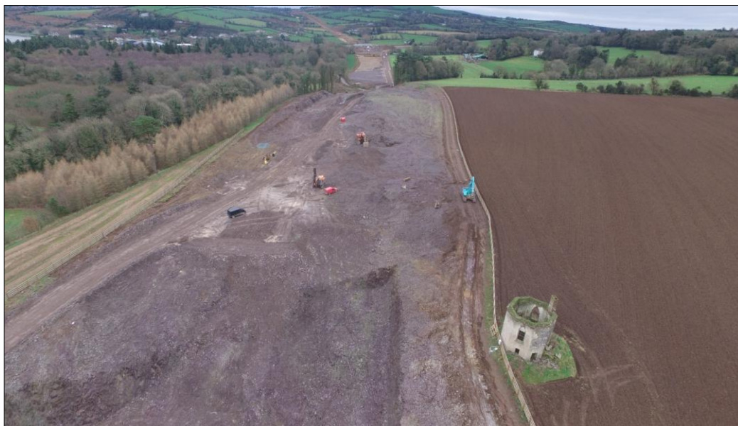
5. Earthworks operations in Cut 3 at Stokestown in foreground, earthworks operations at Cut 4 in Camlin in background.