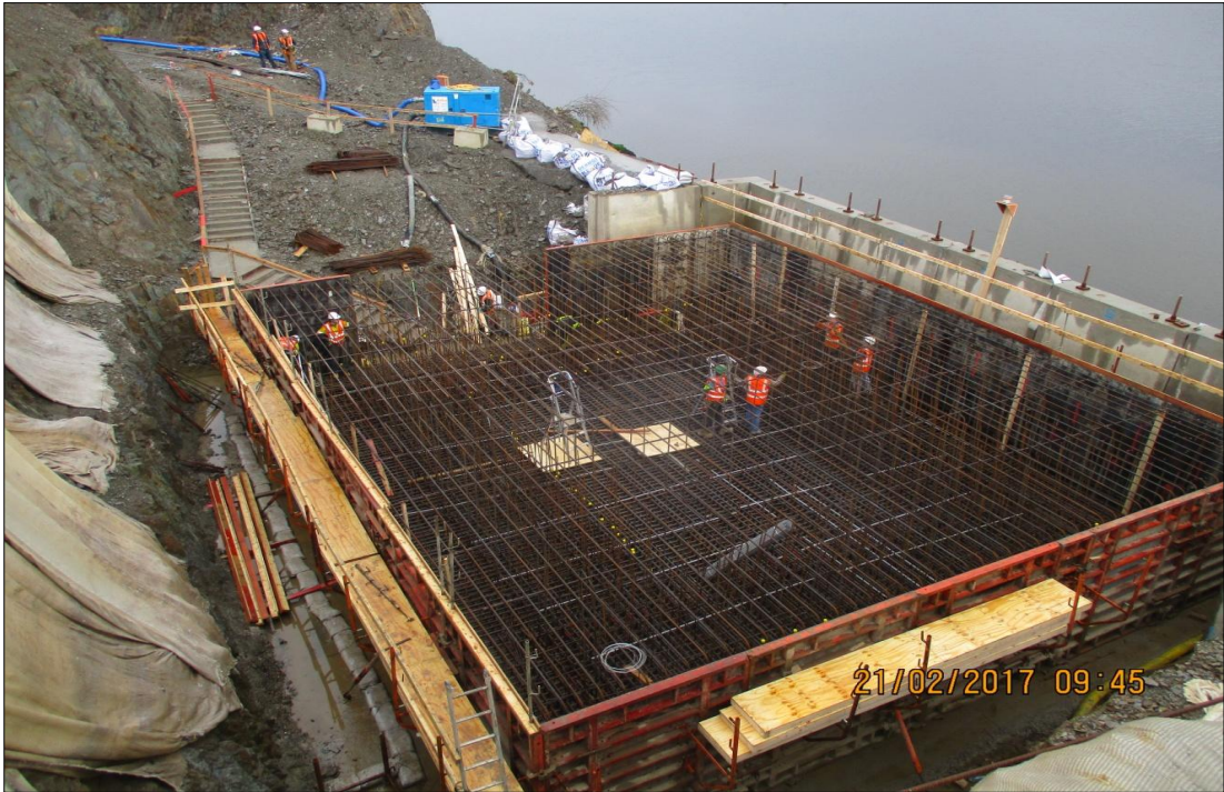
3. Barrow Bridge - Steel fixing for Pier 3