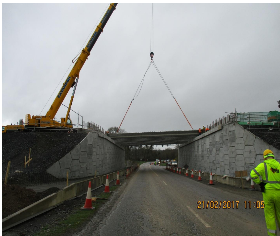
6. Beam Lift operations under traffic management at R733 Underbridge