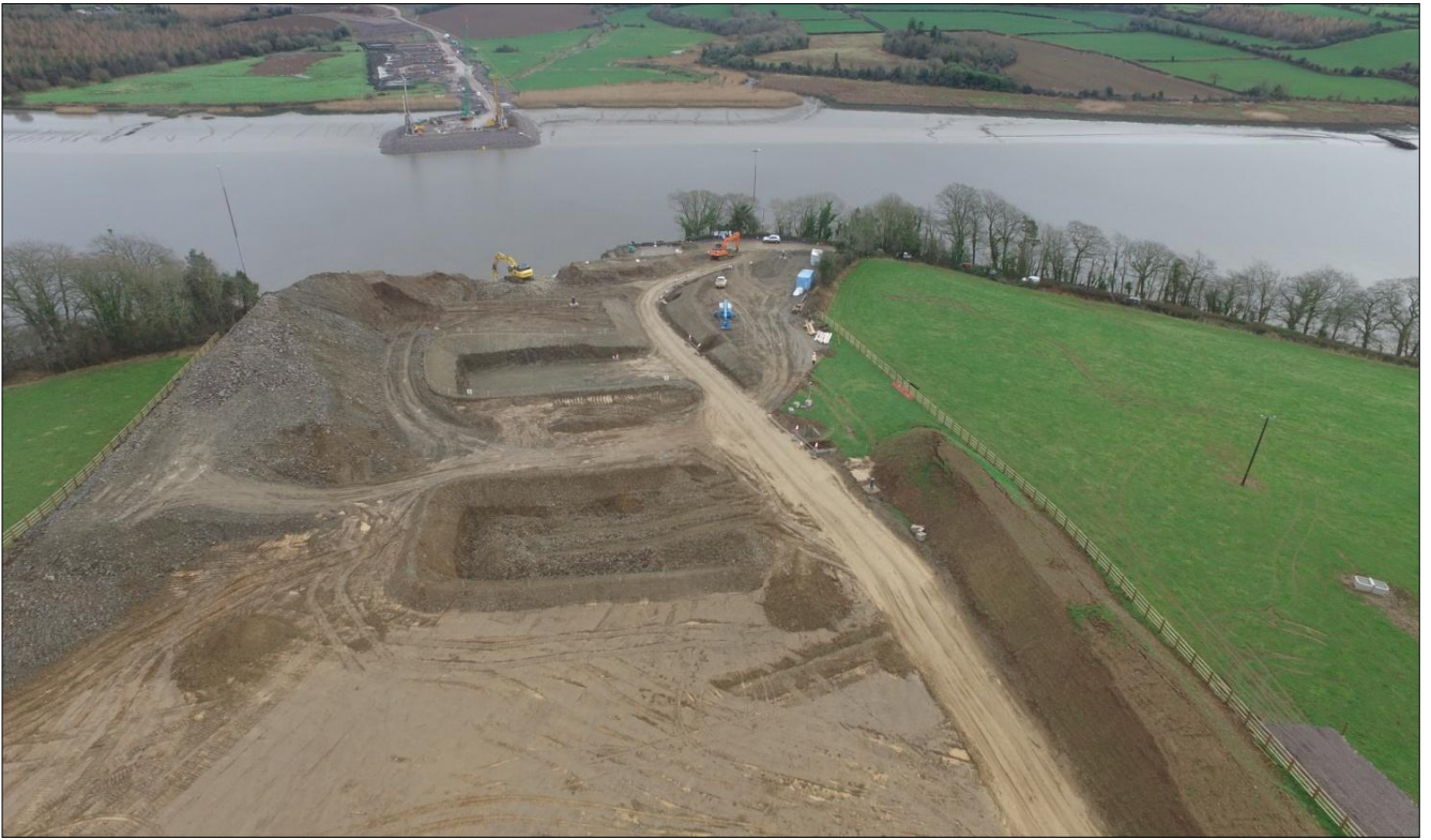
1. Barrow Bridge - Preparatory works for pier foundations on Co. Kilkenny side in foreground with Pier 4 in background.