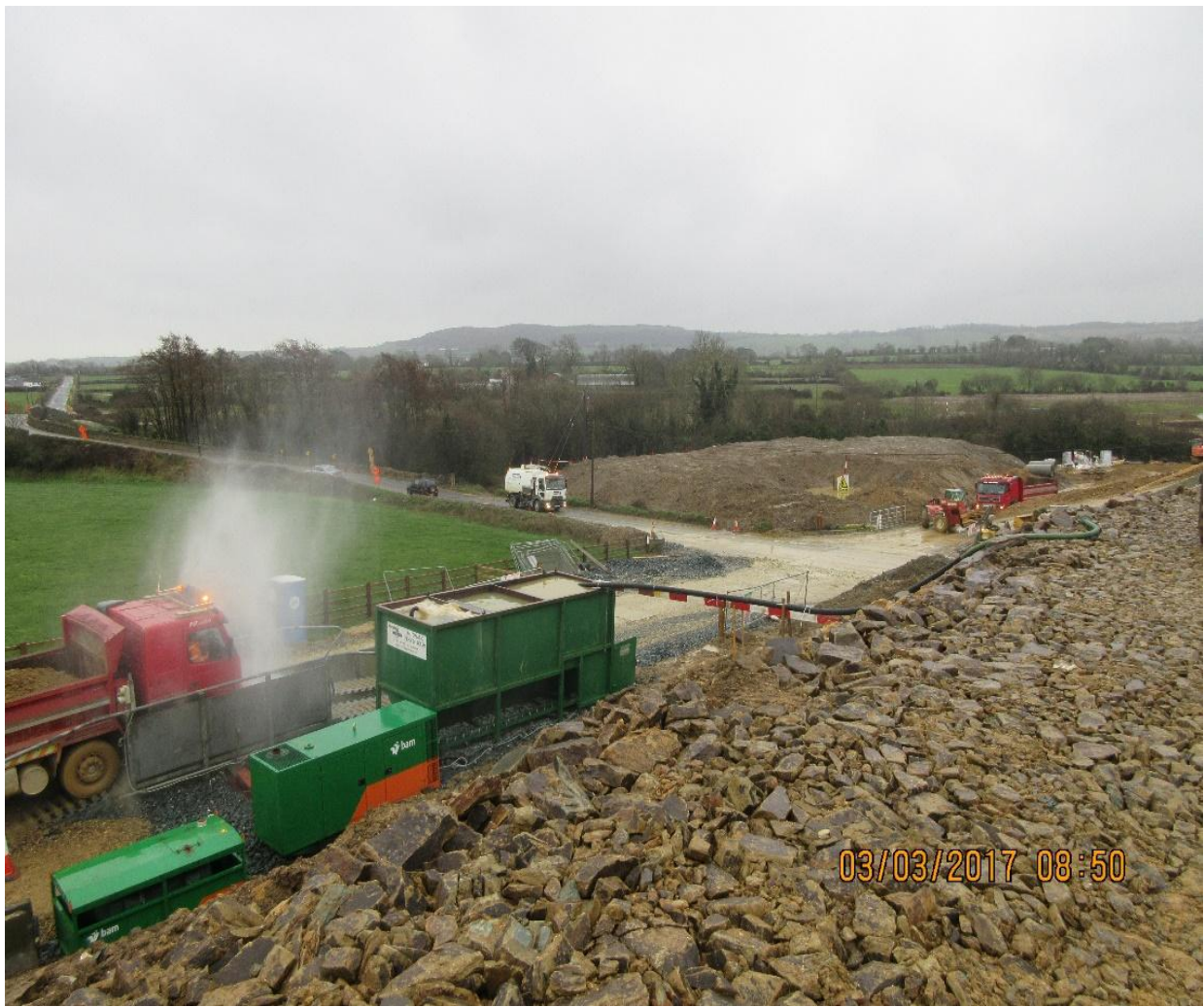
Wheelwash in operation at Ballygullen