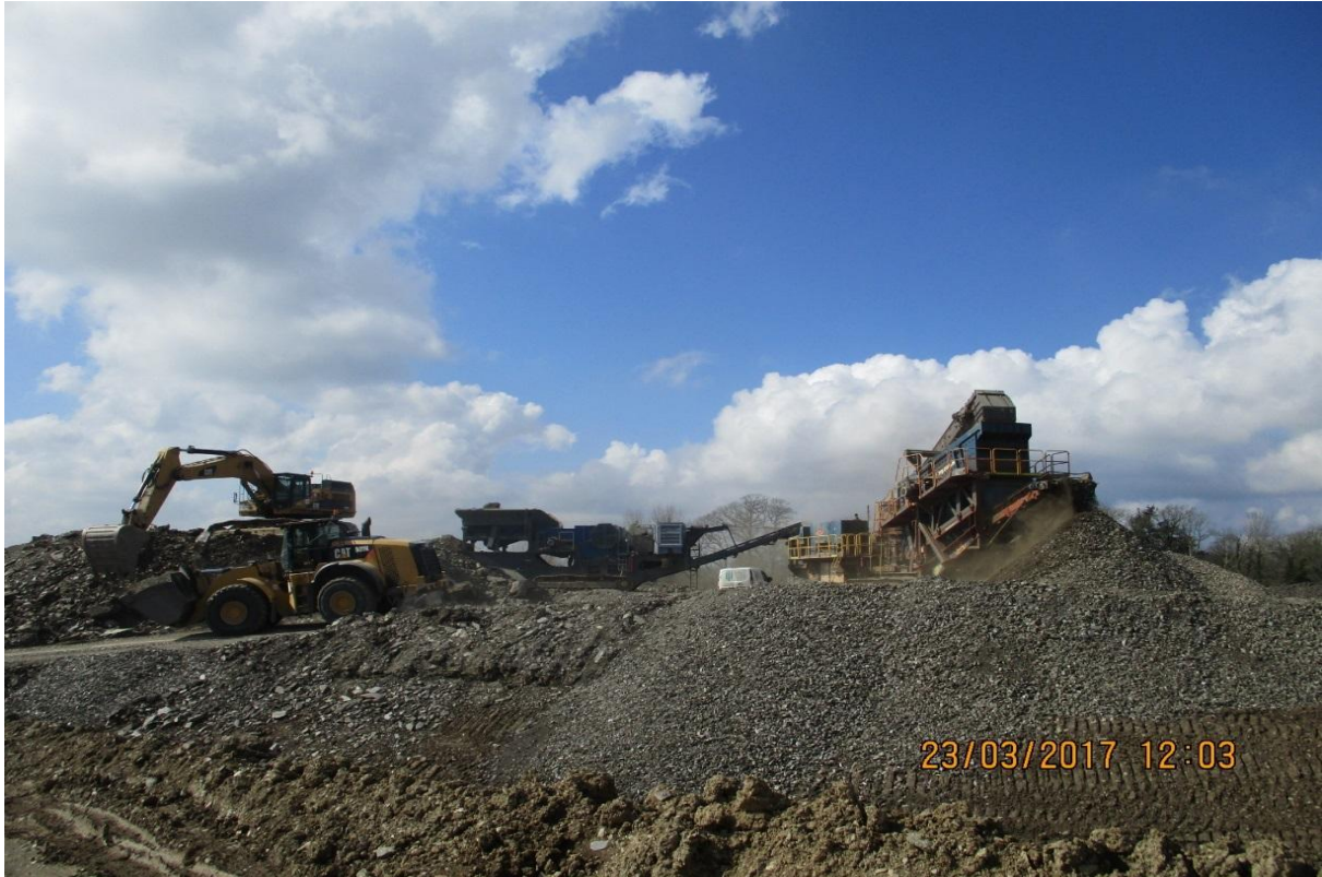
Crushing material in cut 4