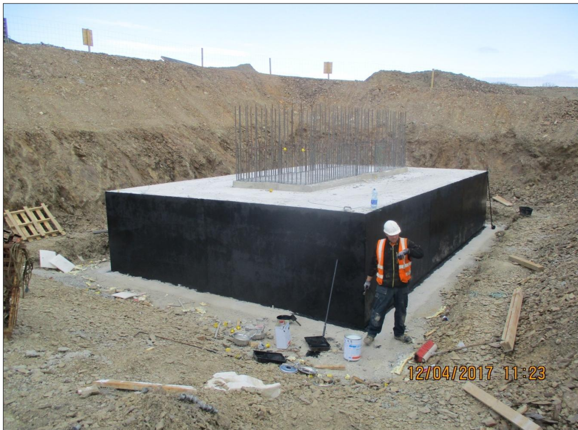
5. Barrow Bridge - Completed Pier 3 foundation at Pink Rock