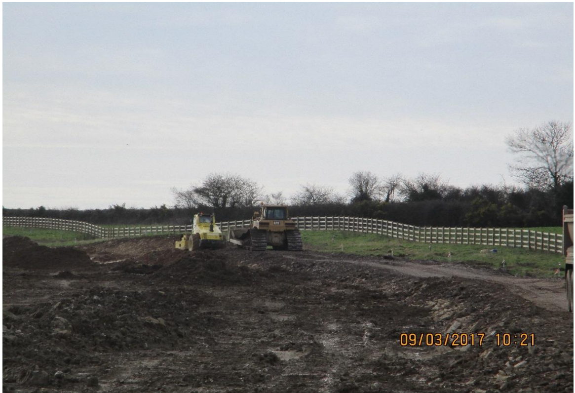
Construction and maintenance of the haul route