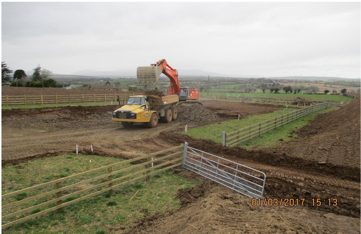
Earthworks at Dunsinane Link