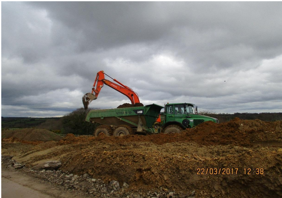
Removing topsoil windrows