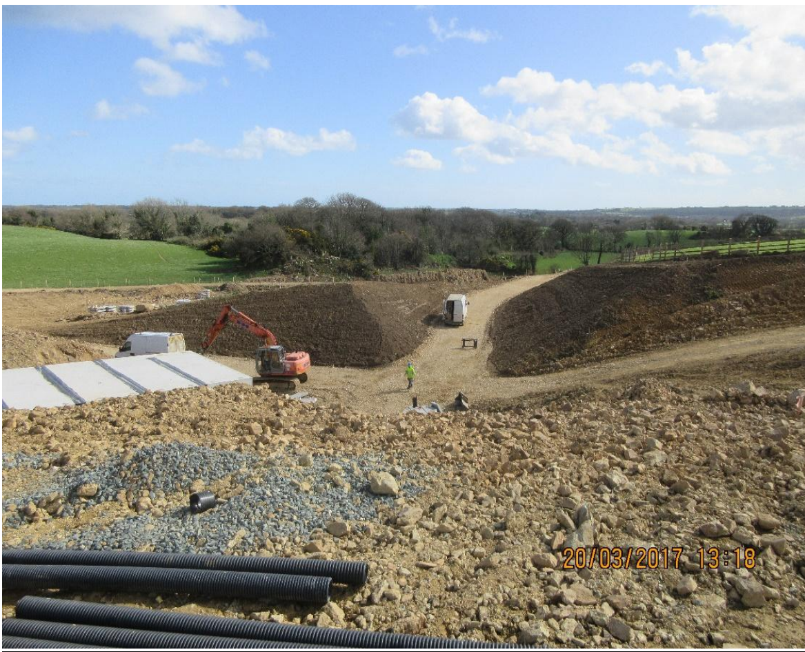
Topsoiled batters at Access Road AR02