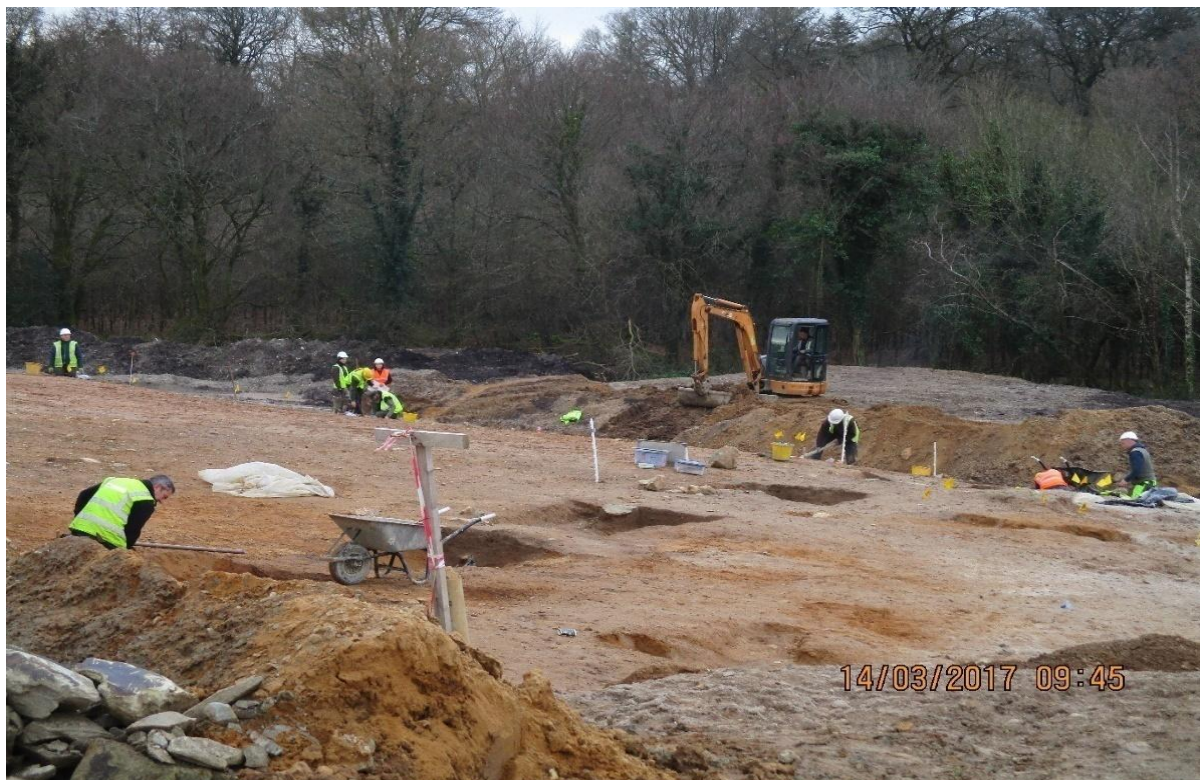
Archaeologists at AR10 Ch22500