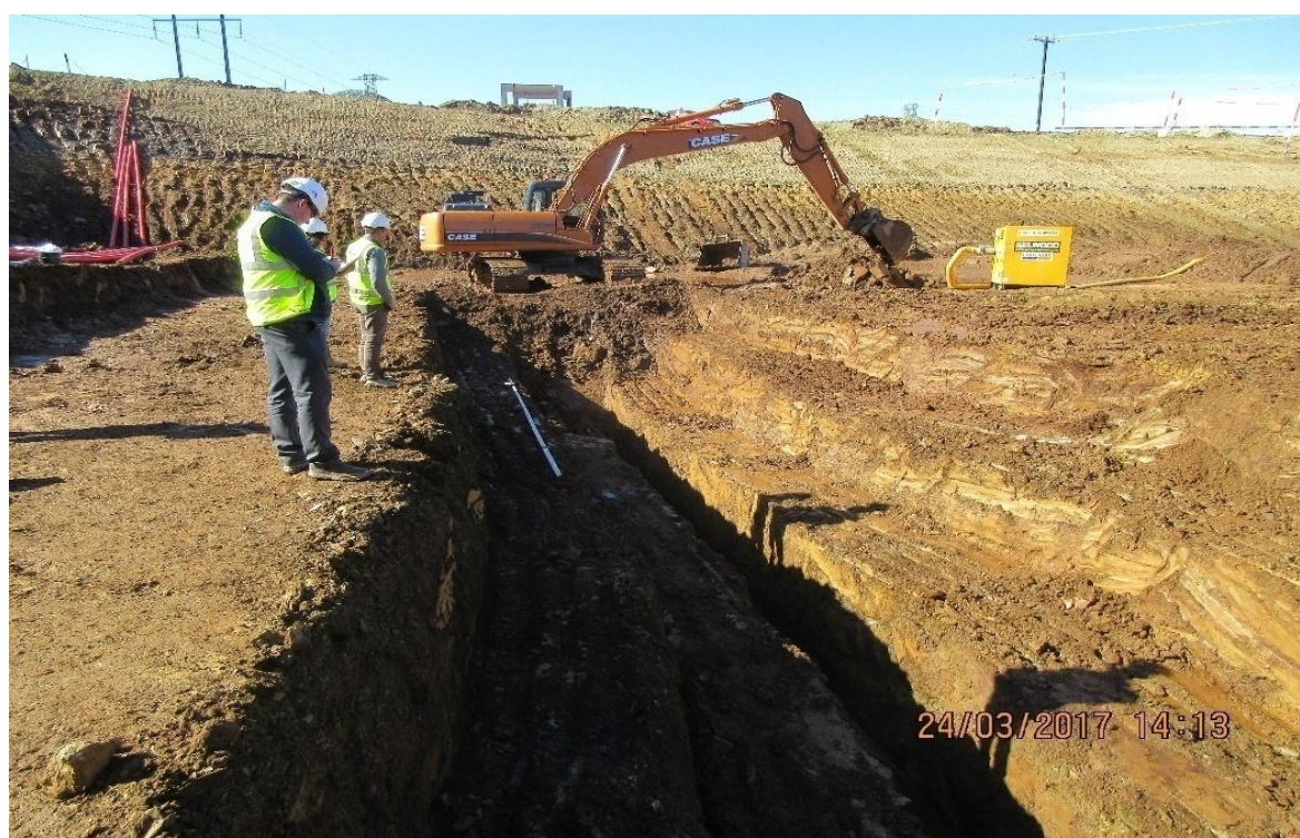
Installing ducting for Ballywater Windfarm diversion works