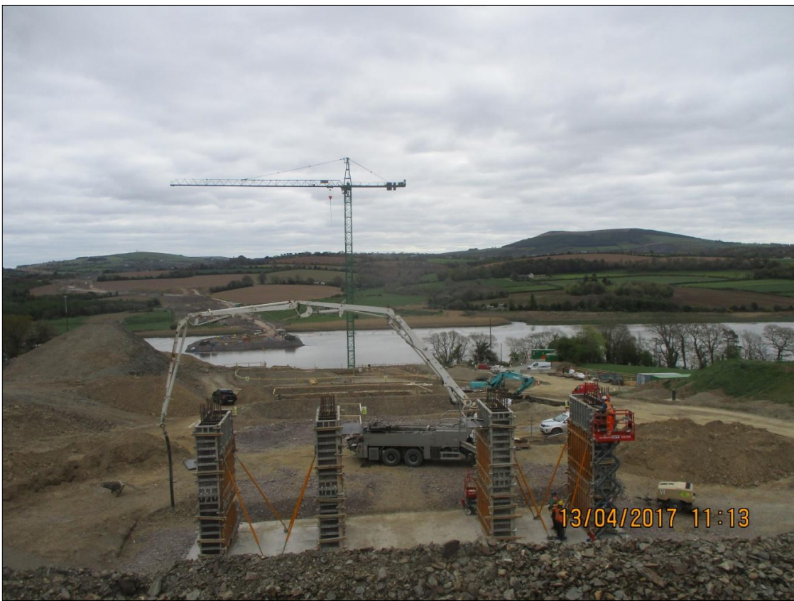
1. Barrow Bridge - Steel fixing and formwork for western abutment buried column supports