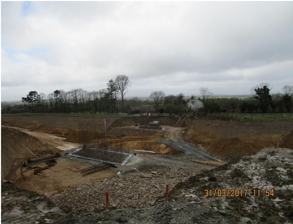
M11-S6 - Rocksprings