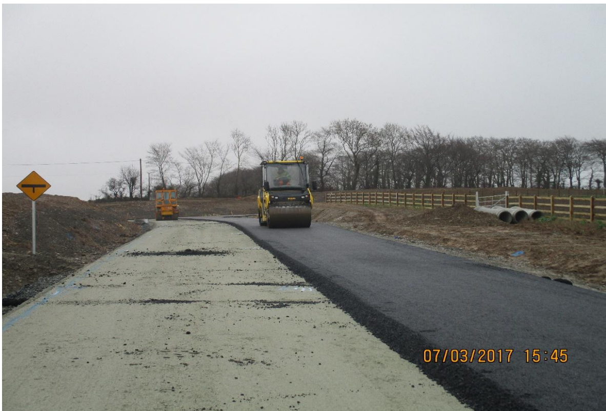
CI804 & Basecourse L2040 Knockrathkyle & L6047 Monroe Link Rd