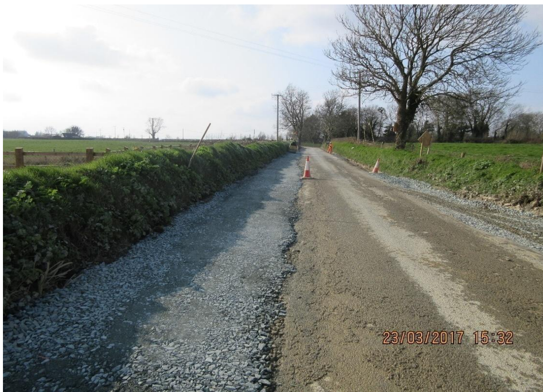
Verge strengthening works on L1027 Ballygullen Road