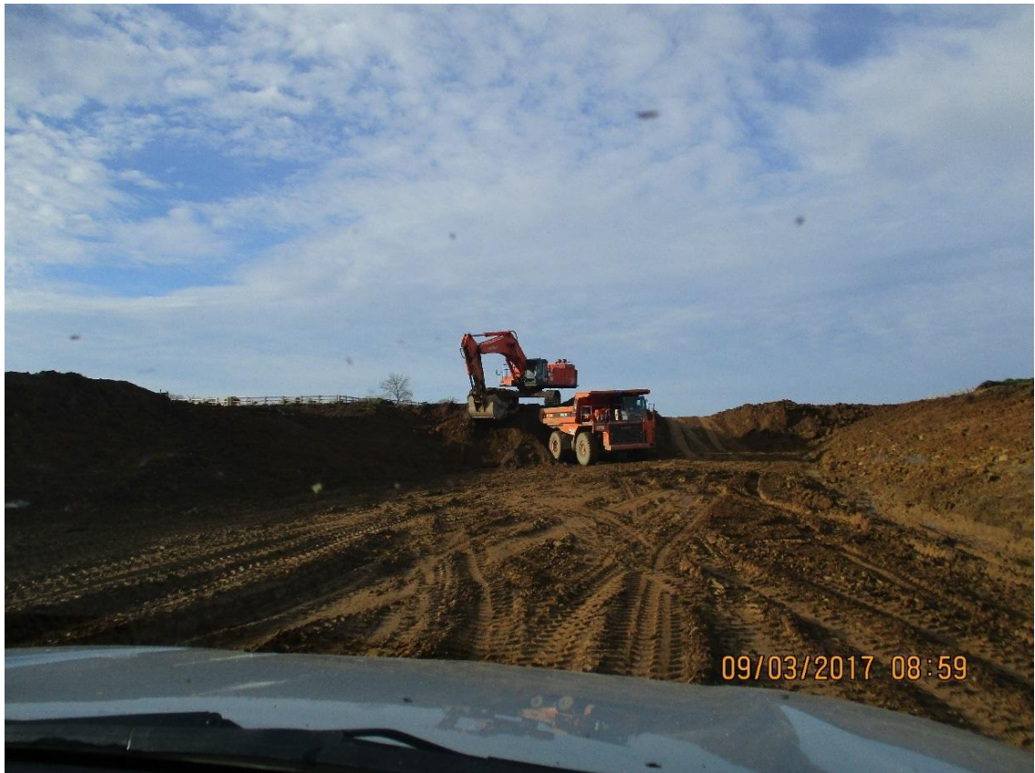
Cut 3 – Removing the plug at Monart Road East