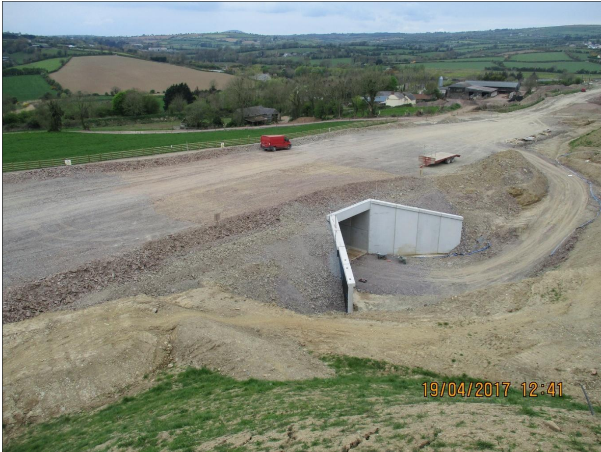
6. Barrow Bridge - Completed Pier 2 foundation at Pink Rock