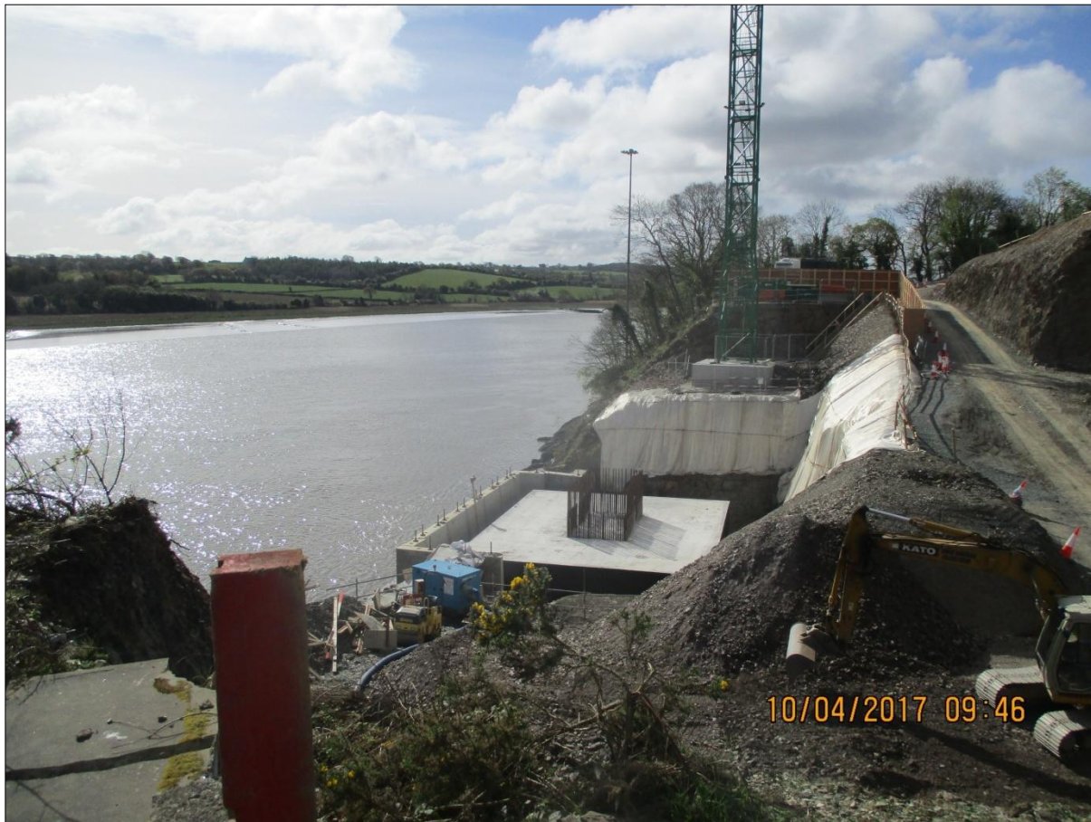
4.R733 Underbridge - Bridge deck concrete pour.