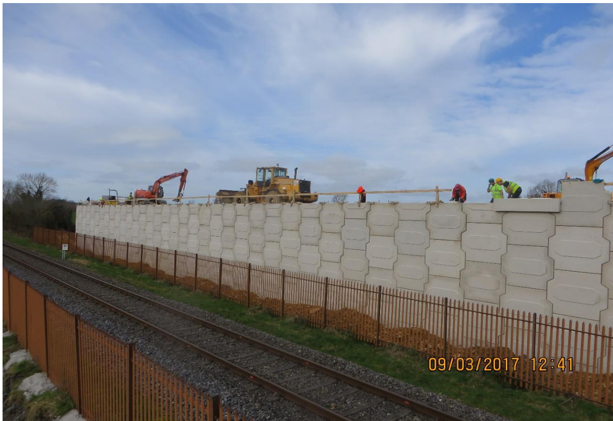
M11-S3 – Ballygullen Railway Structure