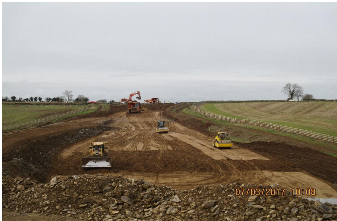
N30 Fill 3