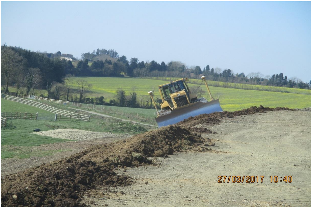
Topsoiling batters on Fill 2