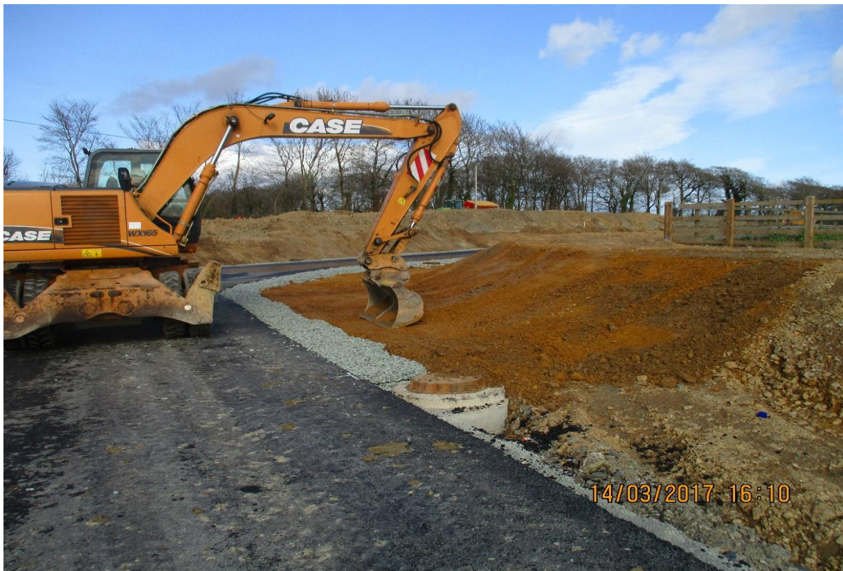
Topping Filter Drains and Topsoiling verges L2040 & L6047