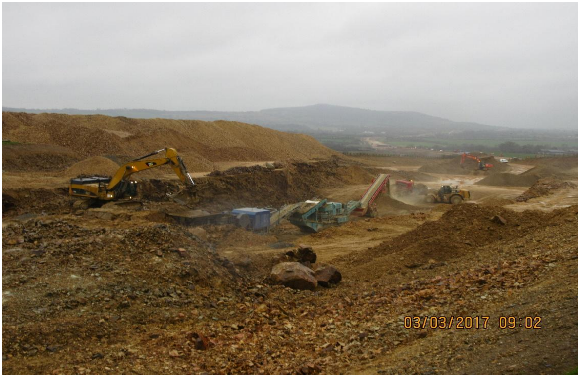
Processing rock in Cut 1