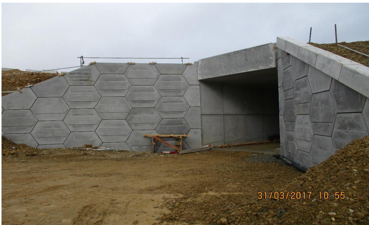
M11-ASG2 Thomas Kelly Access Structure