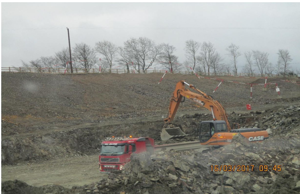
Rock Processing & Hauling from Cut 10