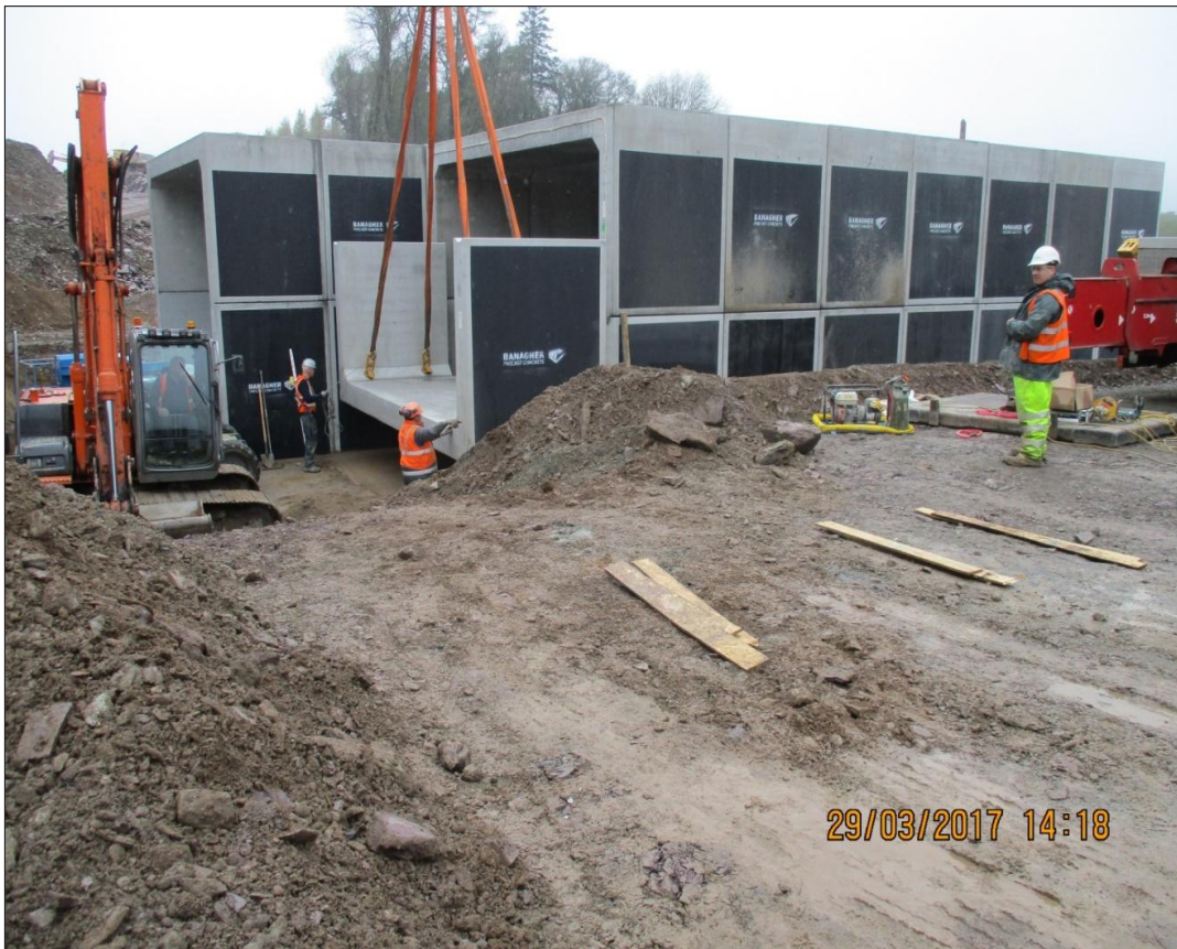
7. Farm accommodation underpass nearing completion