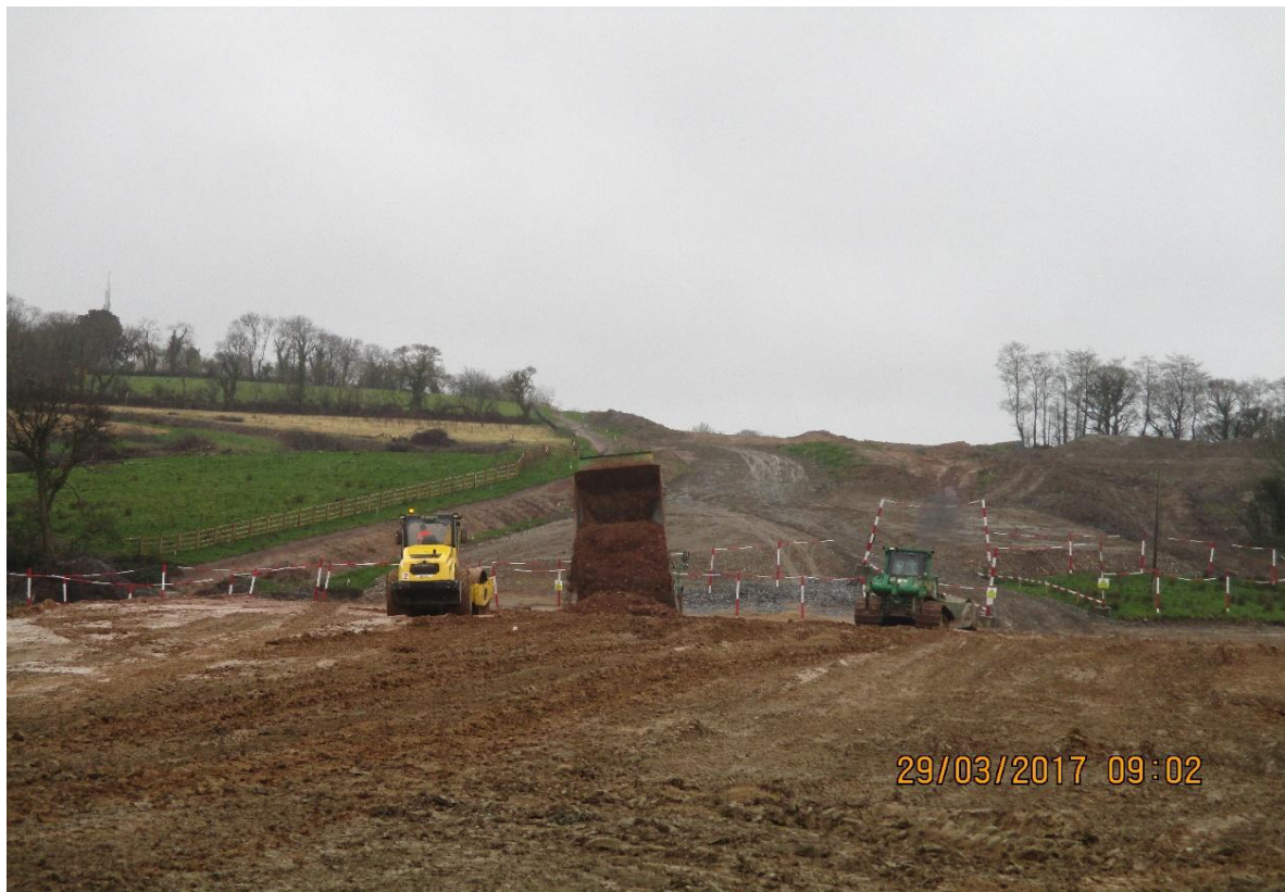
Placing Class1/2 at Fill 11 Ch27100