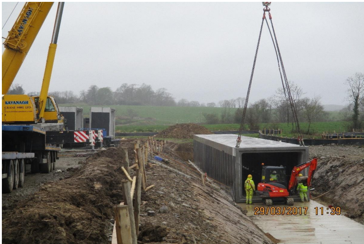
M11-C18 Ballydawmore Stream Diversion