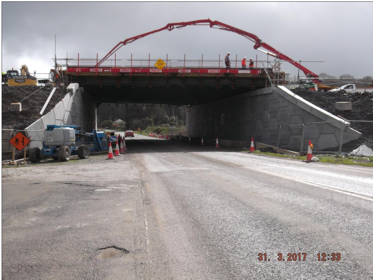
2.Barrow Bridge - Completed western abutment buried column supports.