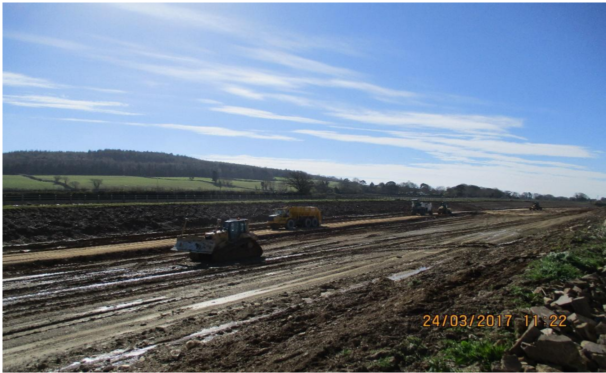
Using lime stabilisation for strengthening a haul road through Cut 3