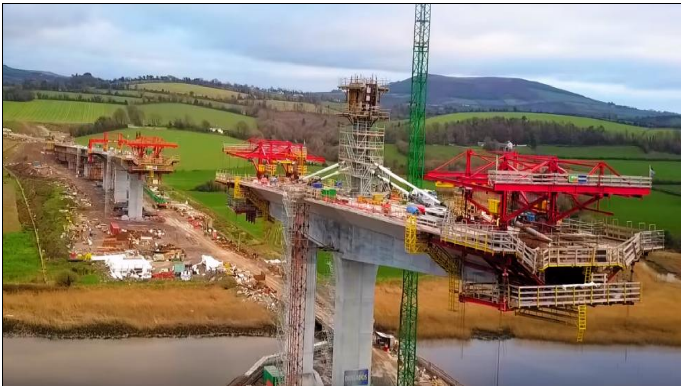
1. Rose Fitzgerald Kennedy Bridge – Construction of pylon tower and installation of cables at Pier 4 in foreground. Pier 5 and approach spans on Wexford side in background.

The eleventh quarterly project newsletter was published before Christmas. The project continues to attract very significant public interest and the project website www.n25newross.ie continues to provide progress updates as well as information on traffic management and road works. Wexford County Council continues to release periodic project videos to keep the public updated on progress. The 24 telephone hotline continues to operate to deal with any queries or complaints from the public. The number is 1800 815672, and this number has been posted on both the newsletter and website. The Project Liaison Office will continue to liaise and consult with all landowners and other interested parties for the duration of the project.