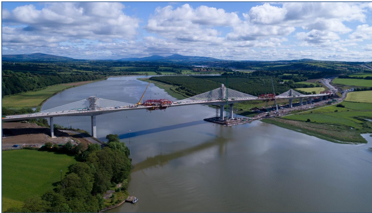
1. River Barrow Bridge – Aerial view from Kilkenny side