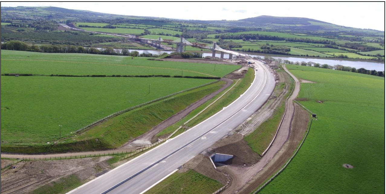
4 View of River Barrow Bridge from Glenmore Side