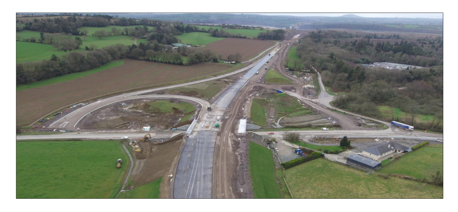
5. R733 Junction – Pavement foundations and kerbing on slip roads and blacktop on mainline (R733 running under mainline).