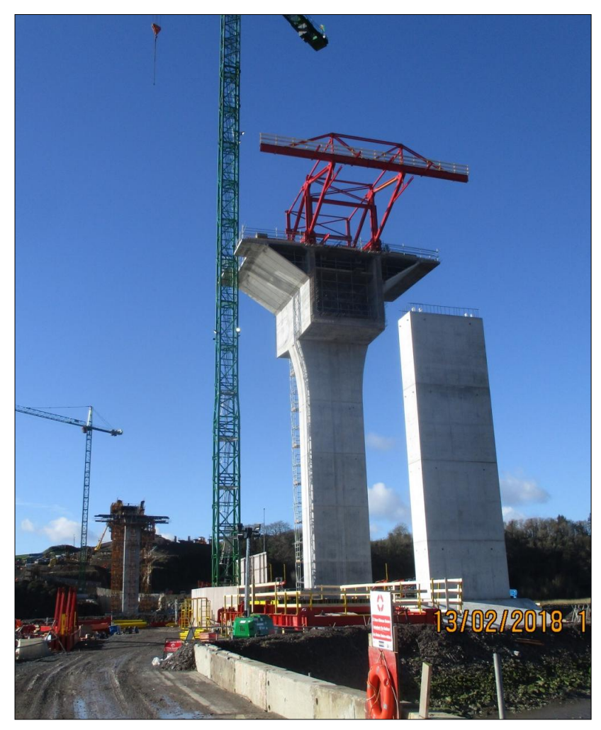
3. Barrow Bridge – Pier head for Pier 4 complete with form traveller under assembly. Temporary pier in front of pier 4.