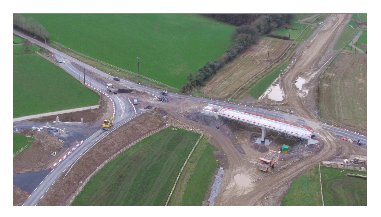
6. L-8142 Arnestown Road Realignment & Overbridge - road now closed and diversion route to left/bottom open.