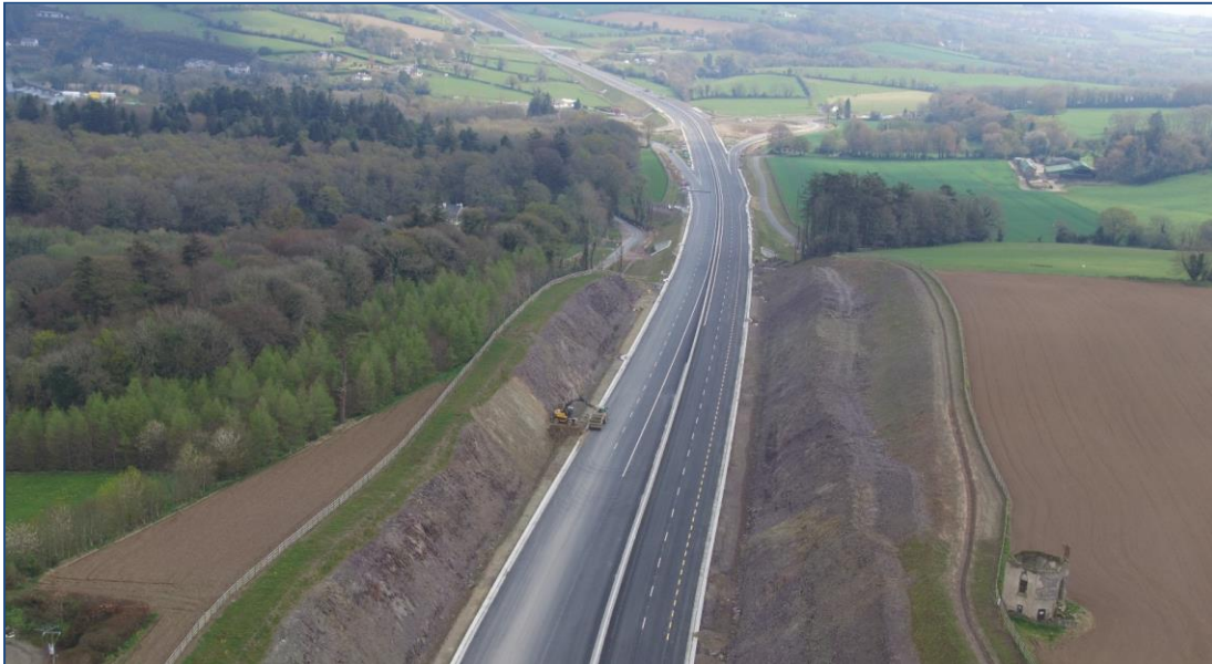
1. Approach to R733 Junction at Stokestown