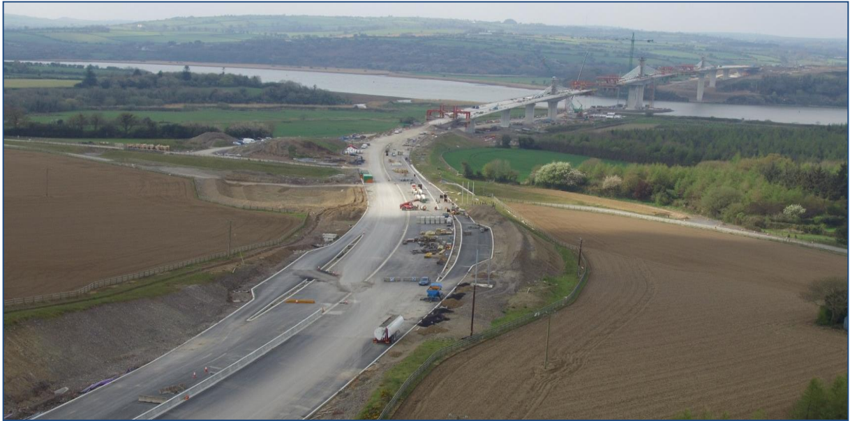
4. Rose Fitzgerald Kennedy Bridge – Approach from R733 Junction (dual carriageway parking lay-byes in foreground)