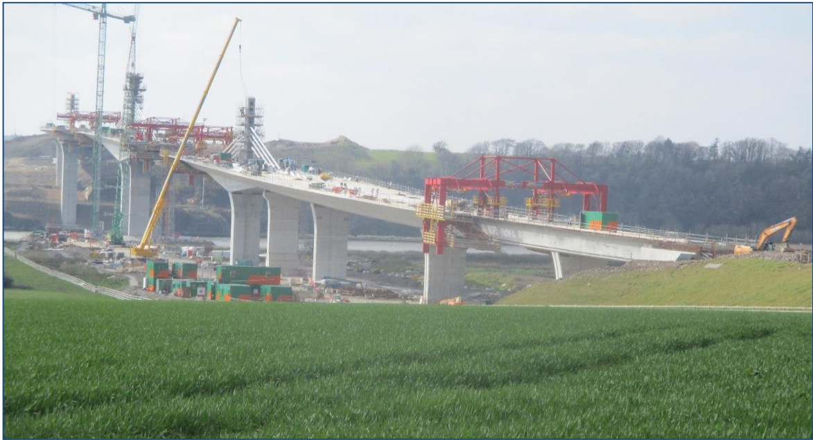
2. Rose Fitzgerald Kennedy Bridge – View From Stokestown Road