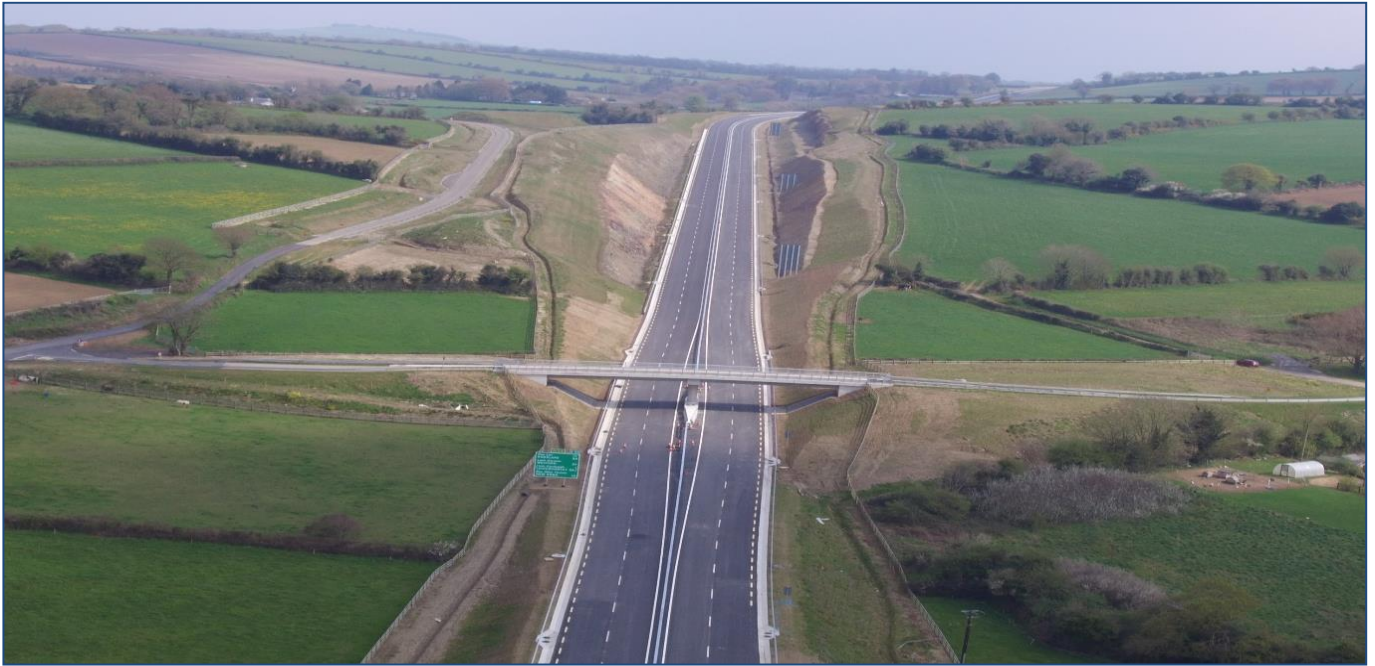
6. Mainline at Camlin – road markings and signage in place.