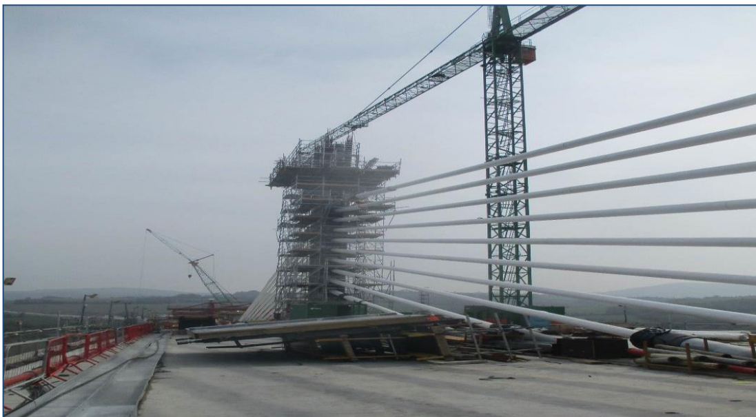
3. Rose Fitzgerald Kennedy Bridge – Installation of cables at Pier 4