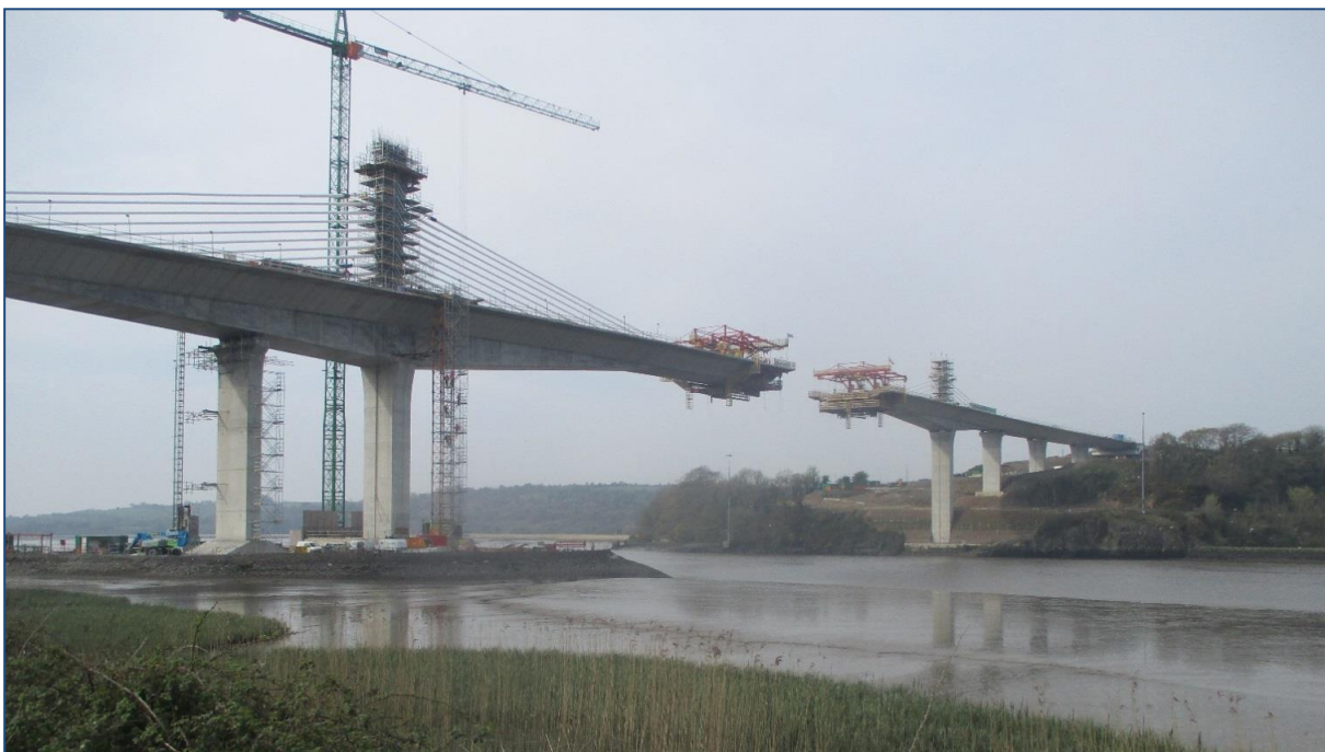
1. Rose Fitzgerald Kennedy Bridge – Progress of deck form travellers from Pier 4 (foreground) & Pier 3 (Pink Rock side in background).

Works to the mainline road are significantly advanced with final elements such as signage, road markings and landscaping nearing completion. Final elements of accommodation works including any remaining fencing, gates or access tracks are also currently being closed out. A number of road safety audits are scheduled on the constructed roads over the coming weeks.