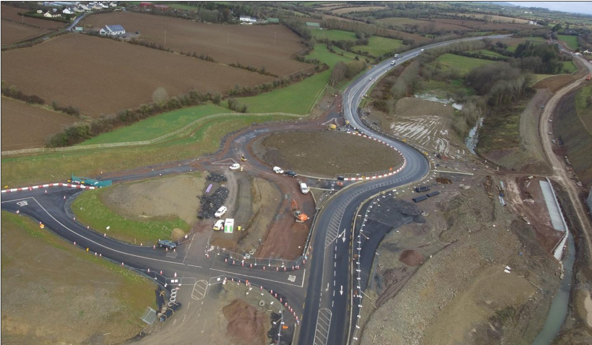
1. Temporary traffic management through Glenmore Roundabout. Works continuing on opposite side of roundabout in preparation for next phase in May. Construction of new Ballyverneen Road Overbridge and realignment visible to right of photo.