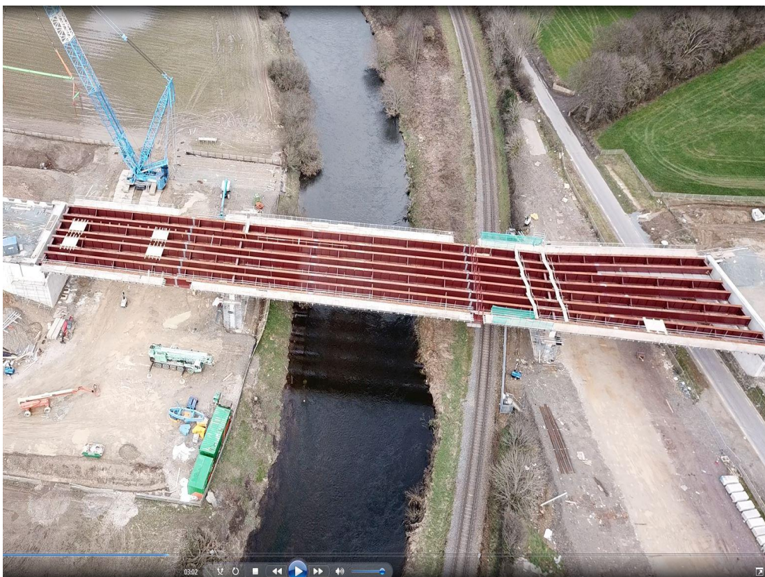
N80 River Slaney Structure