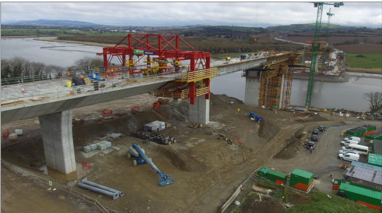
2. Barrow Bridge at Pink Rock – Full deck (including wing sections) formed on spans 1 and 2 to the left foreground. Wing traveller progressed towards the end of span 2.