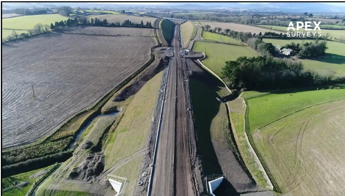
N30 looking towards Killalligan Bridge