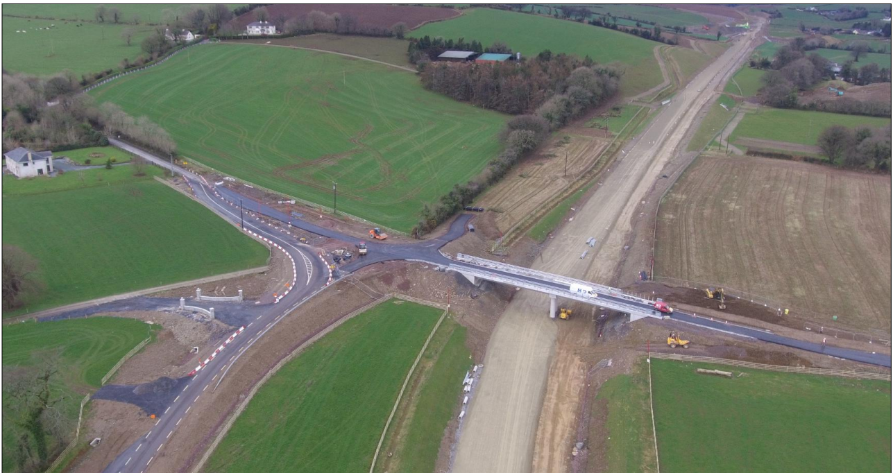
8. L-4021 Arnestown Road Overbridge and Road Realignment. Temporary road closure diversion to the left (permanent road network since re-opened). Accommodation works for new residential entrance to left.