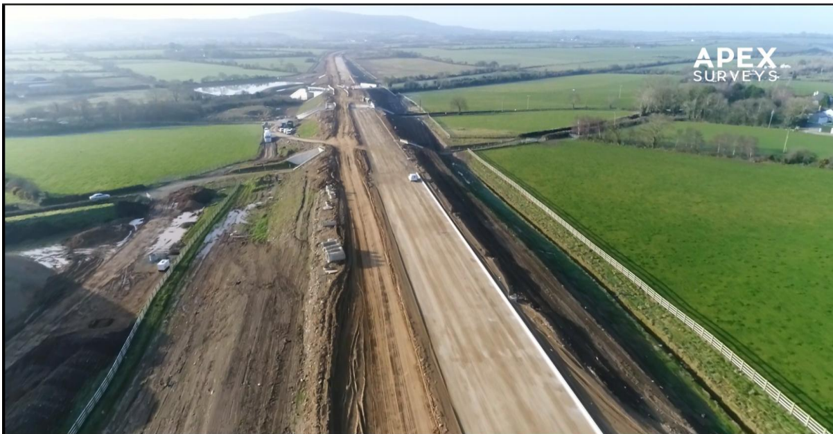
M11 Southbound towards Ballygullen Road