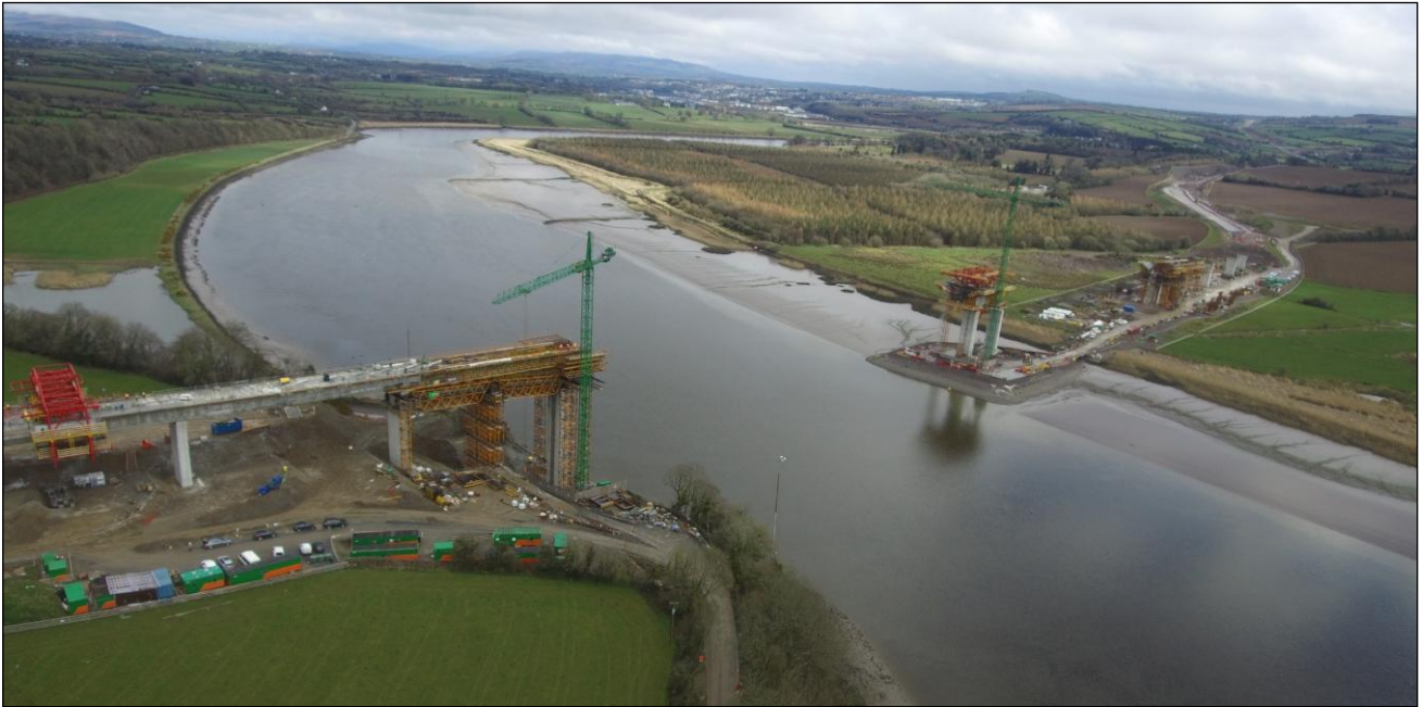
3. Barrow Bridge – View of western approach spans up to pier 3 to the left. Pier 4 traveller and span 6 under construction to the east of river on right.