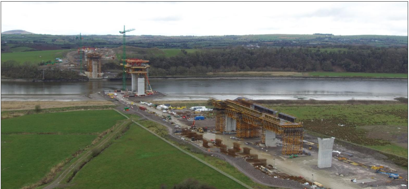
4. Barrow Bridge – View from Wexford side, span 6 under construction in foreground (note temporary pier at midspan). Pier 4 and temporary pier in background.