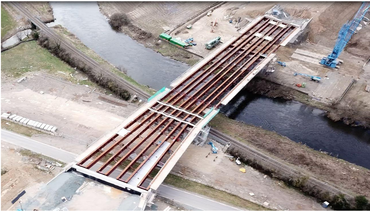
N80 River Slaney Structure