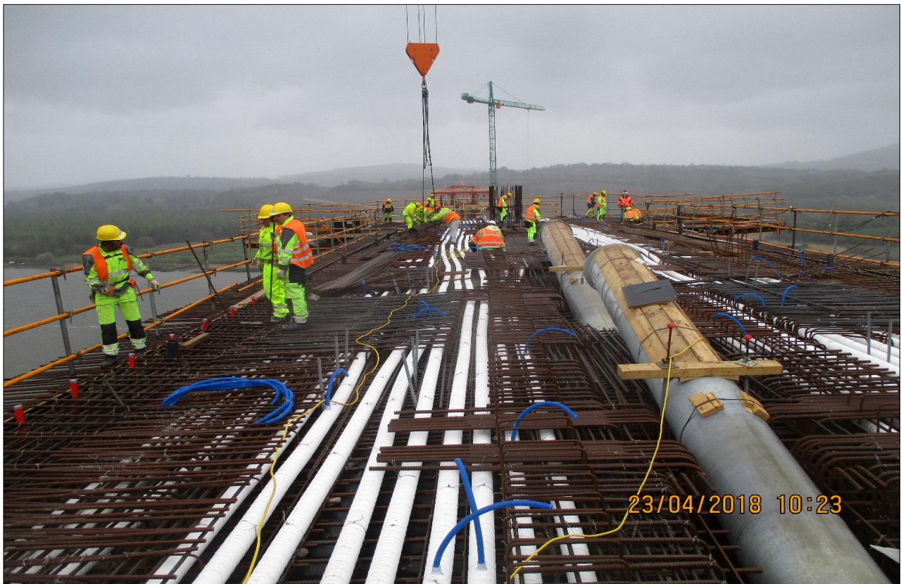
5. Barrow Bridge – Steel fixing and post tensioning ducts at span 3.