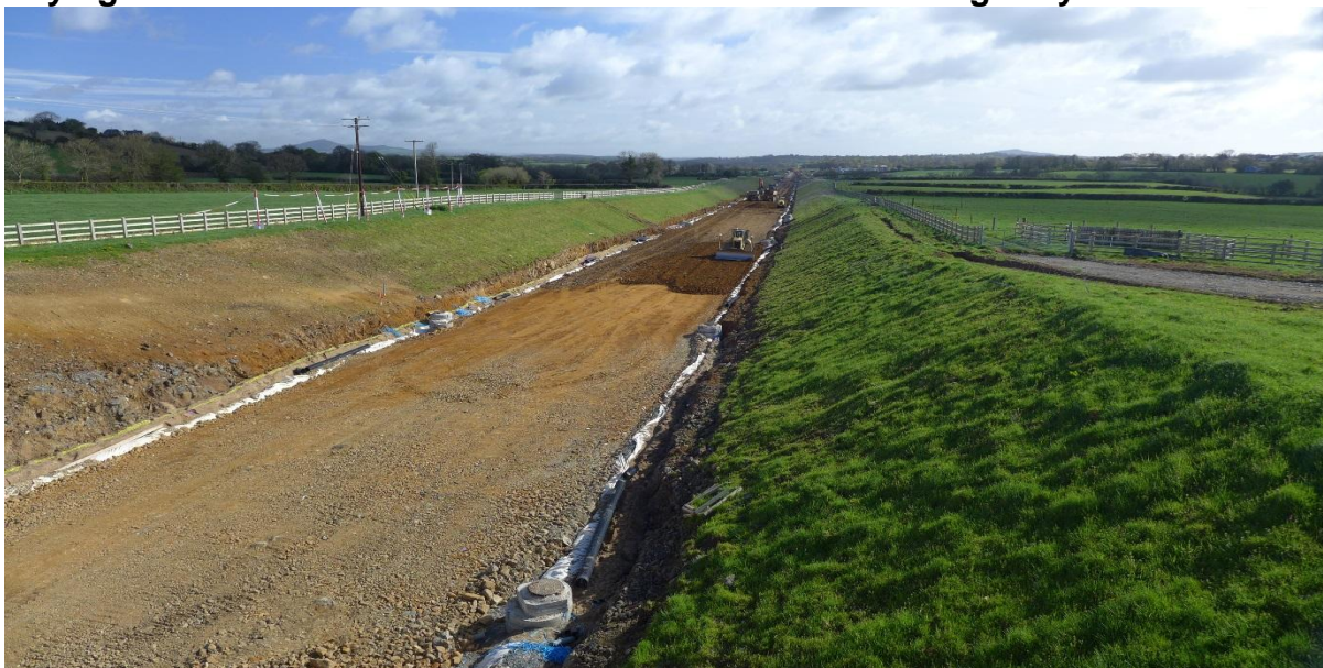
N30 looking towards Clavass Junction