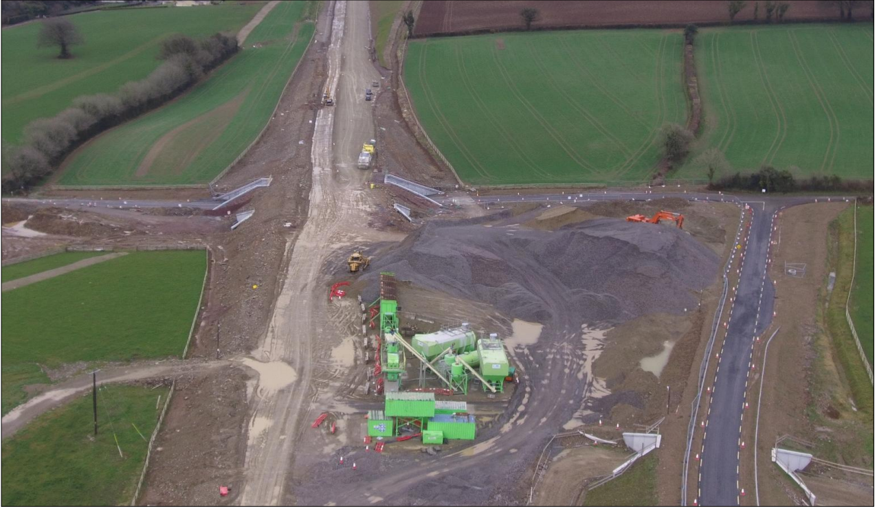
7. L-8046 Creakan Road Underbridge (with farm underpass in front), L8048 Creakan Upper Road Realignment to the right. CBGM (pavement base) mixing plant at centre foreground.