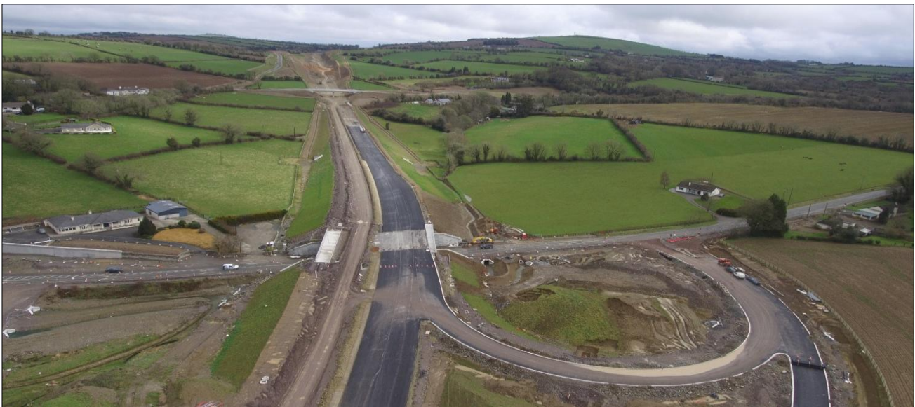
6. R733 Junction – pavement works and junction formation