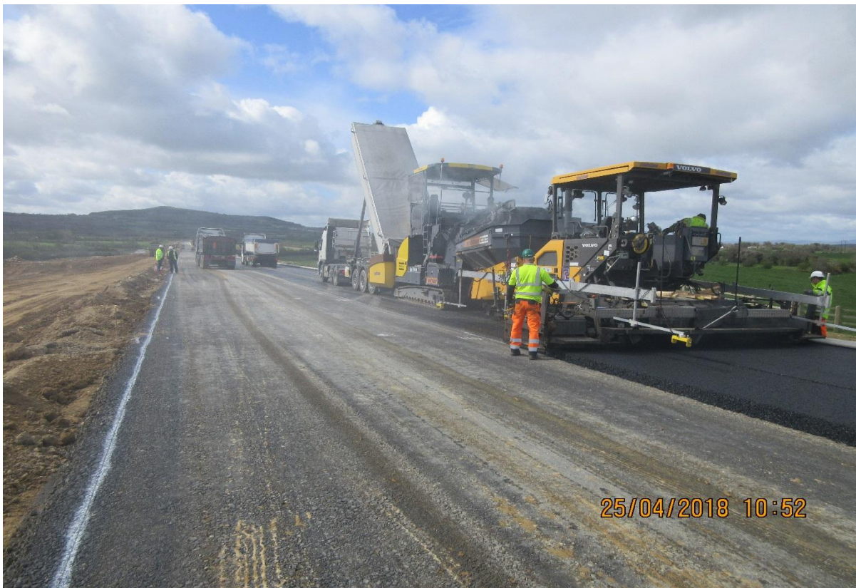
Laying Base Course on CBGM on M11 Northbound Carriageway