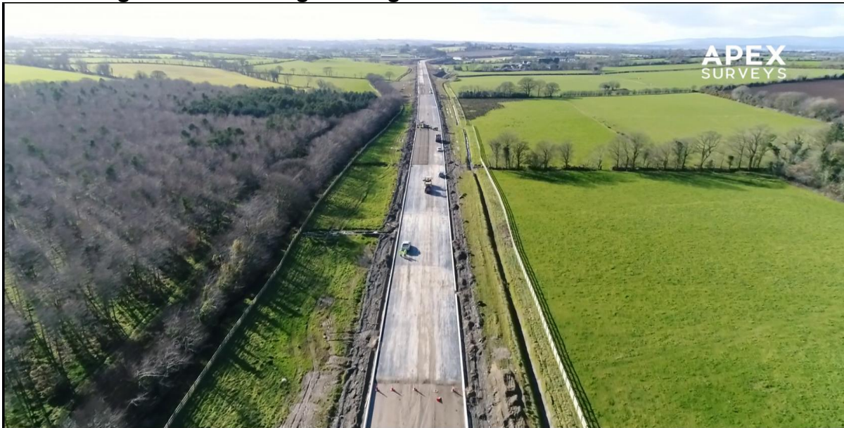
Laying of CBGM N30