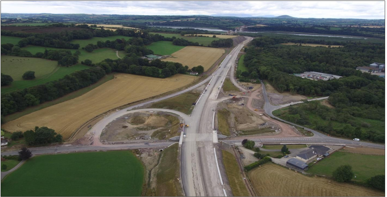
5. Surfacing at R733 Junction and further west towards Stokestown and Barrow Bridge.