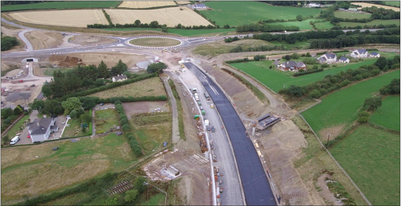
1. N25 Glenmore Roundabout operational under temporary traffic management in background. Railway Overbridge (New Ross to Waterford line) under construction in foreground. Pavement operations also progressing.