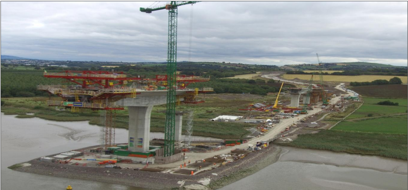
2. Barrow Bridge – Construction of main span decks from either side of Pier 4 by ‘form travellers’ in foreground. Pier 5 and span 6 etc. in background on Wexford side of river.