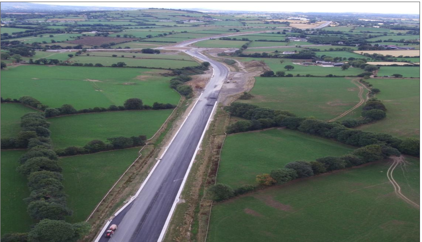
6. Surfacing at Arnestown and east to N25 Ballymacar Roundabout and towards Enniscorthy, Lacken Hill in background.