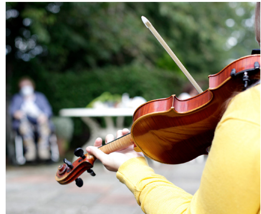
Covid Care Concert Wexford.