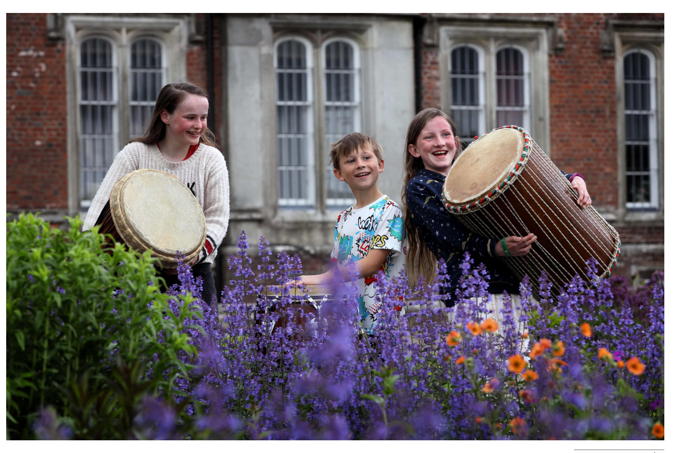
Beat Your Drum, Cruinniú na nÓg Wells House Gorey.

There was a clearly articulated need for more access to information on what is happening locally and to have spaces available where they can share their skills.