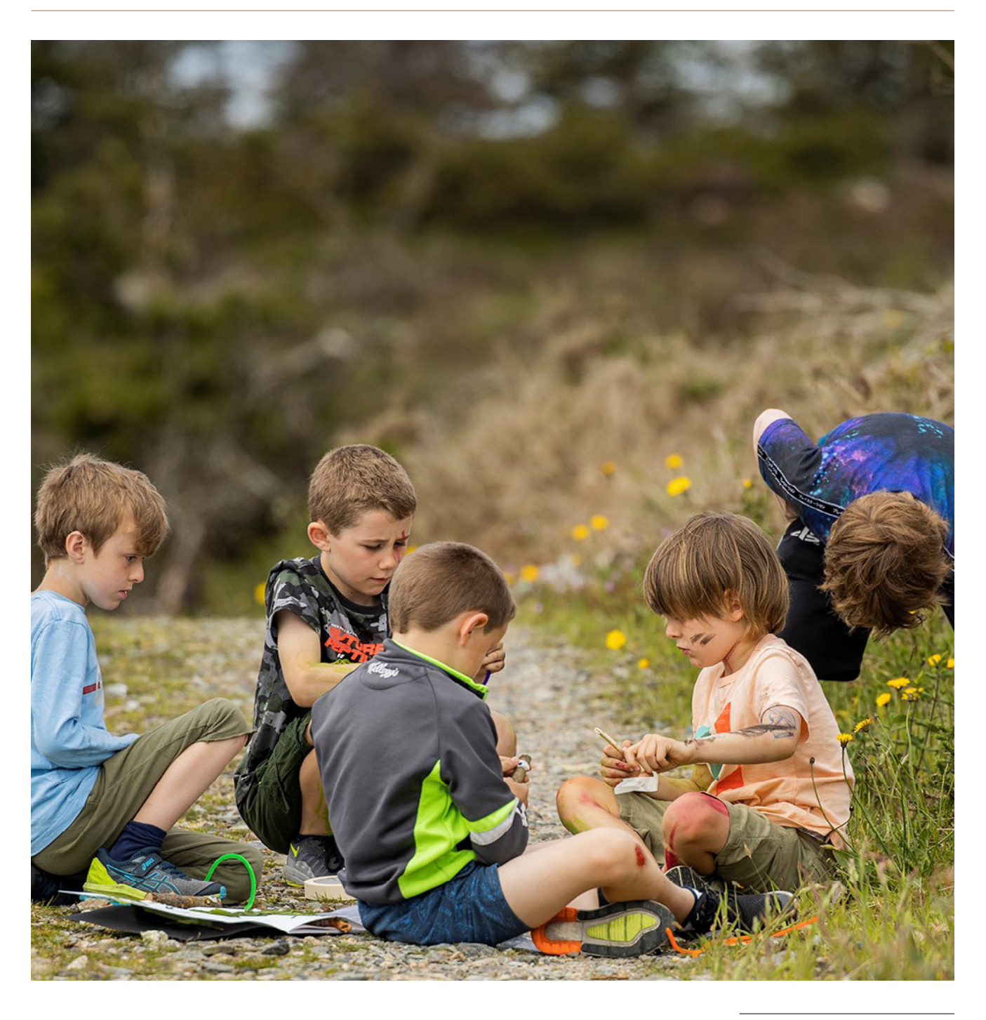
Tara Hills Art Trails Cruinniú na nÓg, Gorey School of Art.

The opportunity embraced within the Wexford Culture and Creativity Strategy 2023–2027 is to support people's participation, inclusion and expression within communities, and further strengthen local creative economies.