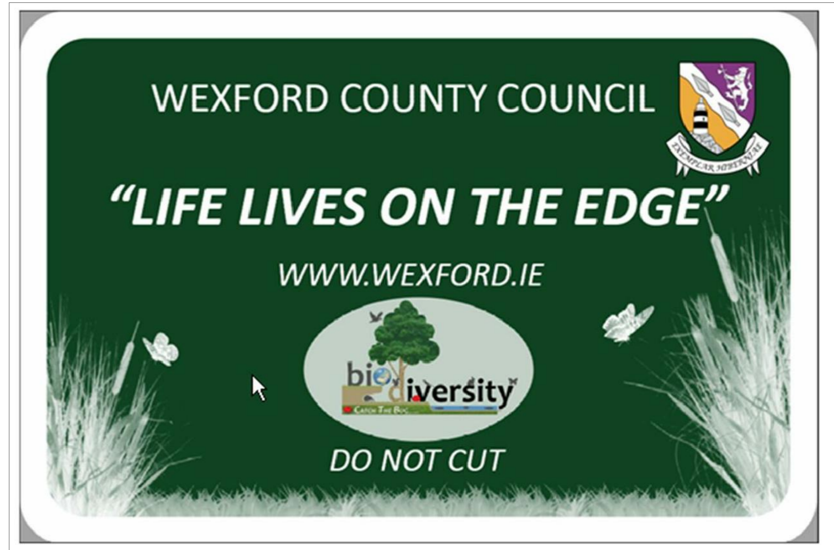
Proposed Sign A2 NTS