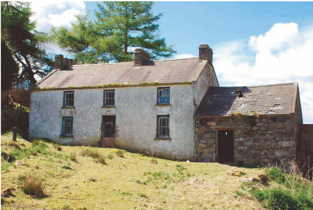
Farmhouse in need of gentle rehabilitation at Glendun, Cushendall, Co. Antrim (DfC HED)

Rehabilitating vernacular buildings means more than keeping the outer walls. Historic layout is very important. The emphasis should be on using the building as it is, retaining its structure and features to the maximum and keeping changes to a minimum. This implies that openings should generally be retained in their existing locations and sizes. Major changes to interiors fundamentally alter the character of historic buildings. Removing or altering an old kitchen hearth should be avoided.