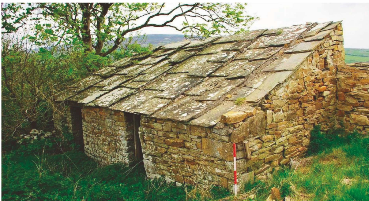
Stone flag-roofed outbuilding, Ballycastle, Co. Mayo (Sarah Jane Halpin)

Stone flags are used as a roof covering in some districts, notably west Clare, where the limestone is easy to split. These are heavy roofs that require strong timbering.