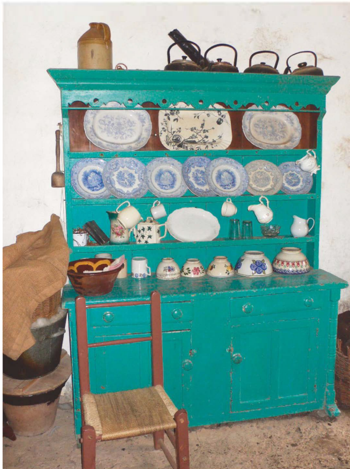
Dresser in a house from Ballyveagh, Co. Down at the Ulster Folk and Transport Museum

An often-neglected aspect of vernacular houses is their furniture and smaller items, which reflect the lives of their owners. Many items were made by local furniture-makers and blacksmiths, or by journeyman carpenters and tinkers, and some pieces have 'trademark' details. 'Fancier' items were bought in shops or from pedlars and travelling salesmen.