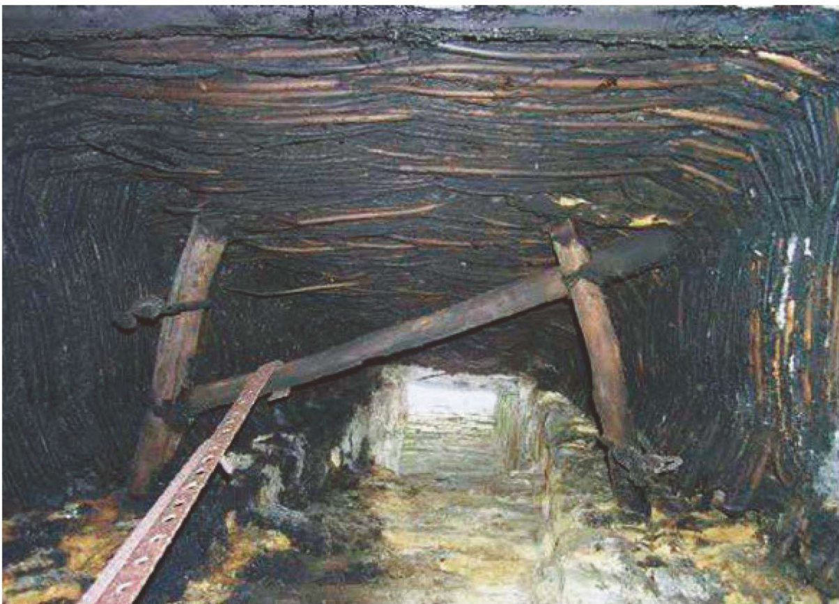
Wickerwork chimney, near Valleymount, Co. Wicklow (Christiaan Corlett)

Wattlework, made from willow ('sally') or hazel rods, is immensely versatile and can survive in fireplace hoods, partitions and the upper parts of interior walls. It may also be found in some roofs as a support for thatch. It was used to make the walls of houses and other structures into the seventeenth century.