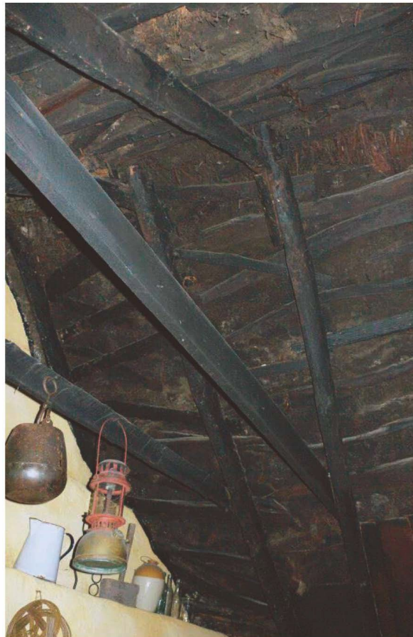
Typical A-frame roof structure, near Kanturk, Co. Cork (Barry O'Reilly)

Chimneystacks on vernacular houses are always on the ridge and tend to be quite low. Traditional examples are of stone, but formerly timber boards and even straw were used.