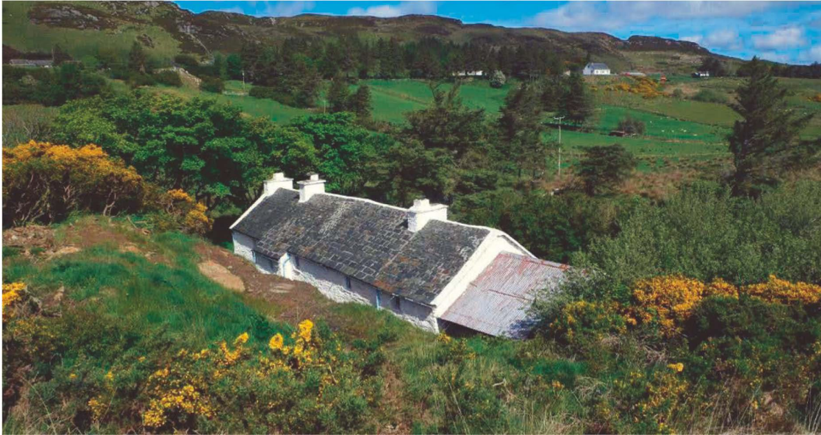
House with Roshine Slate roof, taking full advantage of the shelter of the slope, near Dunfanaghy, Co. Donegal

Vernacular ideas, techniques and materials can help us to find new ways to design, build and even live. They can help to create new houses and other buildings that are rooted within our distinctive traditions. By being proud of, and learning from, our vernacular heritage, we also display confidence in our own communities, culture and society.