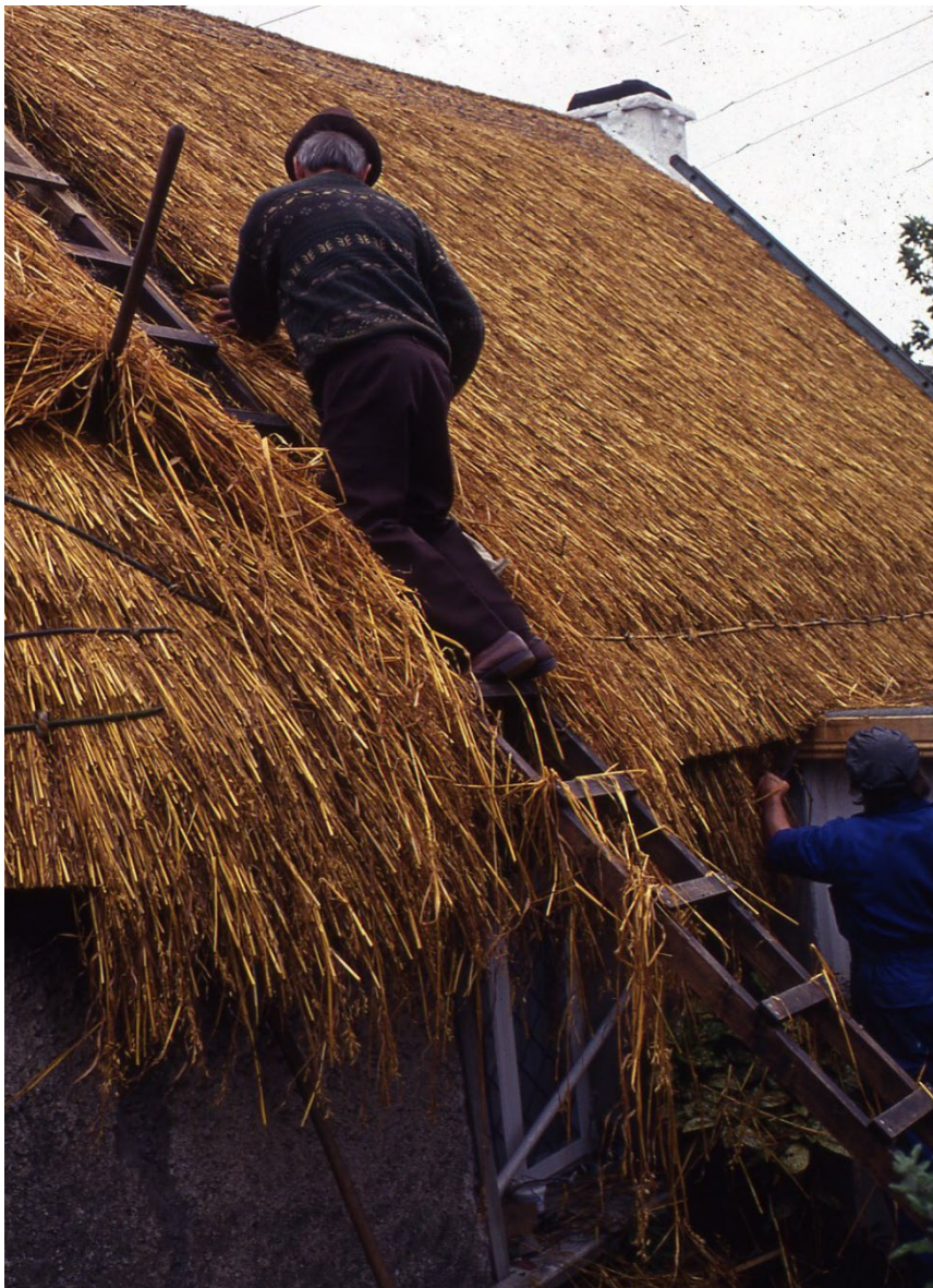
Rethatching in progress, Swords, Co. Dublin (Barry O'Reilly)

There may be a ridge of bobbins (twisted knots of rope) and/or scalloping laid in a crisscross pattern at the eaves and/or just below the ridge. Raised ('block') ridges and 'eyebrow' sweeps are not traditional in Ireland.