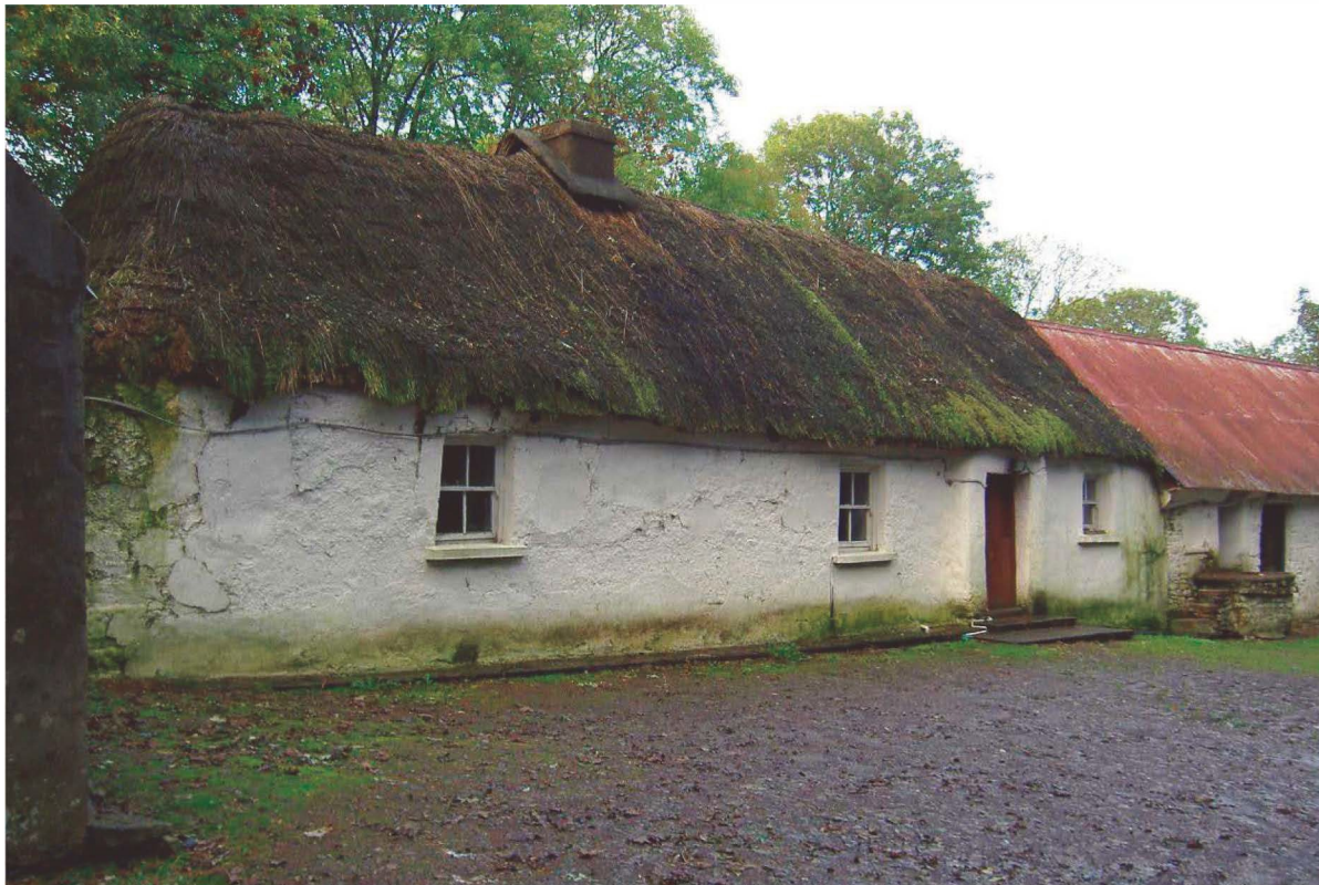
Thatched roof needing attention near Freemount, Co. Cork (NIAH)

Thatch presents its own challenges, which can be dealt with by an experienced traditional thatcher. The ridge will need to be renewed every few years, as will the areas around chimneys. The whole roof will require a new coat of thatch perhaps every ten years, depending on the material used.