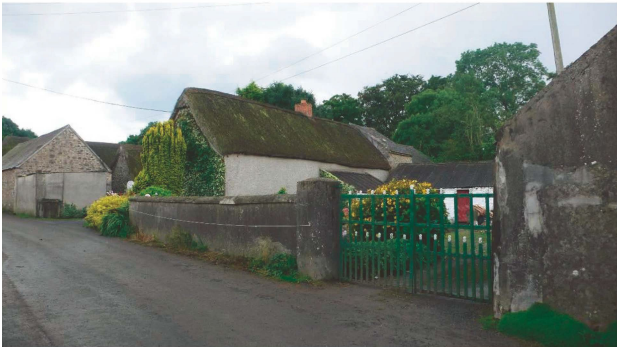
Farmyard at Luffany, near Mooncoin, Co. Kilkenny (Barry O'Reilly)

Farmyards may have old cobblestone yard surfaces, which need care and maintenance too. There are also traditional boundaries of stone or formed by hedges and trees, as well as orchards, gardens and other planting. Walls, ditches and planted boundaries to fields and routeways form a highly significant part of our vernacular landscapes.