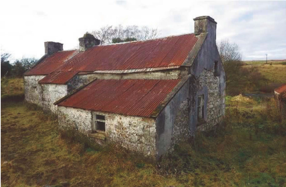
Corrugated iron-roofed house, near Castleterg, Co. Tyrone, with bed outshot projection, typical of the region, in line with the middle chimney

Corrugated iron, an imported, industrially produced material appeared about 1860. It has essentially been adopted into vernacular construction. Ironically, by being used to cover over thatched roofs, it has helped to preserve historic roof structures, techniques and materials. Also, because it has so often replaced thatch, its presence is usually an indication that a building was formerly thatched.