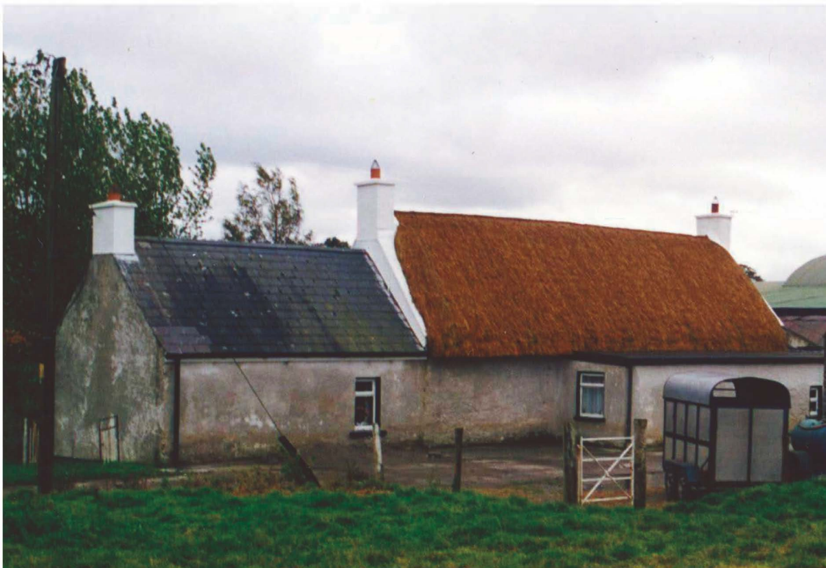
Farmhouse near Ballinagar, Co. Offaly, with various extensions (Barry O'Reilly)

If an extension is required it should not overwhelm the existing house and its scale, form and details should be in keeping. A rear doorway or window could be used to link old and new. Traditionally, extensions were added in line, to one or both ends of the house; later extensions made an 'L' or 'T' plan. Sometimes, incorporating an adjacent outbuilding can be considered, while retaining the character of the setting.