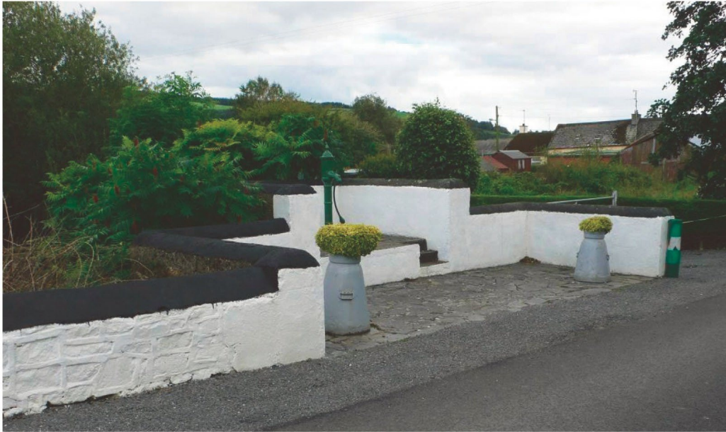
Pump and churns, Ahenny, Co. Tipperary (Barry O'Reilly)

These buildings with their rust-red paint are an appealing feature of almost all farmyards, with their half-barrel (or occasionally, pitched) roofs, sometimes with their sides filled with iron sheeting or concrete. There are also some vernacular hay barns with timber uprights and generally pitched roofs. In some places there are examples with concrete supports.