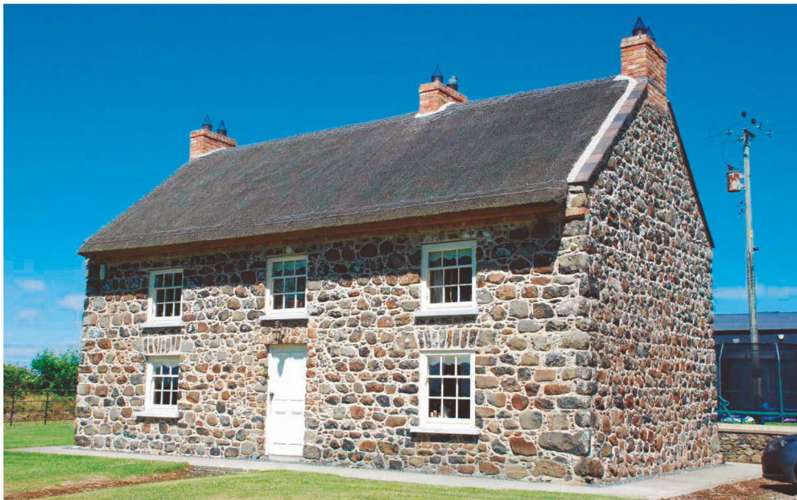
Coursed basalt walls, and thatch, near Crumlin, Co. Antrim (DfC HED)

Stone-walled buildings typically have walls 45-60 cm (18-24 in) thick, with a more regular appearance than mud walls. In some localities, where stone is of good quality and relatively easily worked, there can be artistic craftsmanship in vernacular buildings, with door and window surrounds, chimneystacks and eaves of cut or dressed stonework that does not need rendering. Elsewhere, walls are usually of stone cleared from the fields, in which case they may be very rough and rounded. In some instances, boulders that were not easily moved were simply incorporated into buildings. Stone from local quarries may be more regular than field stone, but all such 'rubble' walls tend not to have clear coursing and are always rendered with plaster and/or limewash.