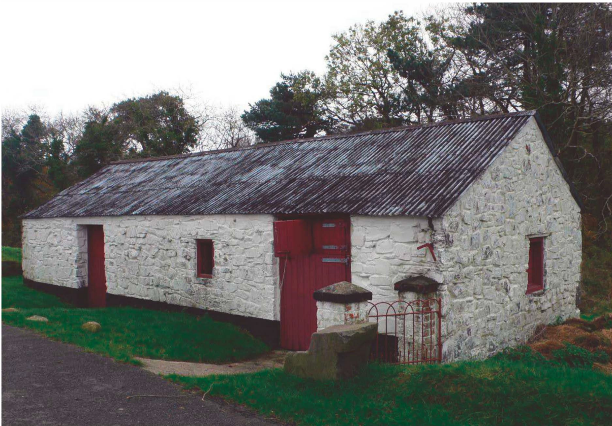
Typical farm building, from Drumnahinch, Co. Armagh, at the Ulster Folk and Transport Museum (Barry O'Reilly)