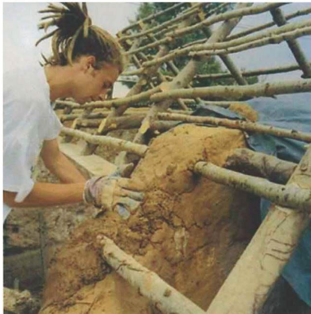
Repairing a mud wall, Mayglass, Co. Wexford (UCD)

Mud buildings ('cob' is not a traditional term in Ireland!) are found in areas with deep boulder ('yellow') clay and their irregular appearance helps in recognizing them. The mud was dug out and heaped up onto a stone footing about 30 cm (12 in) high, in courses of 45-50 cm (18 in).