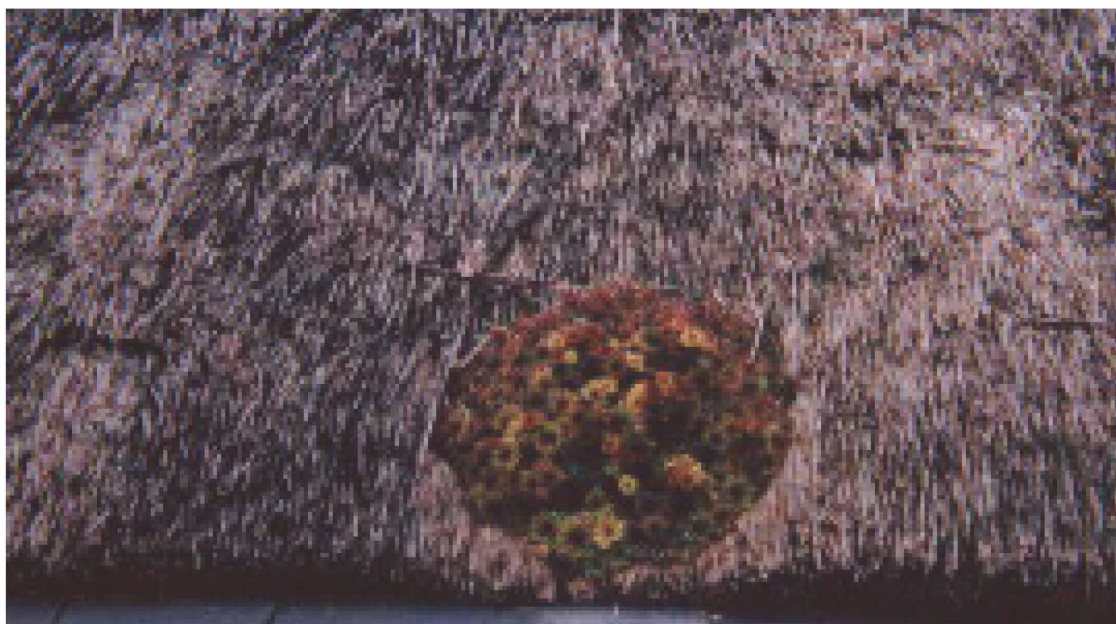
House leek ( sempervivum tectorum ) in thatch, near Buree, Co. Limerick (NIAH)

Traditionally, horse (or ass) shoes and particular plants or flowers were used to ward off supernatural forces. The 'house leek' ( sempervivum ) was employed as protection against conflagration and can be seen in the thatch of some houses, or elsewhere in the yard.