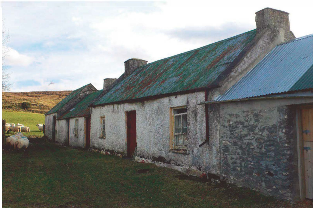
House needing repairs at Cregg, near Strabane, Co. Tyrone (Barry O'Reilly)

Poor maintenance only leads to expensive repairs. 'A stitch in time saves nine!' is a well-worn proverb that especially applies to old buildings and should be taken to heart.