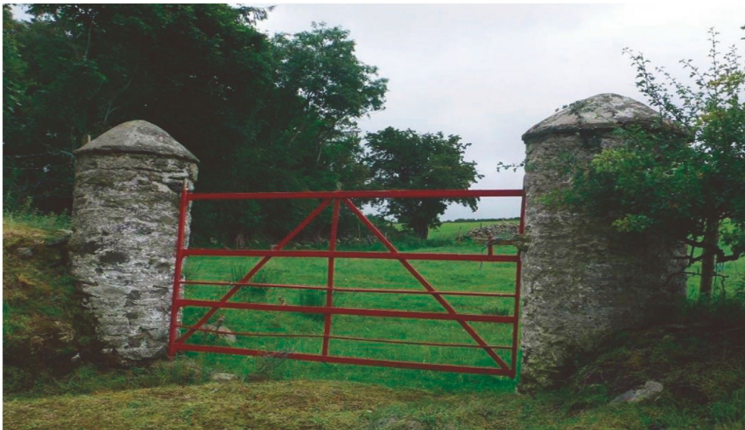
Forged iron gate, close to New Buildings, Co. Londonderry (Barry O'Reilly)

Wrought-iron gates were forged in local smithies, along with the whole gamut of metal objects used in vernacular settings, on the farm, or by fishermen and others. A visually pleasing feature of farmyards and roadsides, they often have decorative 'trademark' features. They are supported on square or round-plan piers, the work of local masons. Foundry-made cast-iron gates are not common in vernacular settings.