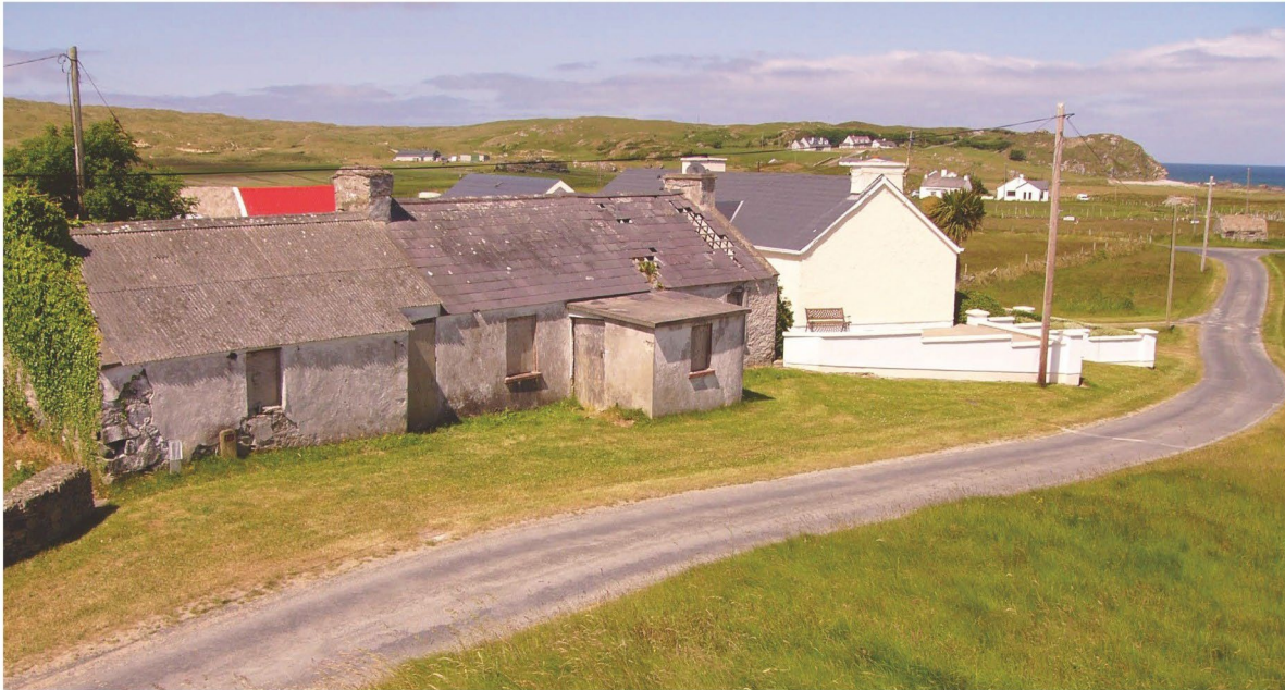
Isle of Doagh, Co. Donegal: before (2010) and after (2013) gentle rehabilitation

Ideally, rehabilitation works should be hardly noticeable. Vernacular buildings must evolve with their owners and their changing circumstances, as they always have. However, today we also need to embrace sustainability while conserving what is a unique legacy of homegrown architecture. It should be possible to find ways of adapting or extending vernacular houses in ways that do not undermine their traditional character. The following photographs illustrate a lovely example of gentle rehabilitation.