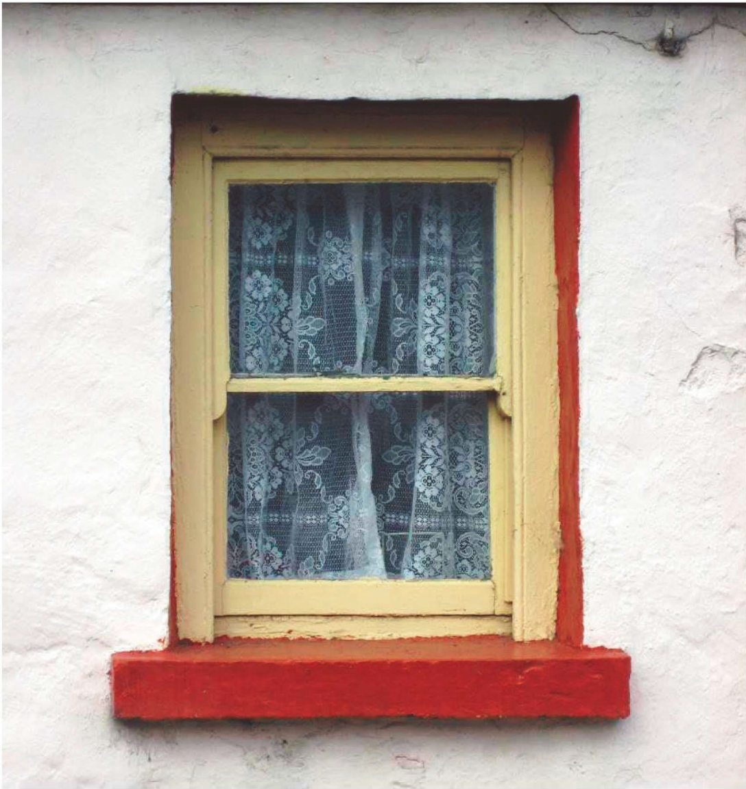
Typical sliding sash window, Westport, Co. Mayo (NIAH)

Tightly sealing a building will damage its performance and undoing this can be expensive. Sealants of various types are almost certain to prevent the walls or roofs of an historic building from 'breathing', thus trapping moisture and simply concealing problems rather than solving them.