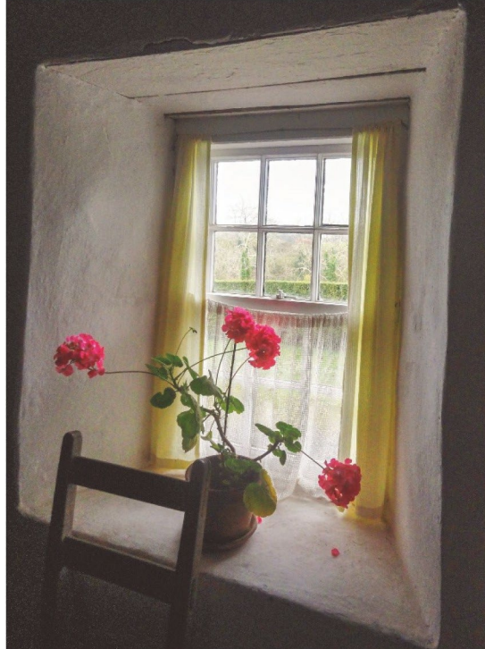
Interior of a house from Lisnacloskey, Co. Antrim, at the Ulster Folk and Transport Museum (Jean Farrelly)

Timber sliding sash windows are the most common type on intact buildings; others are fixed, casements or pivoted. Internally, windows may be beaded, with timber linings. Louvered windows can be found on farm buildings, mills and other structures. Earlier buildings had openings with shutters of wood or straw mats.