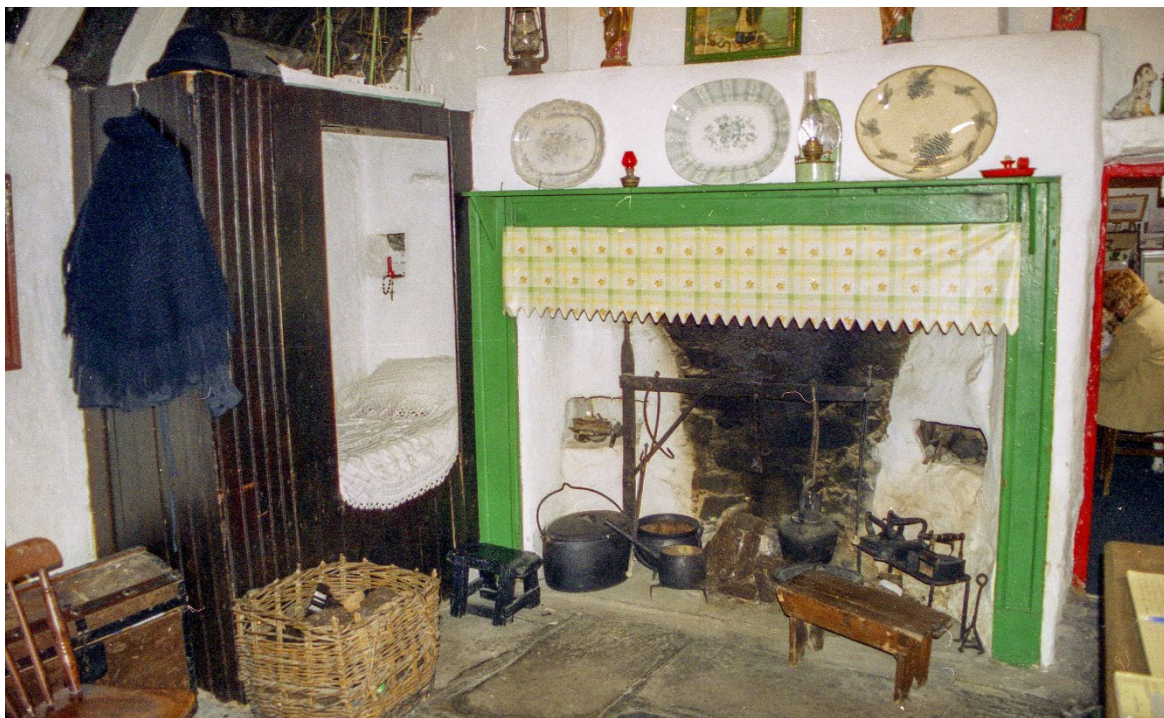
Dolly's Cottage, Strandhill, Co. Sligo, with bed outshot at left (Barry O'Reilly)

Retaining the old kitchen hearth, together with any surviving features, such as keeping holes for salt or tobacco, and iron or wooden fittings, is most important, and this is respectful to a vernacular house, to its builders and to its former occupants.