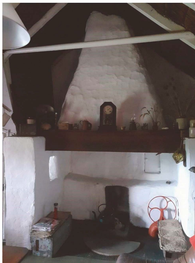
Old kitchen hearth and jamb wall, near Tramore, Co. Waterford (Barry O'Reilly)

Interior walls tend to be rendered in lime plaster, but some only have limewash, white being usual to maximize the light. Wallpaper is also found, more usually in bedrooms and parlours.