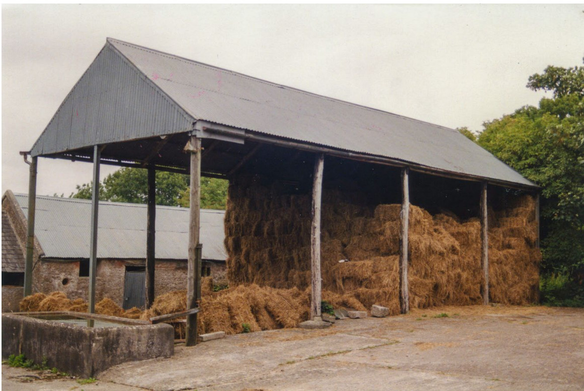
Hay barn of vernacular character, with timber pole supports and pitched roof, near Barringtonsbridge, Co. Limerick