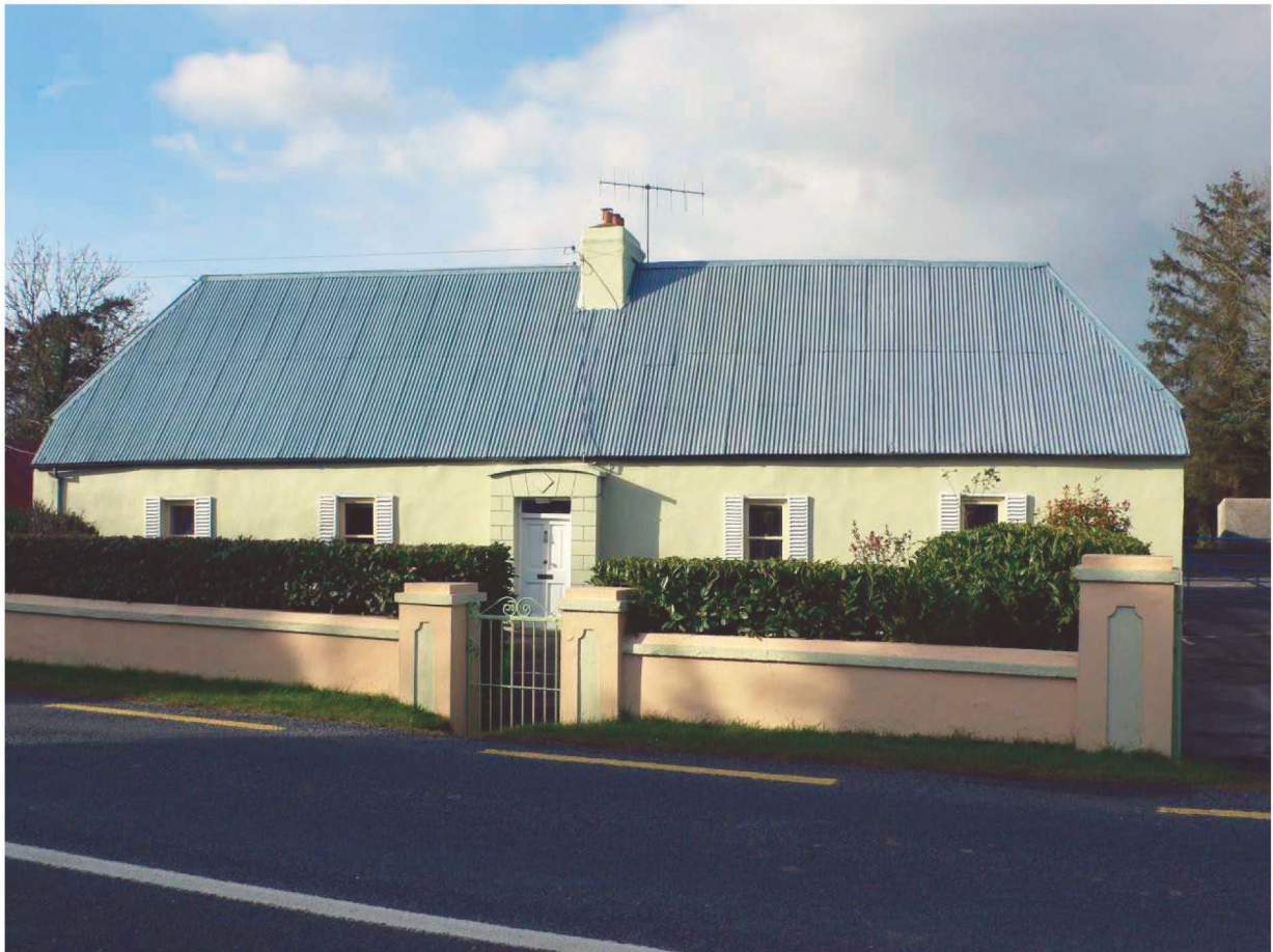
Well-maintained house near Banteer, Co. Cork (NIAH)

Our vernacular heritage is a key part of our rural and urban landscapes. It comprises houses, buildings, structures and features that were built by 'ordinary' people, along with their neighbours, using ideas and methods passed down within families and communities. These traditions are also part of a shared culture of building that is found throughout the world. Thus, our vernacular heritage reflects the creativity of our forebears, provides a link with the past and is worthy of our admiration and respect. Our vernacular heritage is crucial for local distinctiveness and gives our familiar landscapes their character. Many urban dwellers are only a couple of generations removed from vernacular houses, so everyone has an interest in their survival.