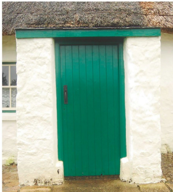
Windbreak and board door, Ros Muc, Co. Galway

Replacing old windows and doors with uPVC, metal or timber should be avoided, as this greatly diminishes the character and visual appeal of a building, as well as often needlessly wasting sound timber. Reversing the effects can be very costly.