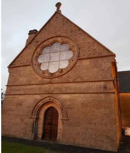
St. Mary's Church, Newtownbarry