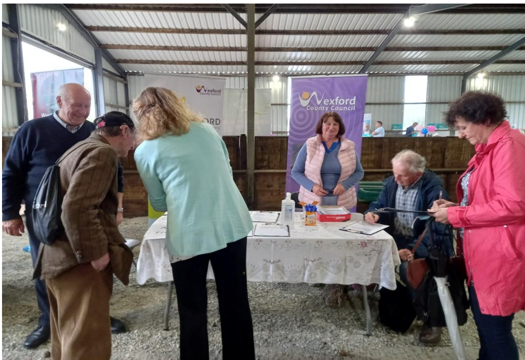
Age Friendly public consultation with farming community at IFA event

Consultation took place with older members of the farming community at an IFA Farm event on the Earle family farm in Ballycanew on Friday 10th September 2021.