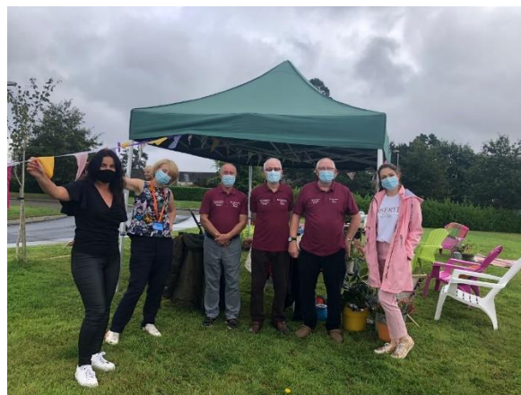
Men's Shed & Age Friendly Programme Manager meet Designers