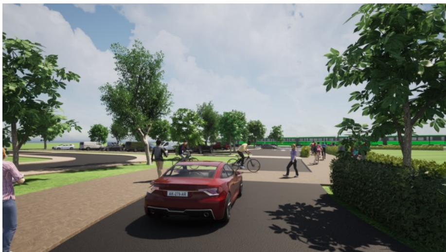
Figure 3 Proposed Carpark –Rosslare Strand