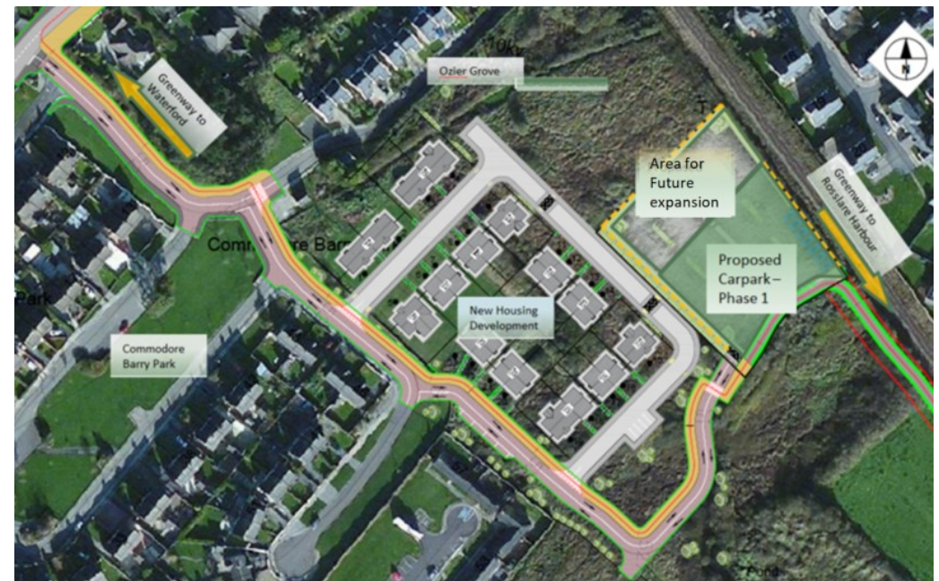
Figure 2 Proposed Carpark –Rosslare Strand

The proposed location of the carpark is outlined in the below map, just south of Mauritiustown Road railway bridge and to the east of a proposed new housing development. Access will be provided from Mauritiustown Road through the existing road network to Commodore Barry Park. A segregated three metre wide Greenway will be provided adjacent to the road to provide access to Rosslare Strand to the North and Rosslare Harbour to the south.