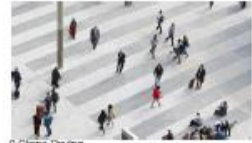
2 Stone Paving