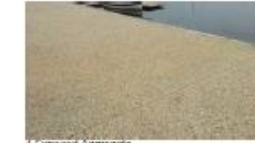
1 Exposed Aggregate