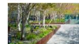
Raised Planter 'Glades'