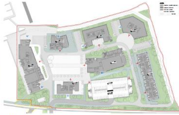
Site Layout - Ground Level