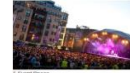
5 Event Space