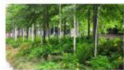
Screening Wooded 'Glades'