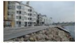
4 Flip Rap Stone