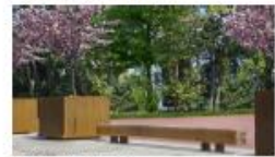
Planters with Seating