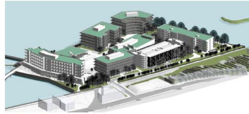
Bird's Eye View from West