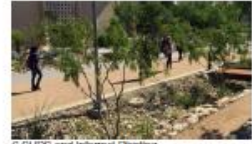
6 SUDS and Informal Planting