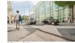
3 Shared Surface