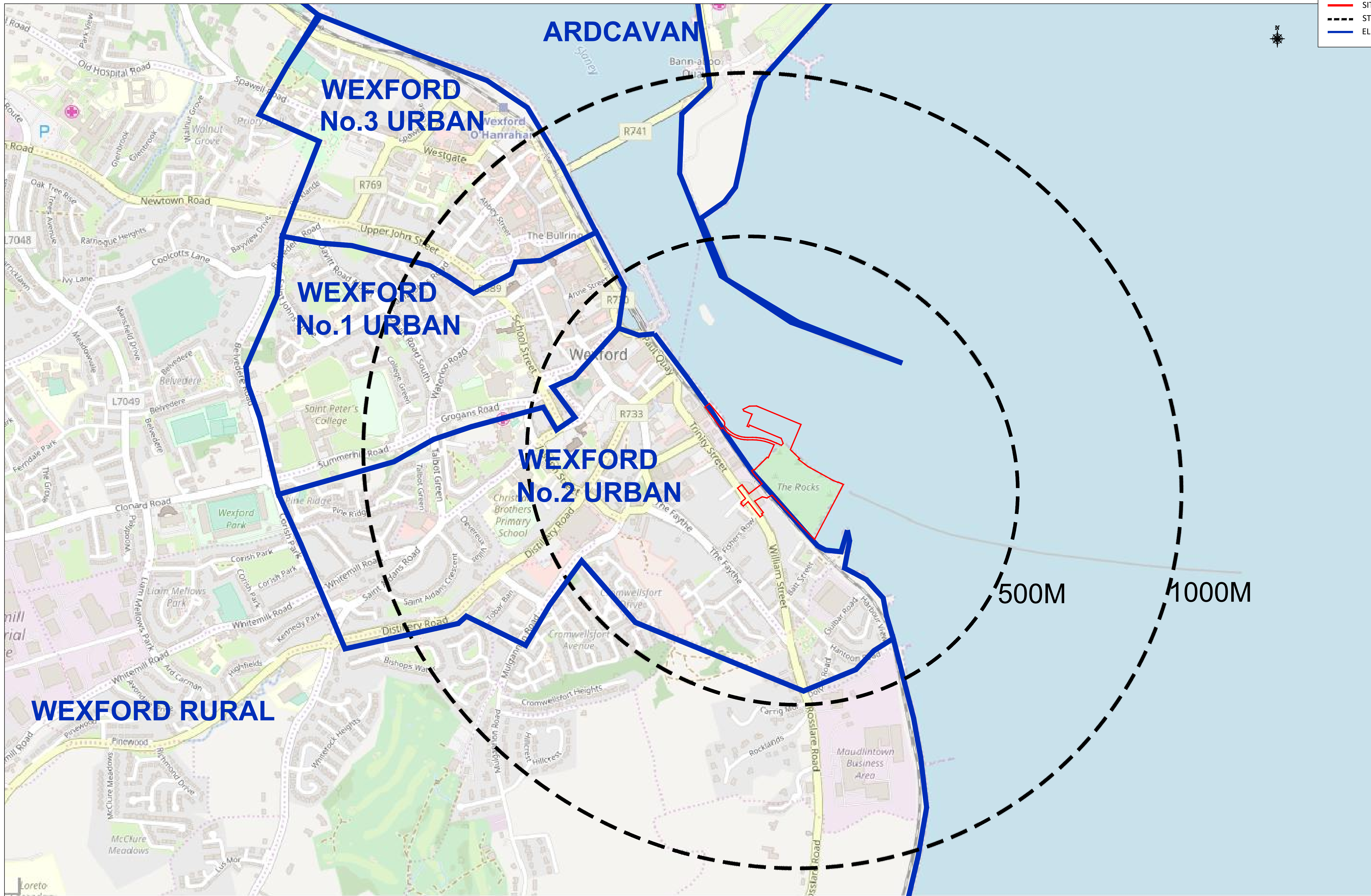
STUDY AREA A1 SCALE 1:6000 A3 SCALE 1:12,000