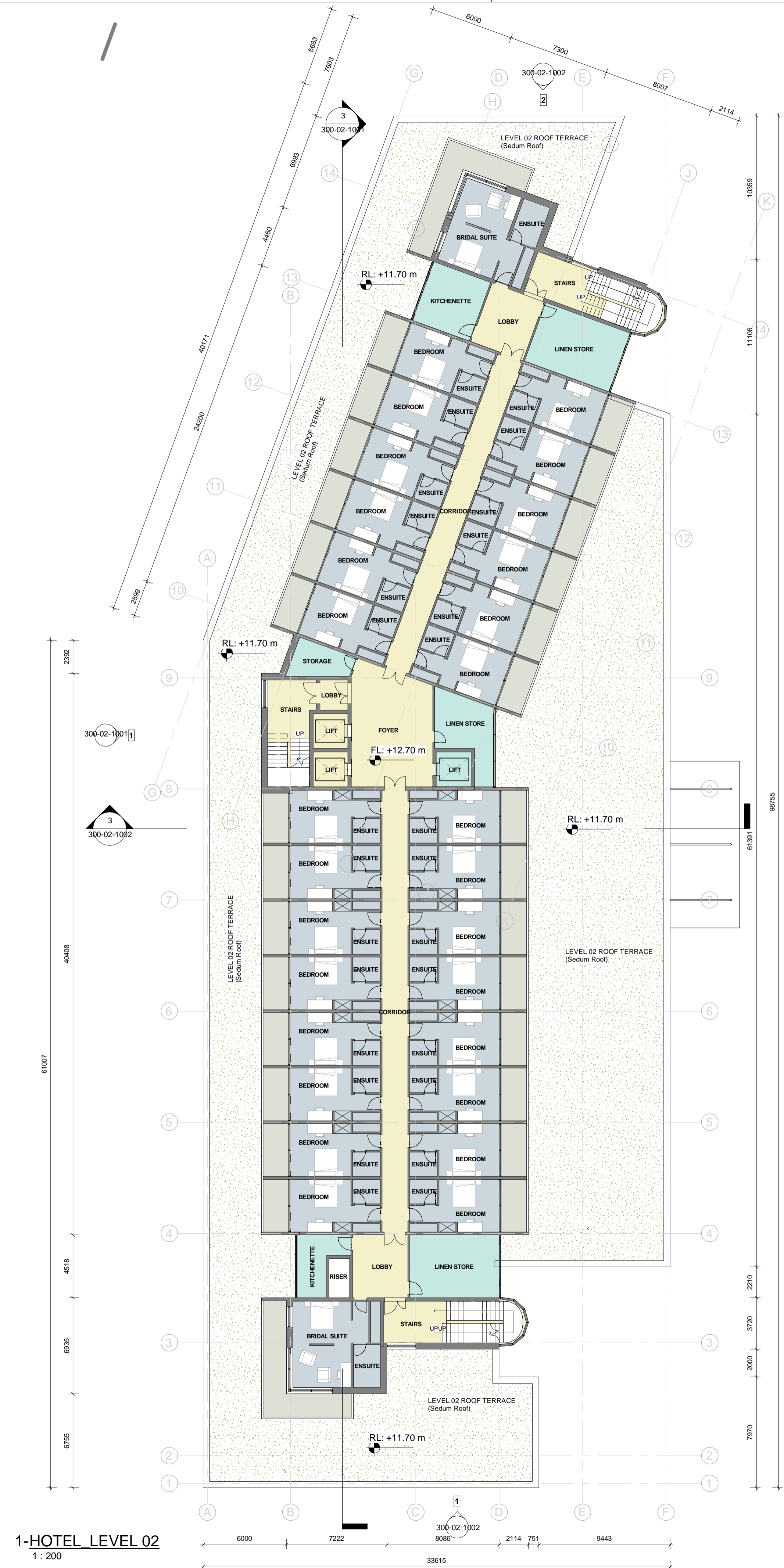
1-HOTEL LEVEL 02 1 : 200