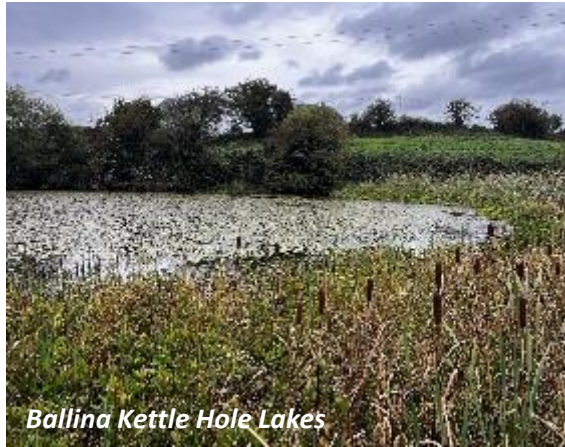
Ballina Kettle Hole Lakes

The survey suggests that many important wetland sites remain unrecorded throughout the county and further surveys are required to improve our knowledge of Wexford's wetland heritage.