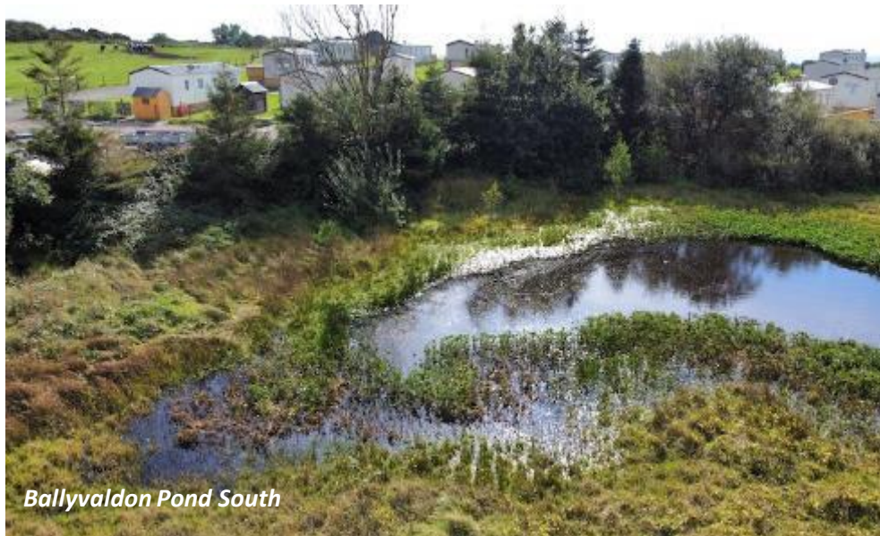
Ballyvaldon Pond South